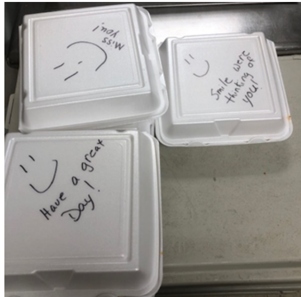
Pictured Above: Eldon Senior Center curbside meal boxes

Several centers began adding special messages to their curbside boxes to lift spirits and let those in the community know we are thinking about them. So many great ideas were pouring out of the Aging Best staff it was difficult to keep up. Aging Best encourages creativity and innovative thinking and staff are delivering. Some centers were playing curbside Bingo, providing word puzzles and other games for seniors to play in the comfort of their own homes.