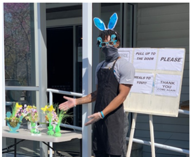
Pictured Above: Waynesville Curbside Easter Bunny

Staff at the Waynesville Senior Center wanted to put a smile on everyone's face. What better way than with the Easter bunny, cupcakes, and flowers.