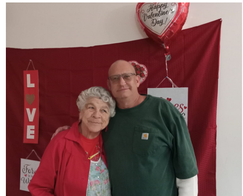
Cole Nutrition Center