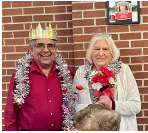
Hughes Senior Center