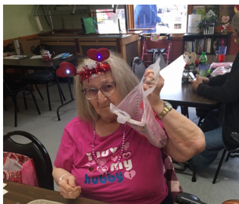
Rolla Nutrition Site