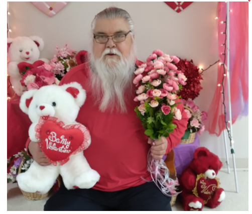
Sayers Senior Center