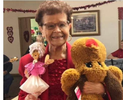
Dixon Senior Center