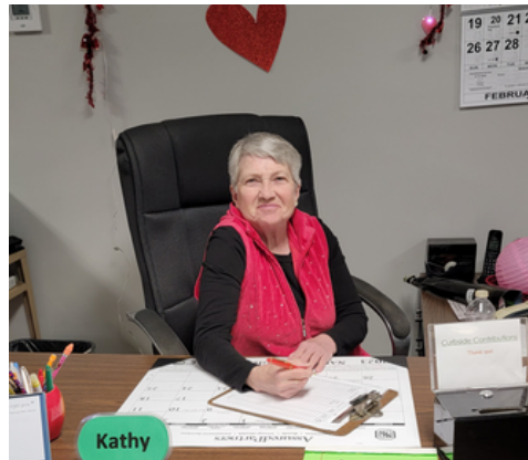
Fayette Senior Center