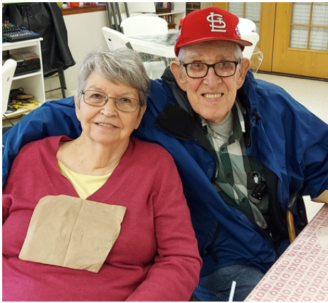
Salem Senior Center