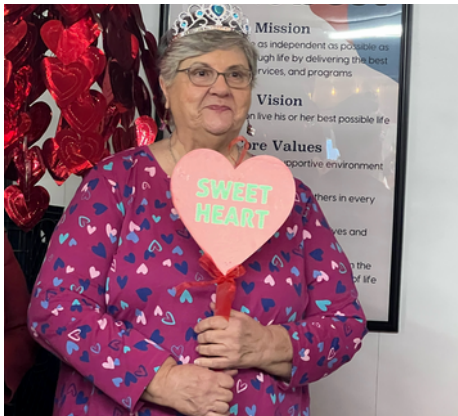
Tipton Nutrition Center