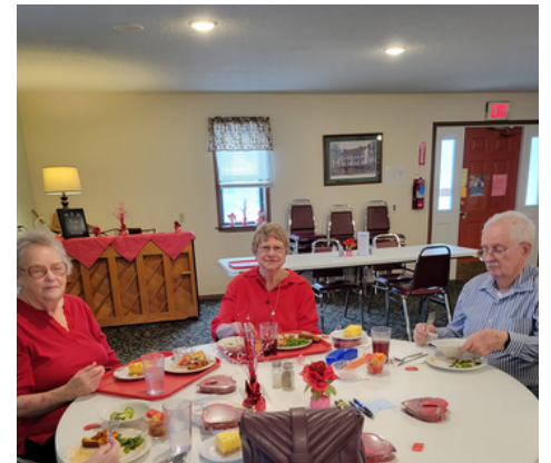
Waynesville Senior Center