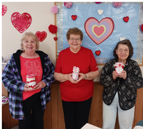
Cuba Senior Center