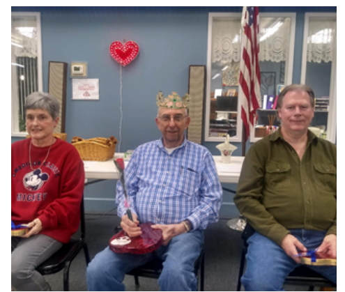
California Nutrition Center