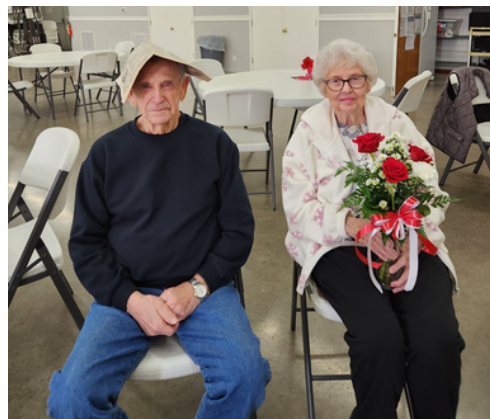
Bourbon Senior Center