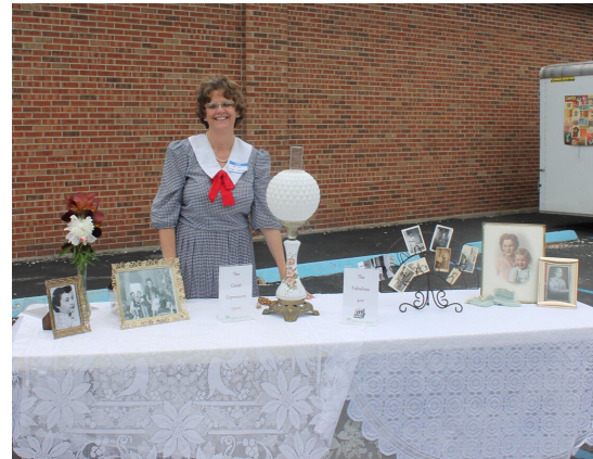
Pictured Above: California Nutrition Center's "Dash Through the Decades" party provided a drive through blast from the past for curbside participants. Staff, volunteers and board members participated in making the party a huge success.