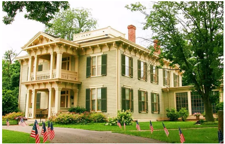
Antebellum Graceland Museum, Mexico, MO

After a great lunch at the Mexico Senior Center, a visit to Lakeview Park is the perfect way to spend the afternoon. The park features a 24-acre fishing lake with boat ramp and ADA fishing dock, a scenic 1.5 mile lakeside walking trail and much more.