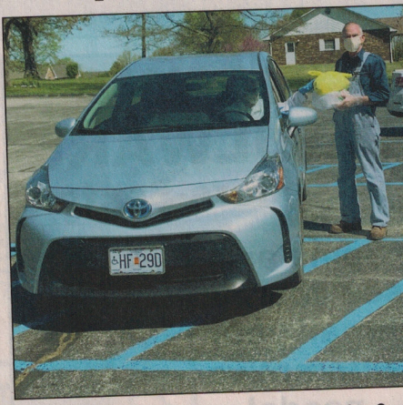
Left: The Dixon Senior Center is featured in the local Newspaper for their great work!

Dixon Senior Center serving drive up meals to local seniors