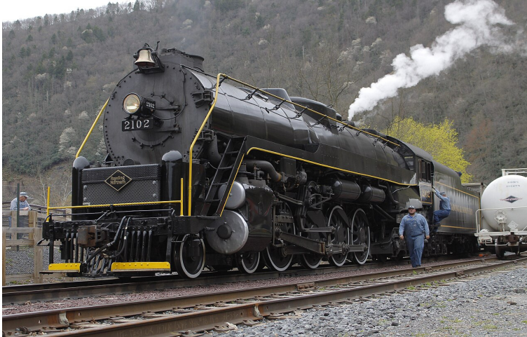
Reading Blue Mountain and Northern 2102

This year our annual convention will be held in Hazleton, PA. The highlight of our convention is an all day steam powered excursion on Saturday at the Reading Blue Mountain and Northern behind the behemoth 4-8-4, Reading 2102. We will also have a special chartered train on Sunday at the Allentown & Auburn Railroad in Kutztown, PA.