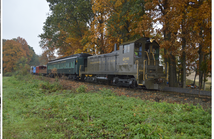
Allentown and Auburn 206