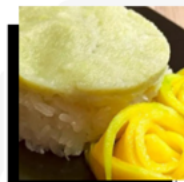
IC5. Sticky Rice With Coconut and Steamed Egg Custard (Xoi Trung Hap Nuoc Dua)