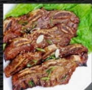
CBT6. Saigon Grilled Beef ( Bo Nuong Saigon ) $25.95