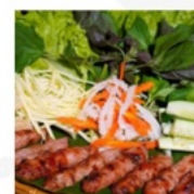
CBT13. Vietnamese Grilled Nem Nuong - Pork and Shrimp ( Nem Nuong Vietnam ) $25.95