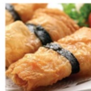
CBT9. Saigon Fried Shrimp Rolls Tofu ( Tom Cuon Saigon Dau Hu Ky ) $25.95