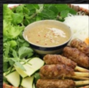
CBT5. Grilled Nem Lui Hue Kabob ( Nem Lui Hue ) $25.95