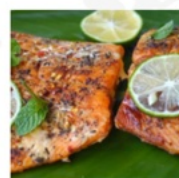
CBT10. Grilled Salmon ( Ca Hoi Nuong ) $25.95