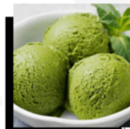
IC3. Green Tea Ice Cream (Kem Tra Xanh)