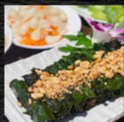
CBT1. Grilled Beef-Wrapped In Betel Leaves ( Bo Cuon La Lot ) $25.95

Served with peanut hoisin sauce or garlic lemon fish sauce mix with vegetables, noodles, fish cakes & egg rolls.