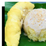
IC6. Sticky Rice With Durian (Xoi Sau Ring)