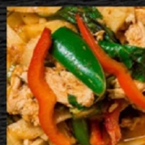
PP2. Spicy Pad Ped