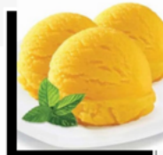
IC2. Mango Ice Cream (Kem Xoai)