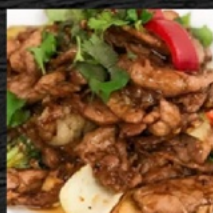
PR4. Pad Garlic