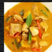
RC6. Red Curry