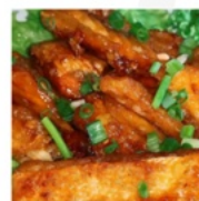
CBT11. Crispy Fried Salmon ( Ca Hoi Chien Gion ) $25.95