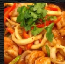
PP3. Pad Prik Pow