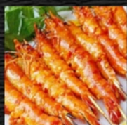
CBT4. Grilled Shrimp ( Tom Nuong ) $25.95