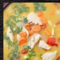
YC5. Yellow Curry