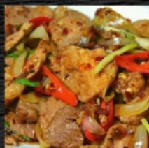
PB1. Pad Basils

Choice of: chicken, beef, pork or tofu $15.95 shrimp $16.95 | Seafood $20.95 Combination: chicken, beef & shrimp $18.95