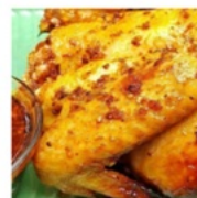
CBT8. Hue Grilled Chicken ( Ga Nuong Xa Nghe Hue ) $25.95