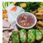
CBT12. Fried Tofu Shrimp and Pork ( Dau Hu Mam Tom Cha Com ) $25.95