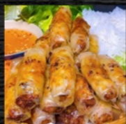
CBT3. Imperial Crab Meat Egg Rolls ( Cha Gio Tom Cua ) $25.95