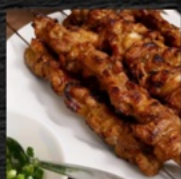
CBT7. Hanoi Grilled Pork ( Cha Nuong Hanoi ) $25.95