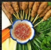
CBT2. Grilled Shrimp Paste With Sugar Cane ( Chao Tom ) $25.95