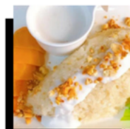
IC4. Sticky Rice With Mango (Xoi Xoai Thai)