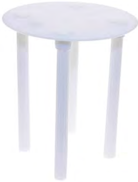
LOCKING COLUMNS & PLATE