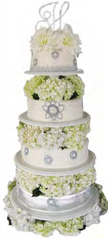
Towering Tiers Stand shown with cake