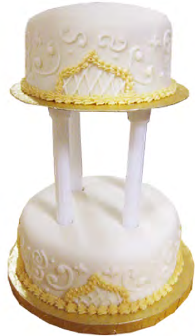
Locking Columns & Plate Shown with cake tiers