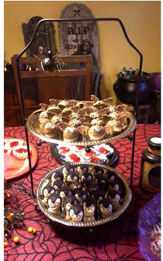
Spider Web Stand Shown with truffles & silver plates