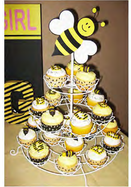
Wire Cupcake Stand Option A Shown with cupcakes & optional custom cupcake stand decoration