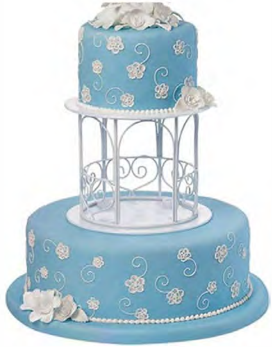
Garden Gazebo Shown with cake