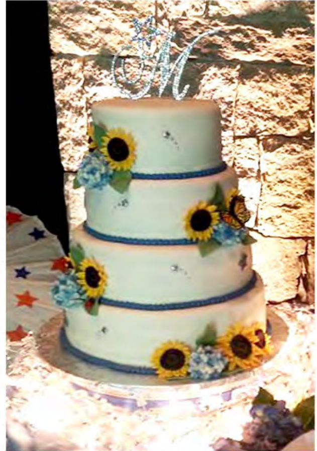
Bling Cake Stand

Shown with a 1st Birthday Cake (ribbon swapped out to coordinate with cake)