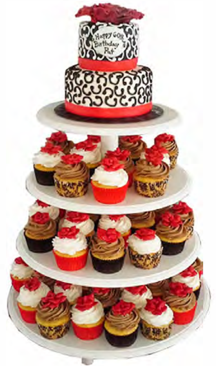
Towering Tiers Stand shown with cake & cupcakes (can also use just cupcakes)