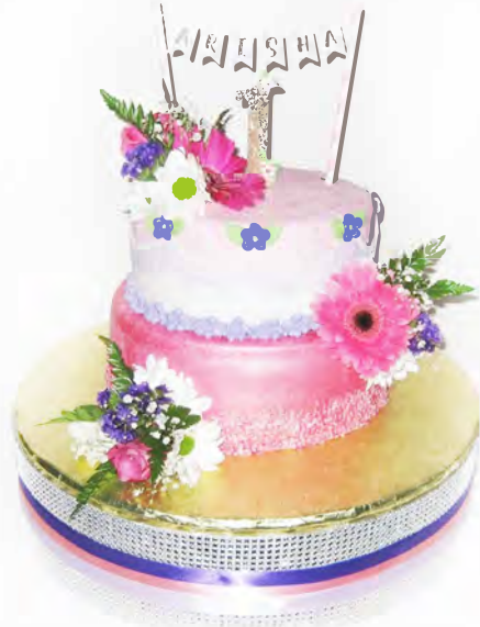
Bling Cake Stand

Shown with a 1st Birthday Cake (ribbon swapped out to coordinate with cake)