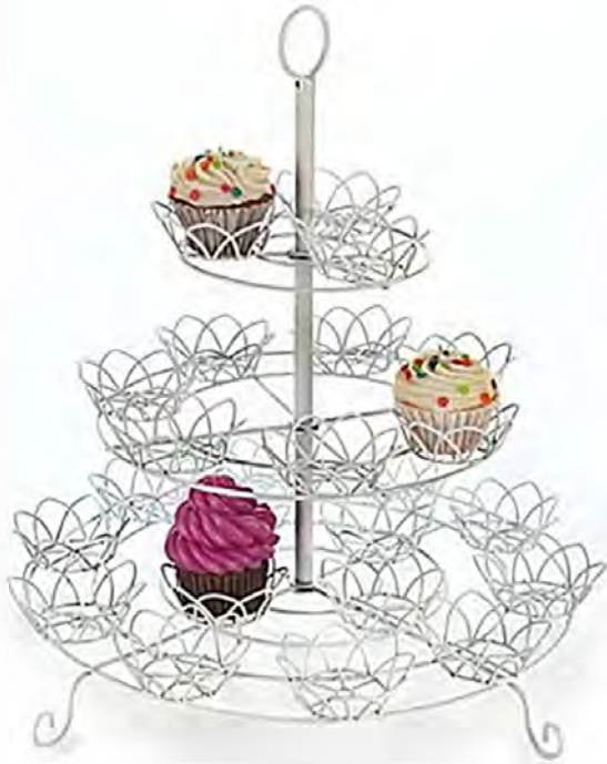
Option A - (2 Available)