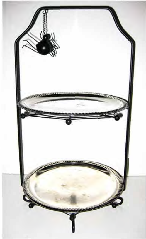
Shown with silver plates