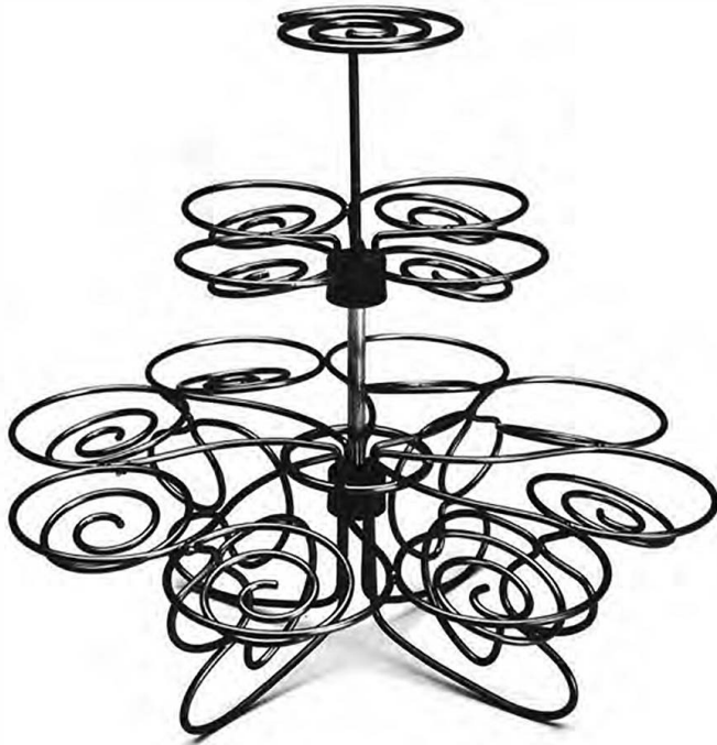
SMALL WIRE CUPCAKE STAND