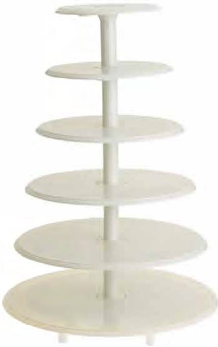
TOWERING TIERS STAND