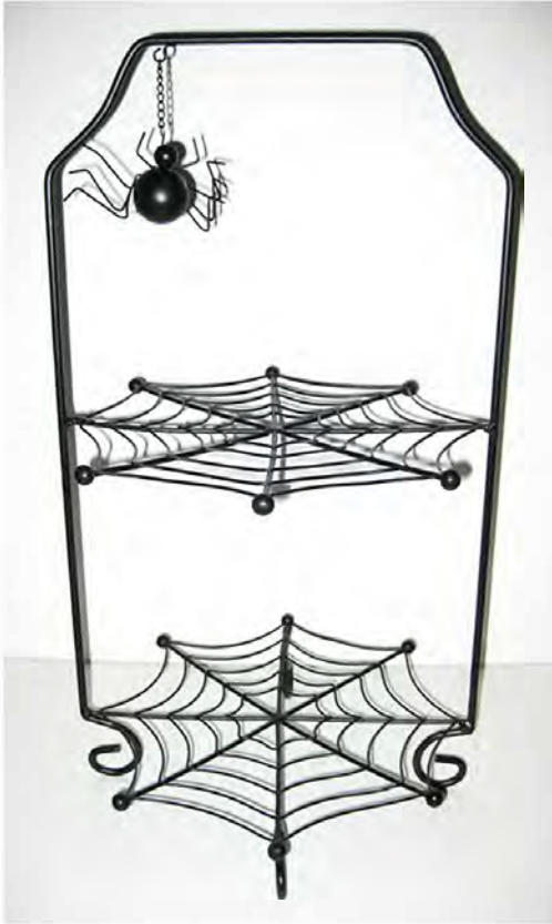
Shown with out silver plates