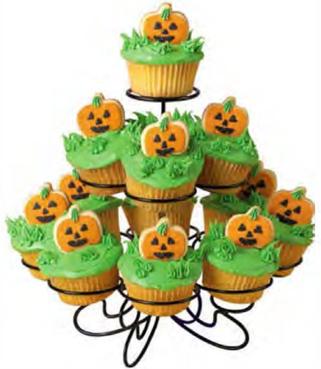
Small Wire Cupcake Stand Shown with cupcakes