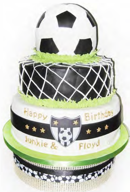
Custom Cake Stand Soccer Theme Shown