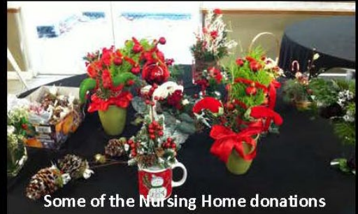
Some of the Nursing Home donations

Floor Designs From November 2019 Christmas Presence or Presents