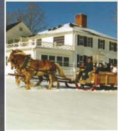
Winter Sleigh Rides