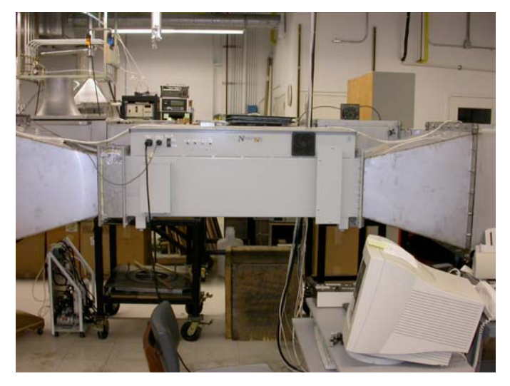
Figure 2-1. BioProtector BP114i installed in the test rig. The ballast boxes are on the top of the device.