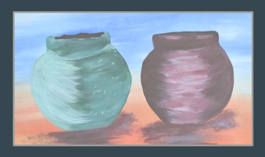
PAUSE TO SEE BEAUTY IN EACH OTHERS VESSEL

Learning more about each other's story of restoration helps us to see past the outer shell and into the heart, where our purpose is colored the brightest.