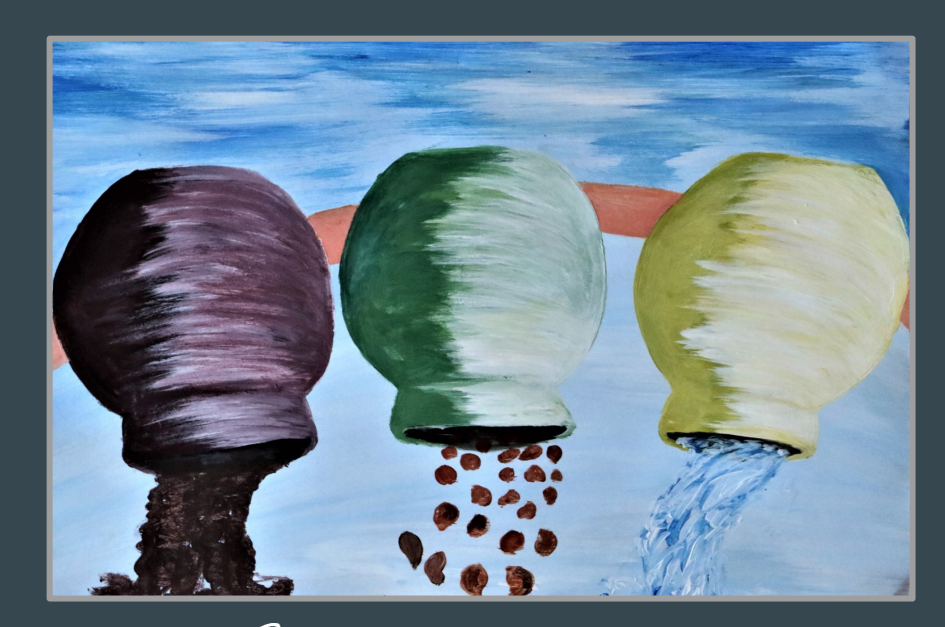
POUTZ DITZT, SEED AND WATETZ INTO OTHETZS JATZS

Dirt will do nothing without the seed, the seed nothing without dirt, and dirt nothing without water. We were created to need what is in each heart to fully grow and bear fruit together.