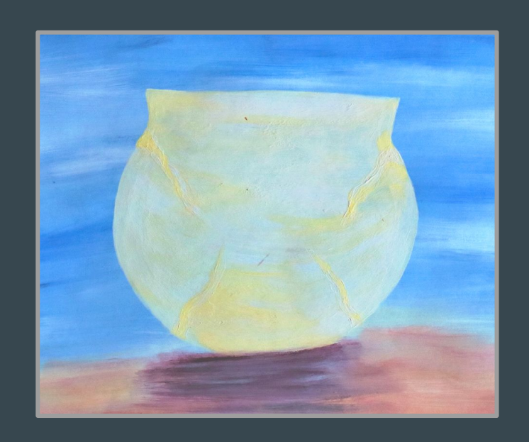
PICK UP AND SHOW DUTZABILITY

As we experience peace and wholeness with God, we are safer to accept and use our grief and gifts. Sometimes the parts of us that hurt the most are the parts that prepare us to love the deepest.