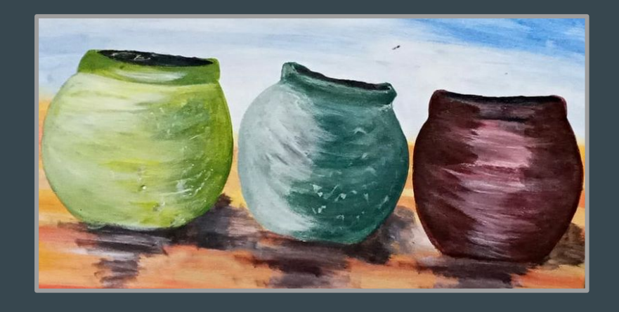
FILL VESSELS WITH WATER, DIRZT, & SEED

Recognizing God's presence in our broken life story unveils our purest, most relevant gifts.