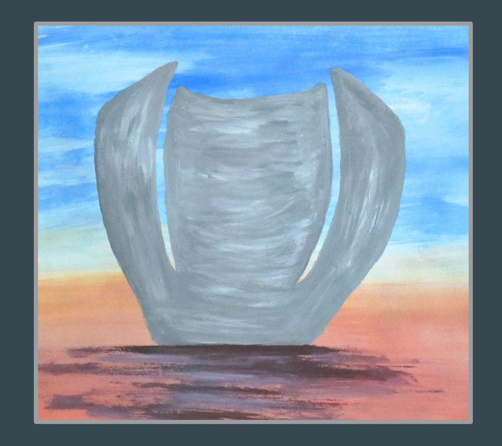
RAISE SIDES UP

As we listen to God's direction, we see from a new perspective and begin to realize who we are becoming with Him.