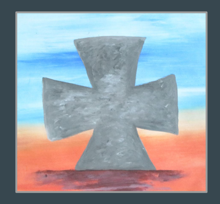
DISPLAY CIZOSS SHAPE

This image resides in each one of us; our foundational shape is the same.