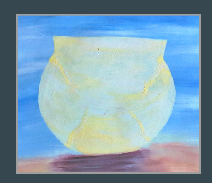
PTZESENT AS TZAW

We will get the most joy from what we do and be the most effective in expressing God's love when we are real (raw).