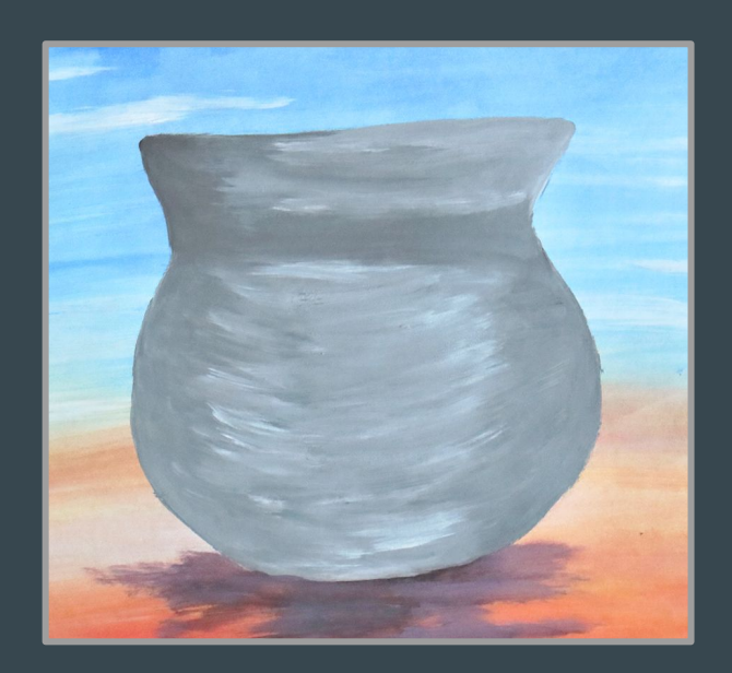
POINT OUT CTEACKS

He sees our deepest cracks and impurities and wants to make us whole again. "Do not hide what God wants to heal" (Pastor Dominick).