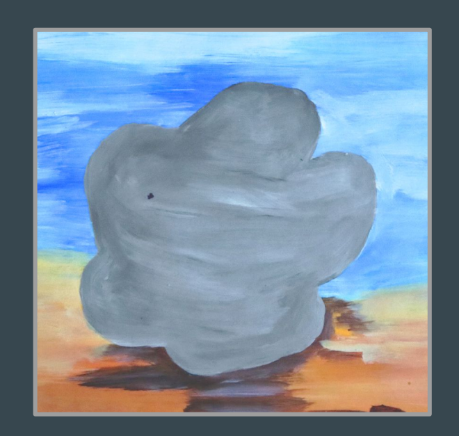
BEGIN WITH A BALL OF CLAY

God does not intend for our lives to simply be a story of "dust to dust." He wants a loving relationship with us, which extends far beyond earth into eternity.