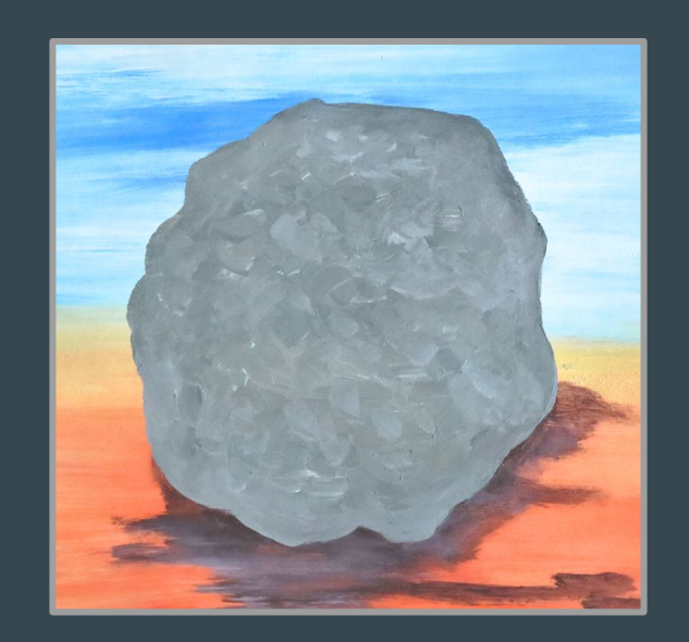
SOFTEN & FLATTEN INTO CITCLE

Hard clay is rigid and challenging to use, yet as we allow God into our life more and more, we will become softer and easier for Him to mold.