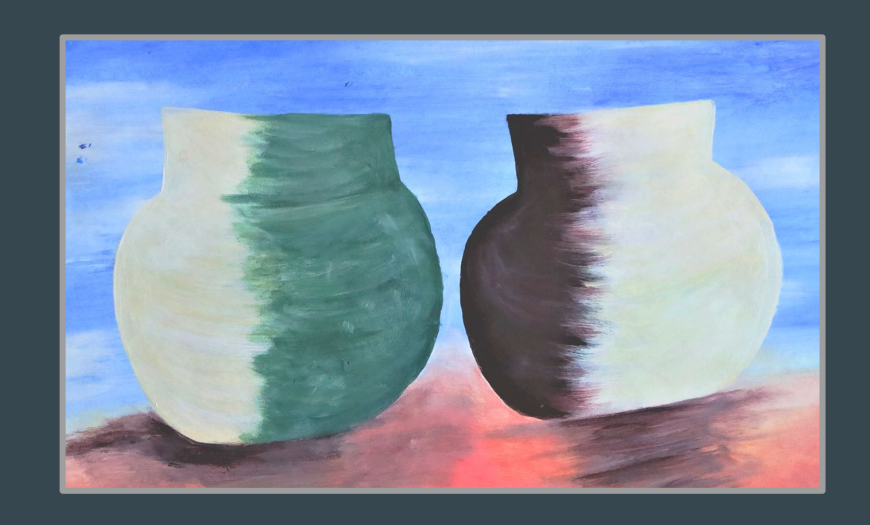
ADD COLOTZ - ILLUMINATE UNIQUENESS

Color tends to settle and become brightest in our deepest cracks. The parts of our story that make us unique are exactly how God can use us to love differently in the world.deepest.