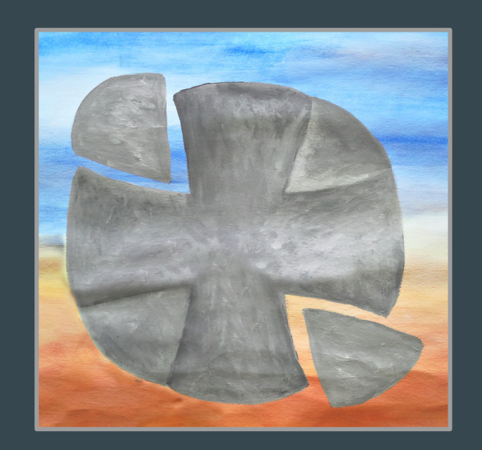
TIZIM OUT COTZNETZS

Other times this is a longer process of letting go. No matter what, God sees and loves us through our dirt for who we really are: His child.