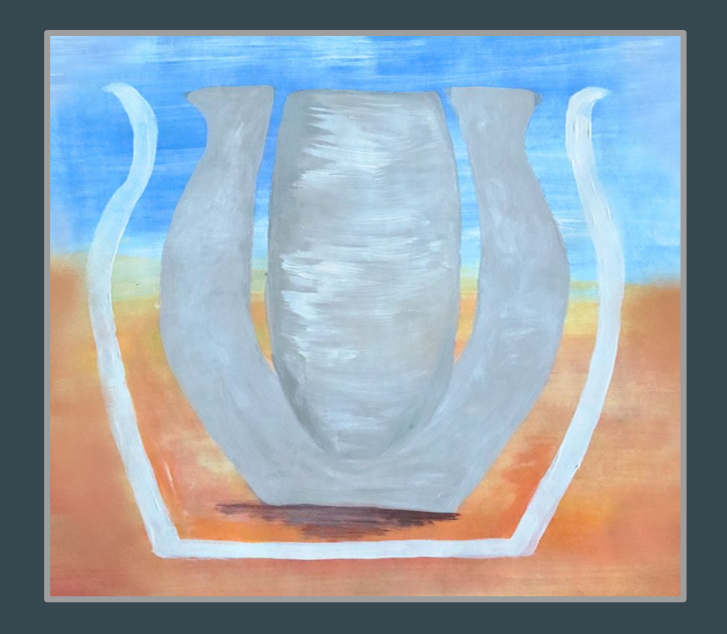
PIZESS INTO MOLD SHAPE

God used Jesus's life on earth as a perfect mold for us to resemble and rest in. His example holds us together and provides an image for us to identify with so we don't try to fit into the empty categories and expectations of the world.