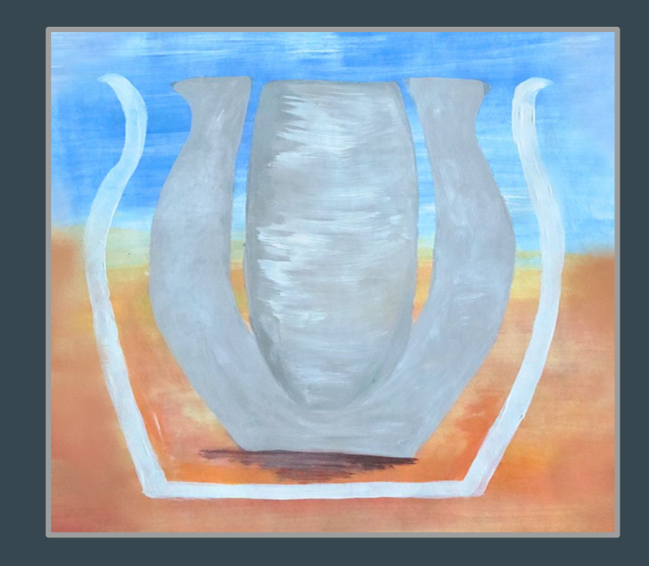
PIZESS INTO MOLD SHAPE

God used Jesus's life on earth as a perfect mold for us to resemble and rest in. His example holds us together and provides an image for us to identify with so we don't try to fit into the empty categories and expectations of the world.