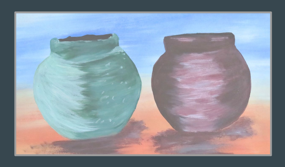
PAUSE TO SEE BEAUTY IN EACH OTHERS VESSEL

Learning more about each other's story of restoration helps us to see past the outer shell and into the heart, where our purpose is colored the brightest.