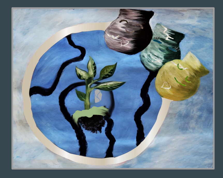
EVETZY JATZIS FILLED - GEZOWING TOGETHETZ

Yet these precious gifts buried deep in our hearts are meant to be planted and used to restore something beautiful on earth as it is in heaven . . . Just Relationships!