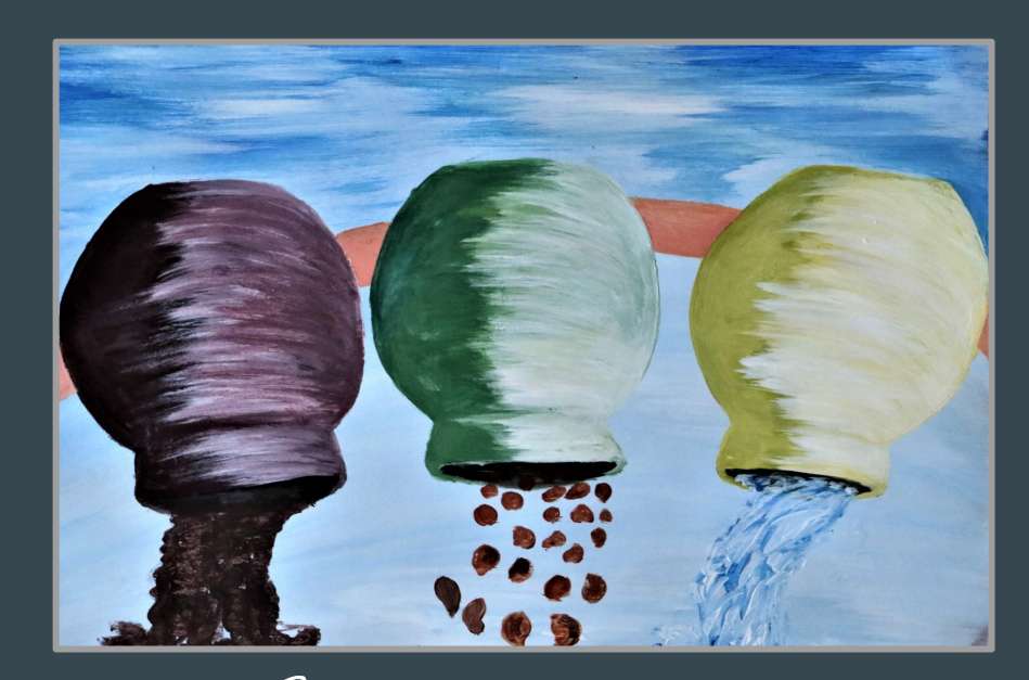
POUTZ DITZT, SEED AND WATETZ WTO OTHETZS JATZS

Dirt will do nothing without the seed, the seed nothing without dirt, and dirt nothing without water. We were created to need what is in each heart to fully grow and bear fruit together.