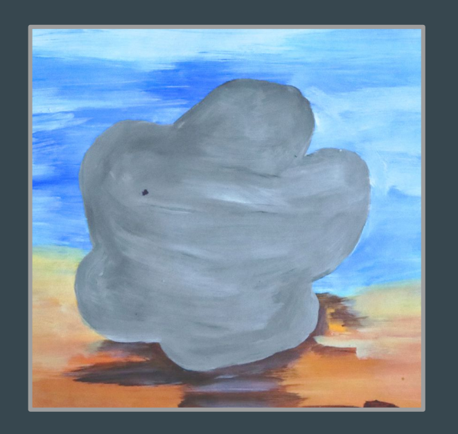
BEGIN WITH A BALL OF CLAY

God does not intend for our lives to simply be a story of "dust to dust." He wants a loving relationship with us, which extends far beyond earth into eternity.