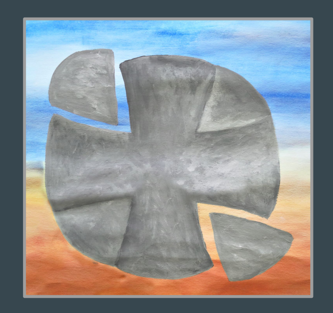
TIZIM OUT COTZNETZS

Other times this is a longer process of letting go. No matter what, God sees and loves us through our dirt for who we really are: His child.