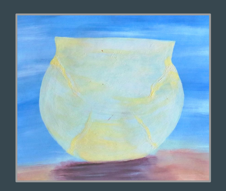
PIZESENT AS IZAW

We will get the most joy from what we do and be the most effective in expressing God's love when we are real (raw).