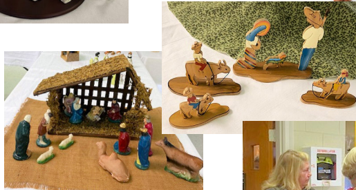
DoK Coffee Hour—Dec 11