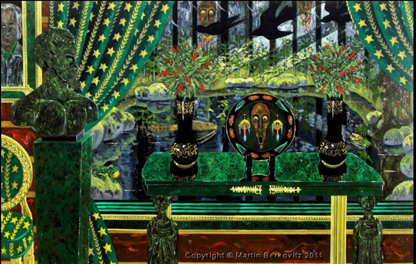
“A Room in the Forest” Oil on Linen, 66 in. x 102 in. - 2010