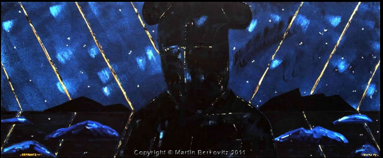
“Mother North” Oil on Linen, 20 in. x 48 in. - 2010