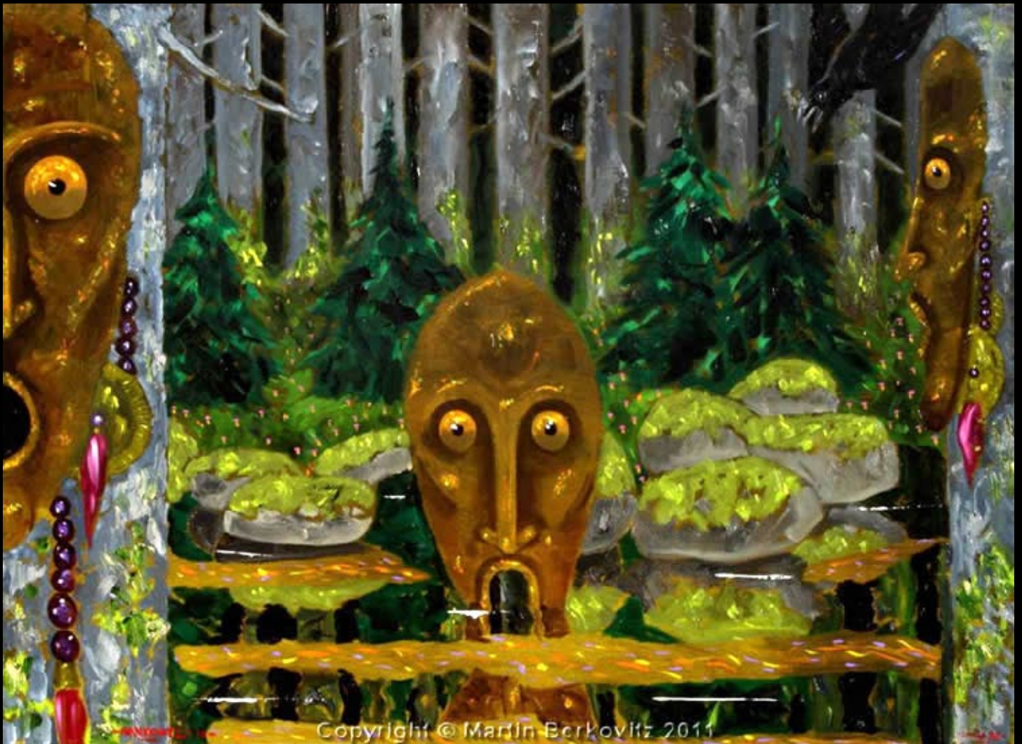
“Watchers” Oil on Linen, 30 in. x 40 in. - 2010