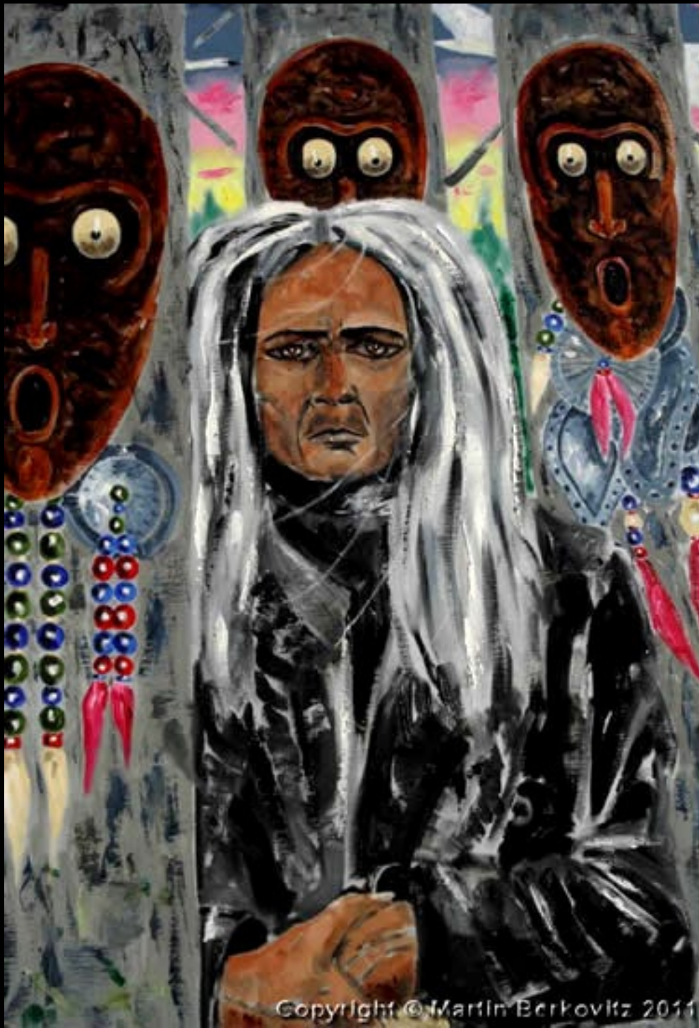
"Sibir (detail)" - 2010