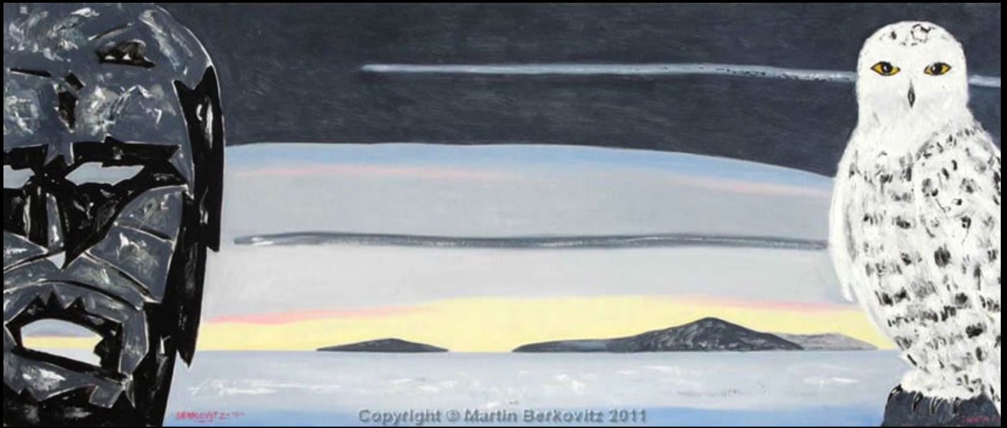
“Arctic Vista” Oil on Linen, 20 in. x 48 in. - 2010