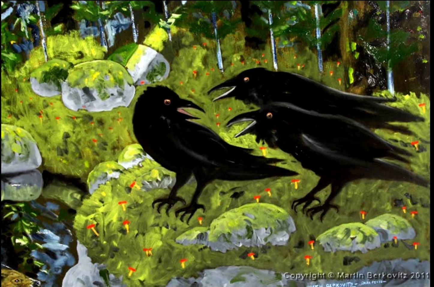
“Northern Goldenland (detail)” - 2010