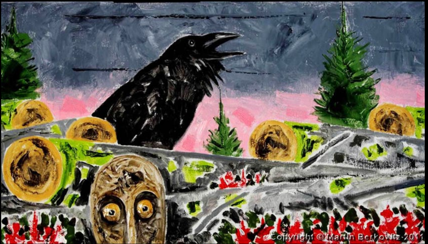
"Clear Cut (detail)" - 2010