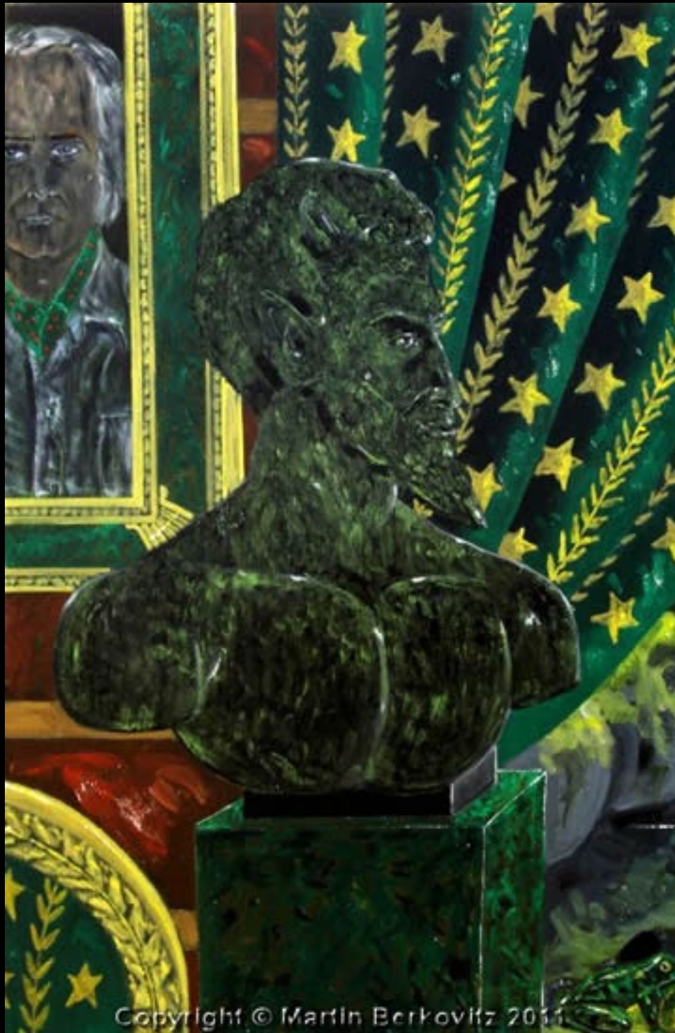
"A Room in the Forest (detail)" - 2010