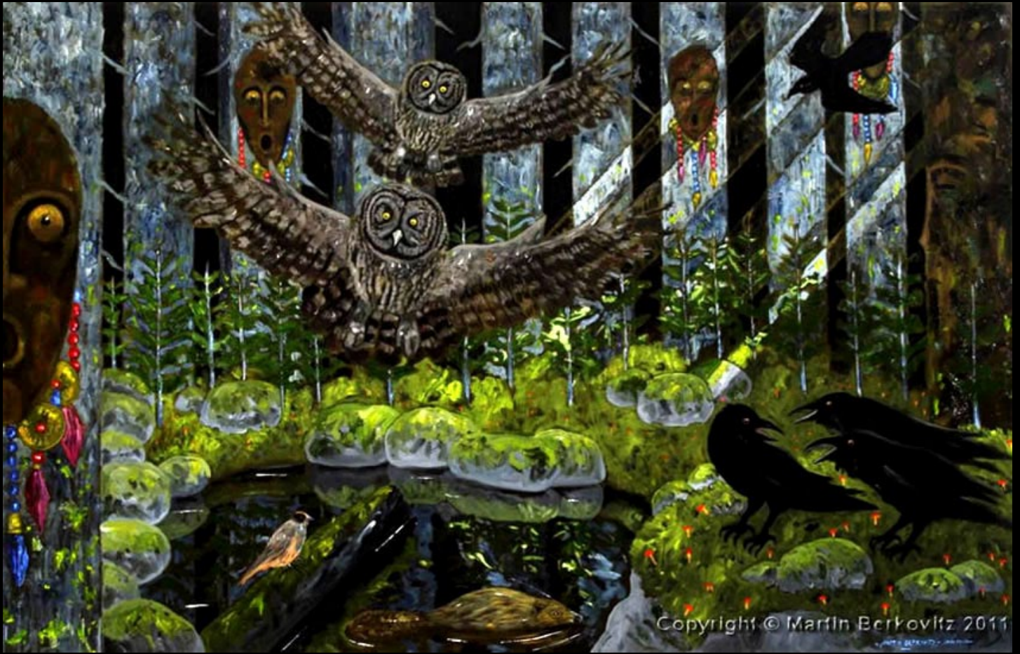
"Northern Goldenland" Oil on Linen, 66 in. x 102 in. - 2010