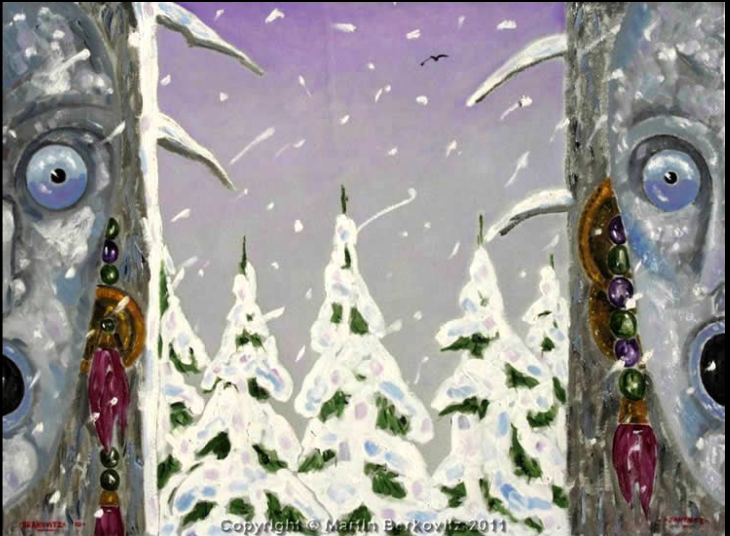
“Eternal Frost” Oil on Linen, 30 in. x 40 in. - 2010