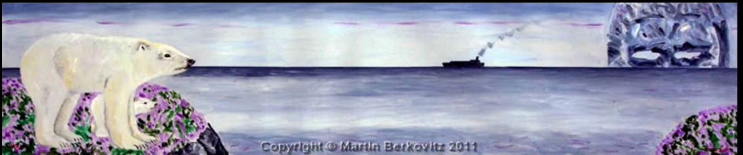
“Ice Free” Oil on Linen, 20 in. x 96 in. - 2010