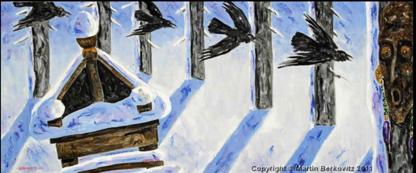
“Siberian Shrine” Oil on Linen, 20 in. x 48 in. - 2010