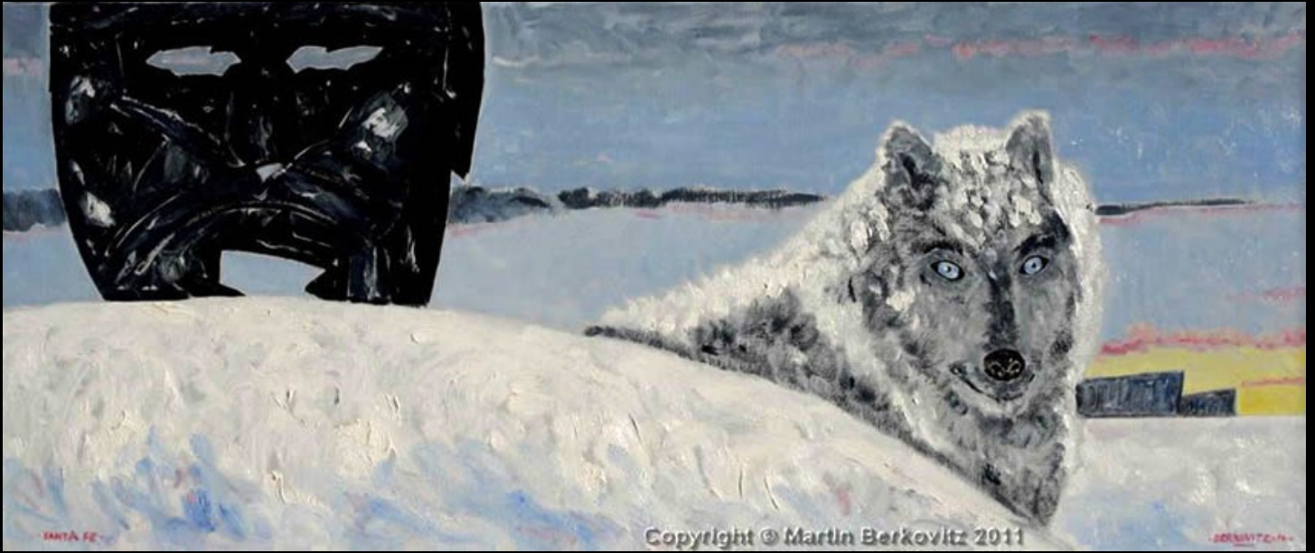
“Guardian” Oil on Linen, 20 in. x 48 in. - 2010