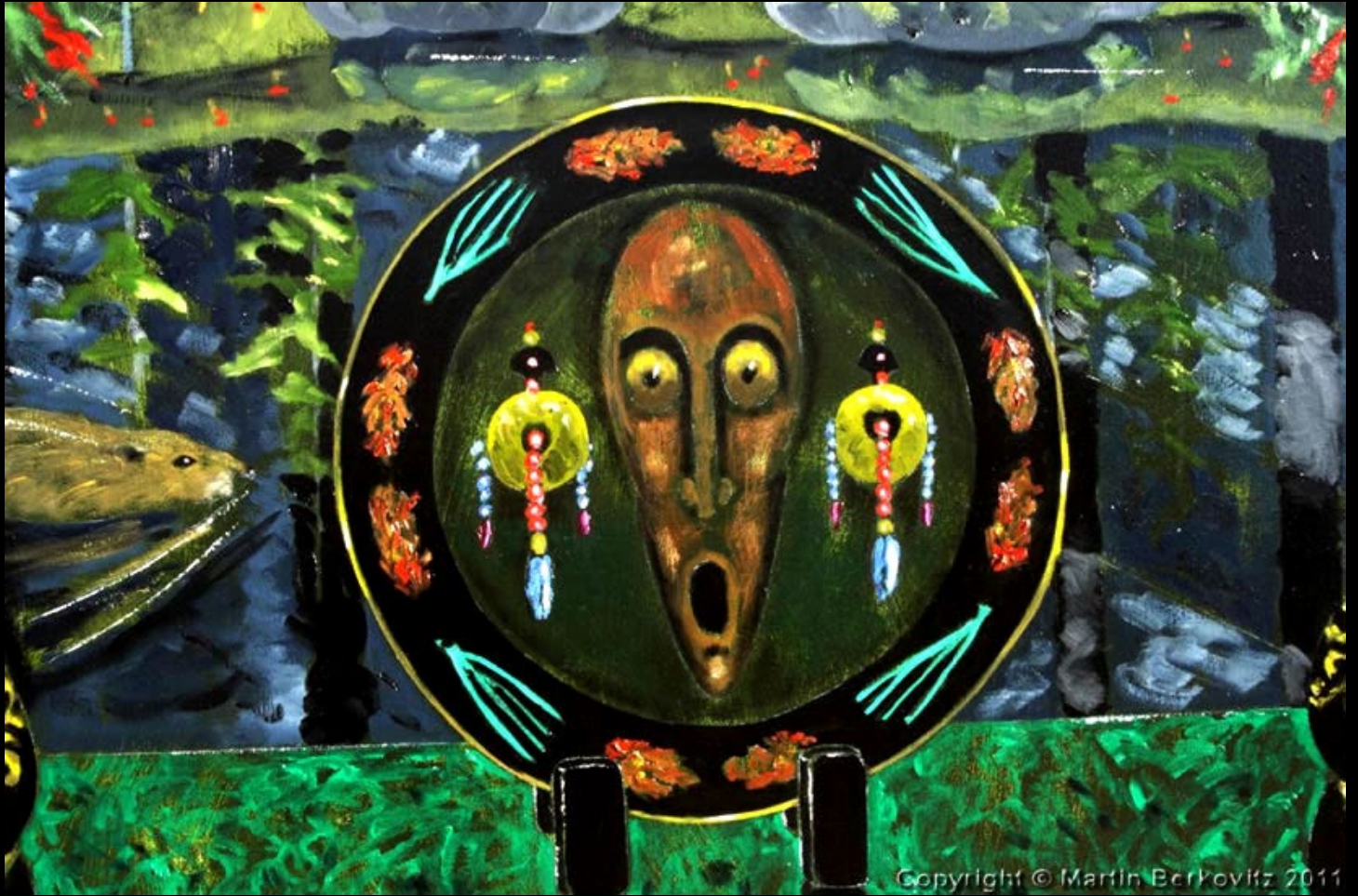
"A Room in the Forest (detail)" - 2010