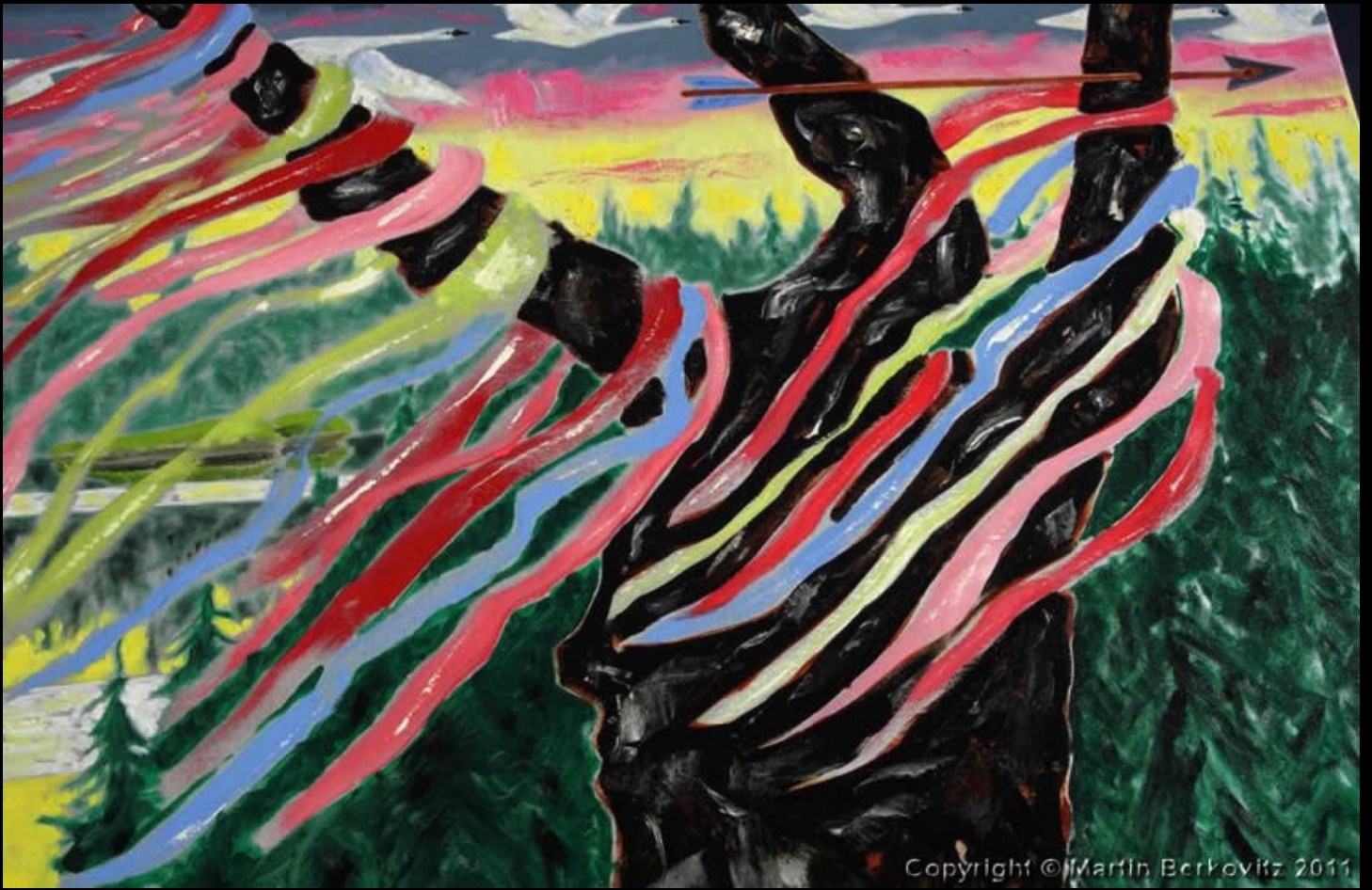
"Sibir (detail)" - 2010