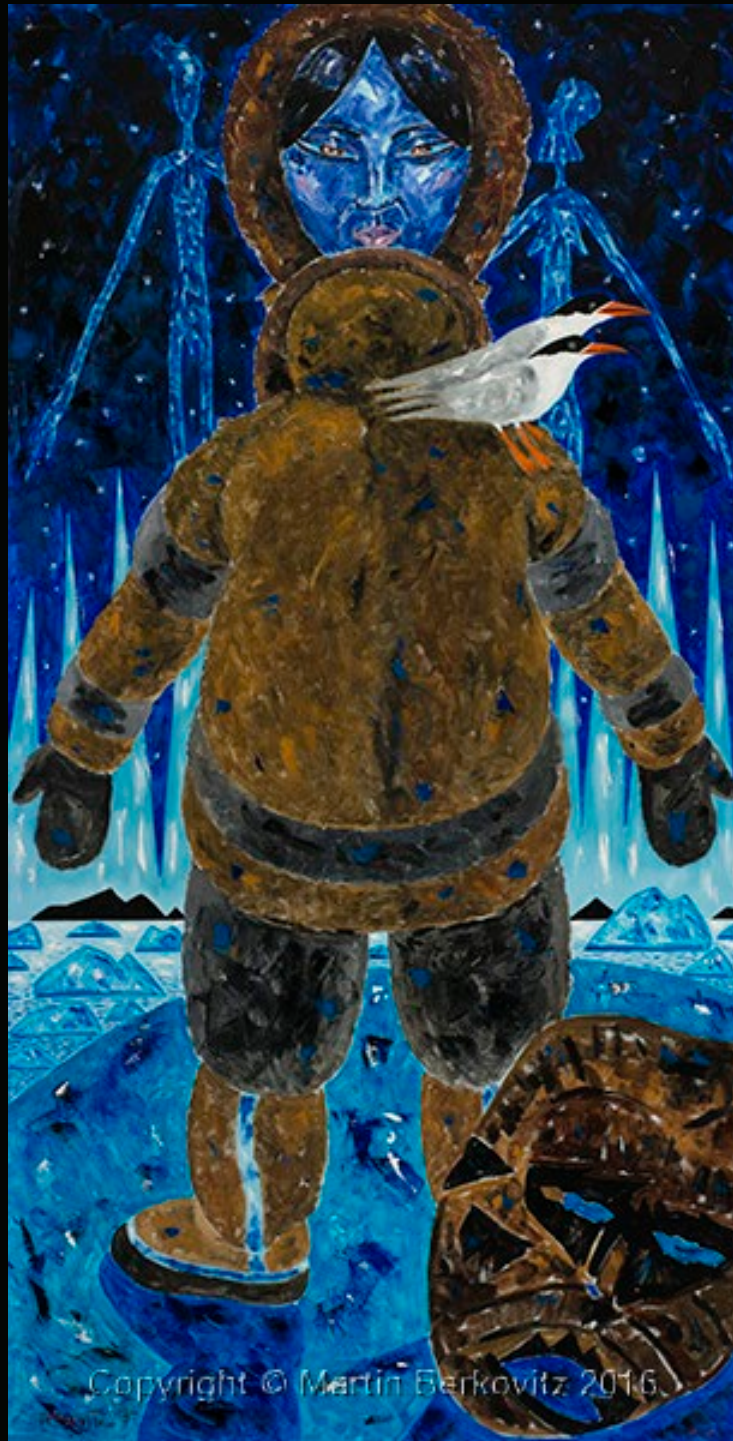
“Last Look” Oil on linen, 45 in. x 90 in. - 2013