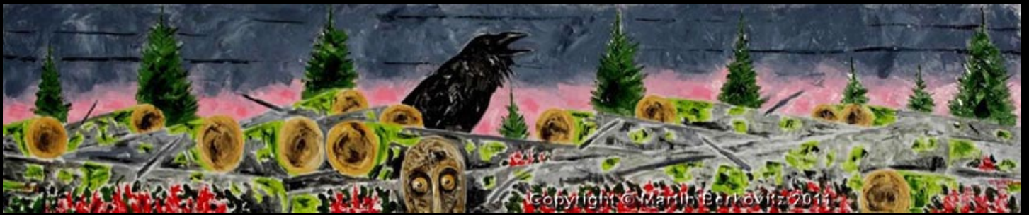
"Clear Cut" Oil on Linen, 20 in. x 96 in. - 2010