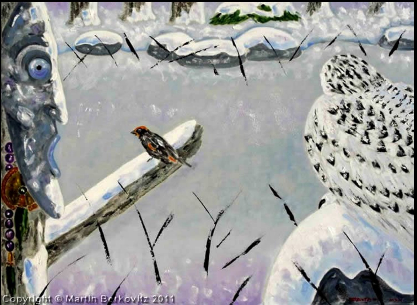
"Frozen Bog" Oil on Linen, 30 in. x 40 in. - 2010