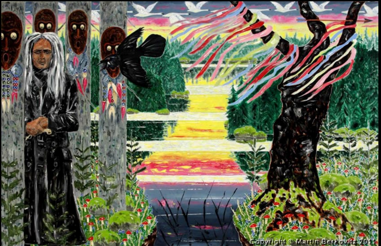
"Sibir" Oil on Linen, 78 in. x 120 in. - 2010