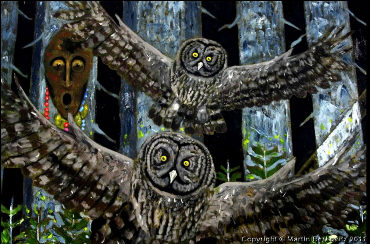
“Northern Goldenland (detail)” - 2010