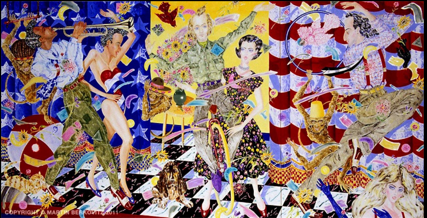
“The American Theatre You Always Knew & Always Loved” Oil on Canvas, Overall 102 in. x 198 in. - 2003-2004