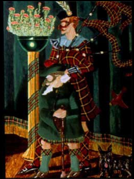
“The Scottish Theatre You Always Knew & Always Loved” Oil on Canvas, Each panel 52 in. x 70 in., Overall 70 in. x 176 in. - 1993