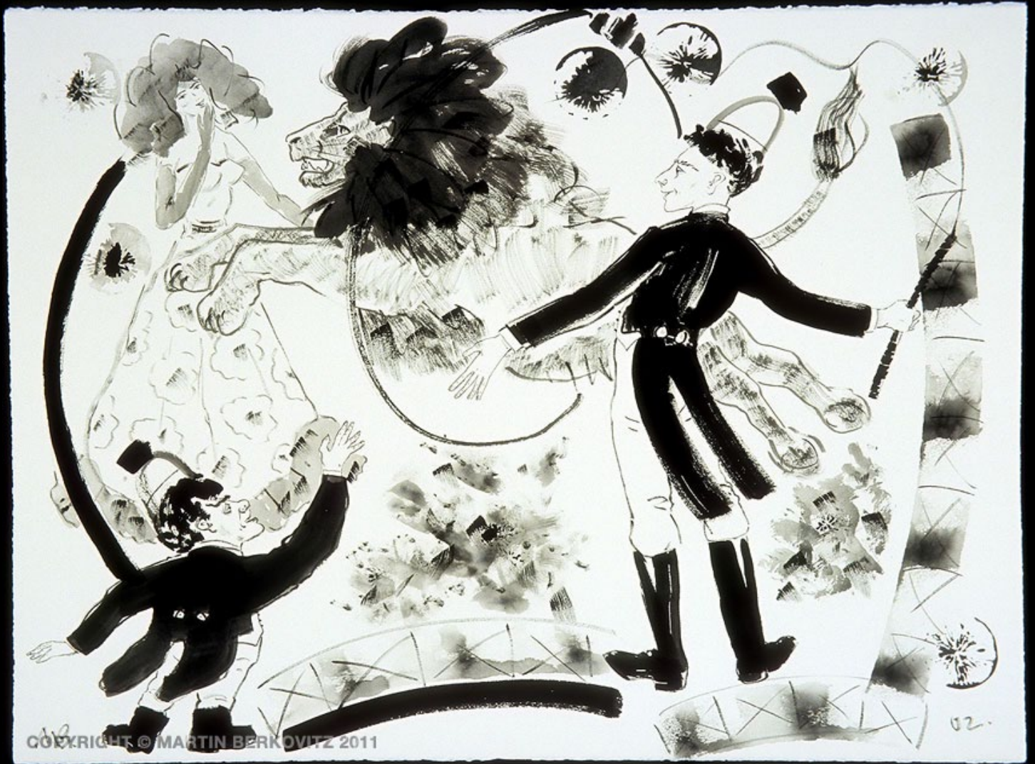
“Lion’s Leap” Brush + Ink on Paper, 22 in. x 30 in. - 2002