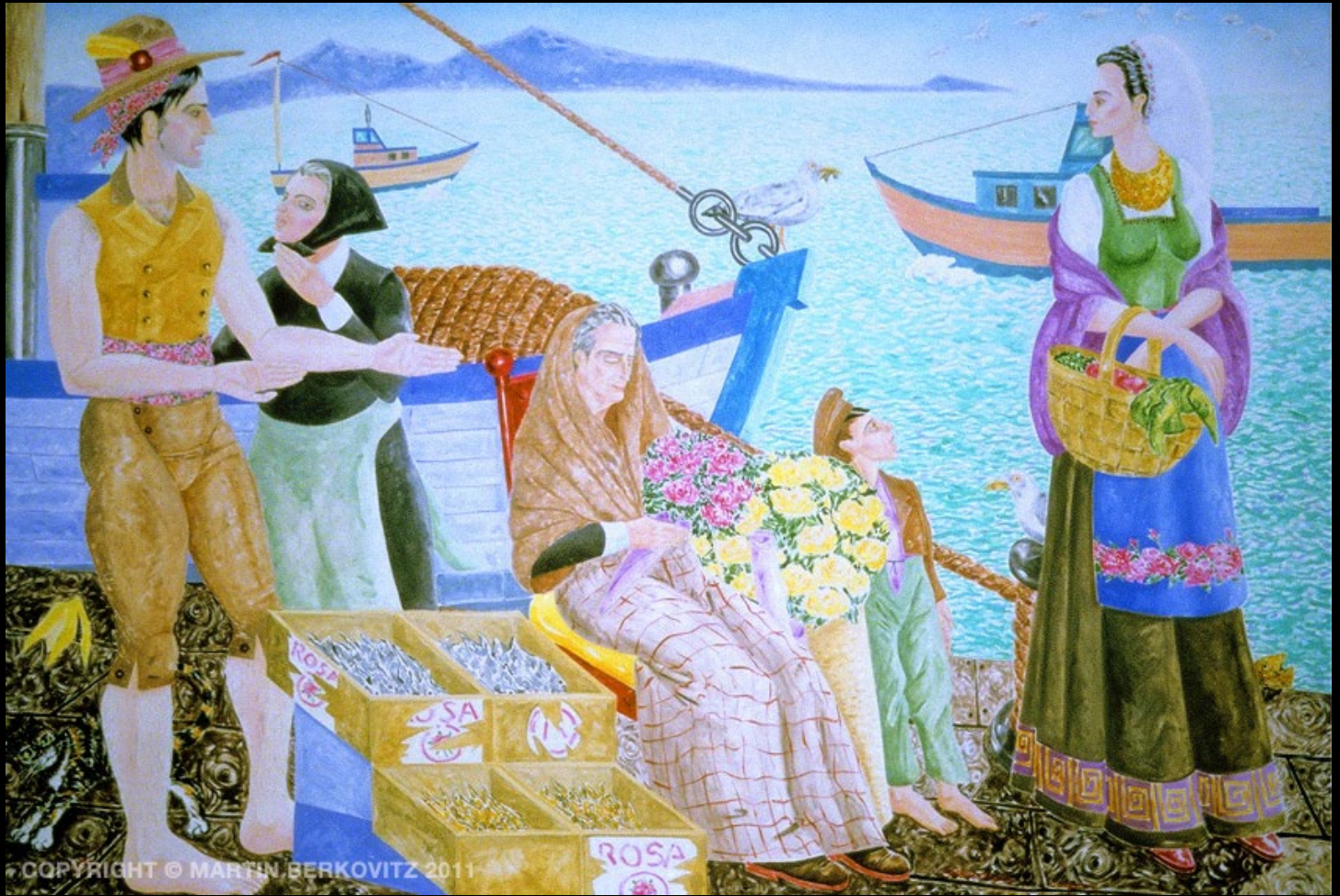
“The Fisherman’s Catch” Oil on Canvas, 48 in. x 70 in. - 1993