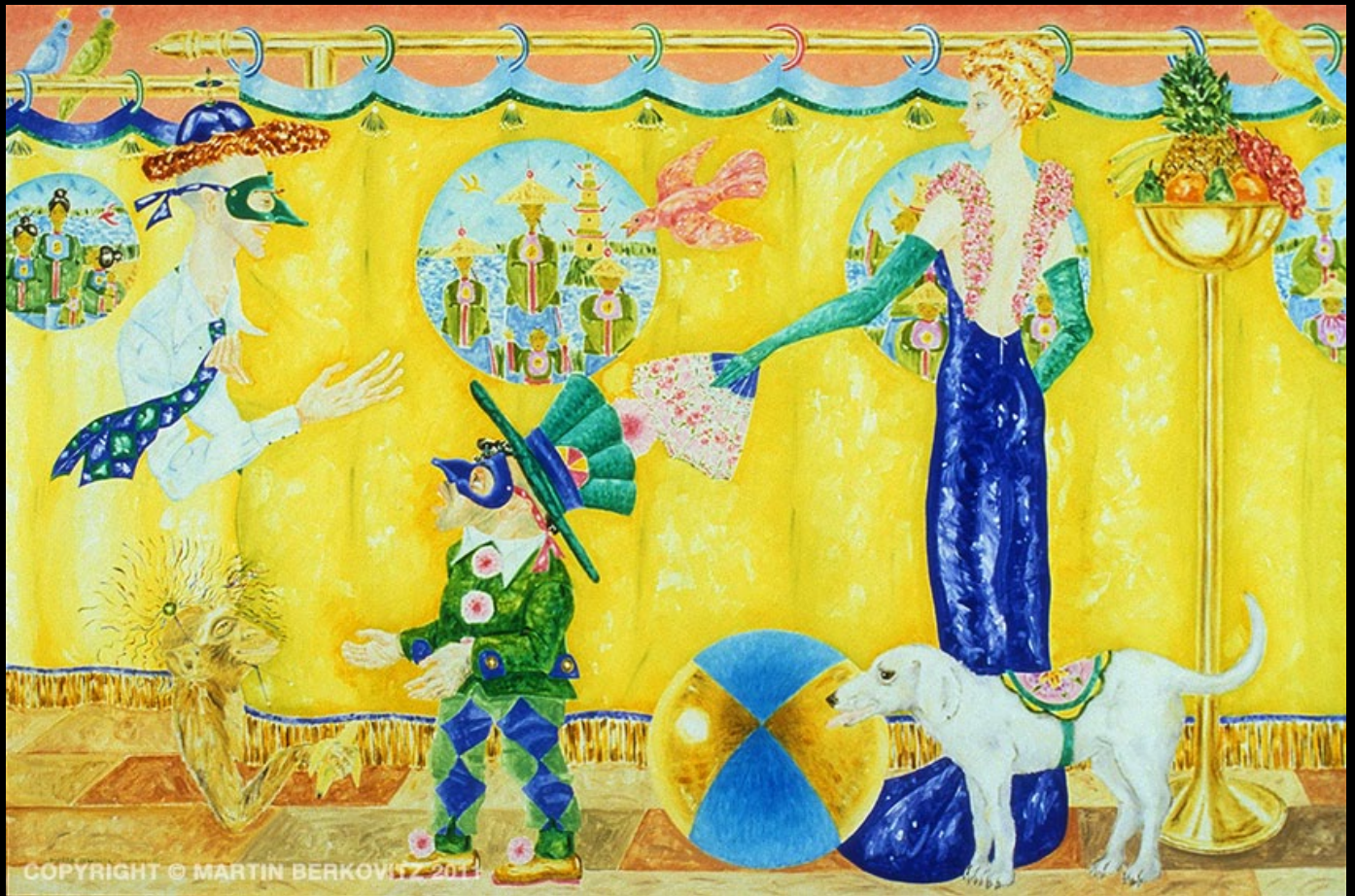
“The Chartreuse Curtain” Oil on Linen, 40 in. x 60 in. - 1995