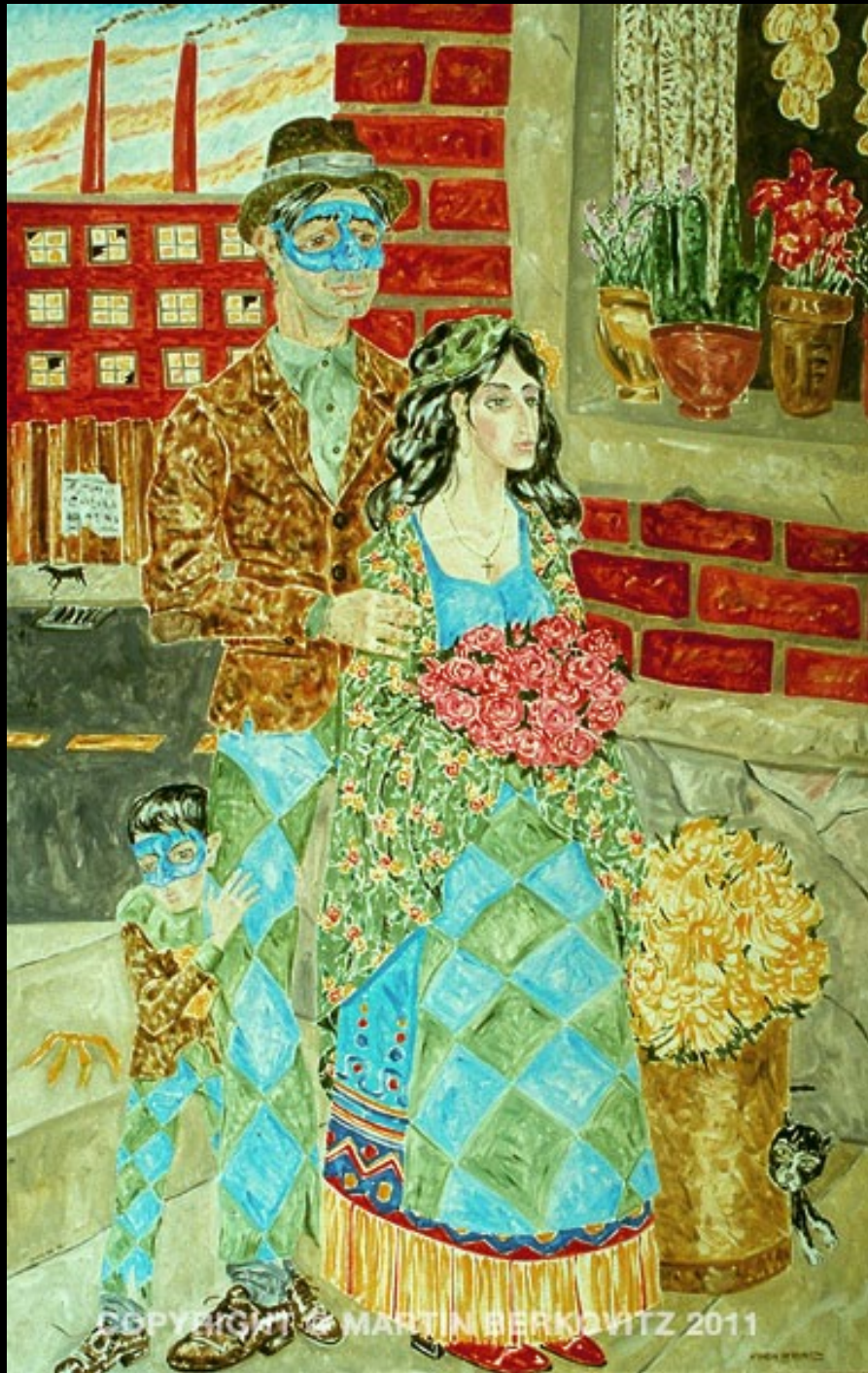
"Gypsy Harlequins" Oil on Linen, 42 in. x 70 in. - 1995