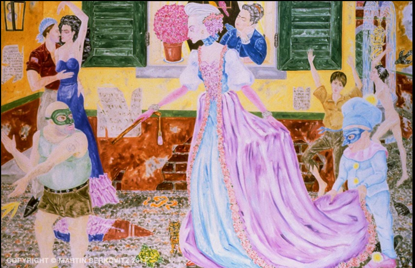
"Venus on the Streets of Naples" Oil on Canvas, 48 in. x 72 in. - 1993