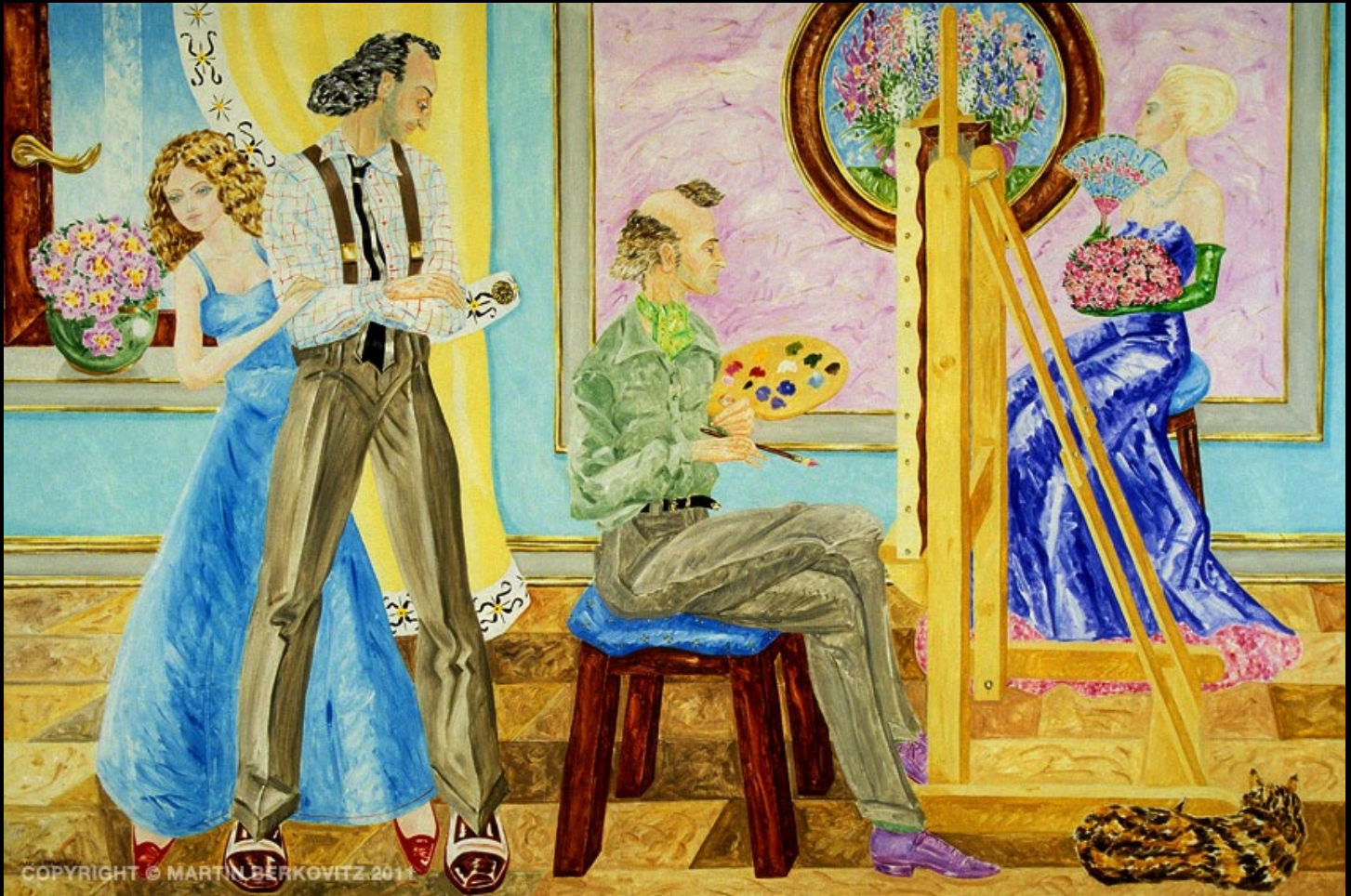
“Romantic Hero Paints a Portrait” Oil on Linen, 40 in. x 60 in. - 1995