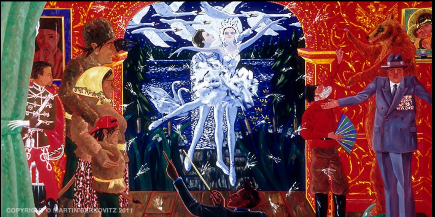
"The Russian Theatre You Always Knew & Always Loved" Oil on Linen, 44 in. x 90 in. - 2006