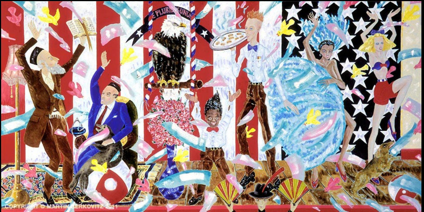
"More American Theatre" Oil on Linen, 44 in. x 90 in. - 2006