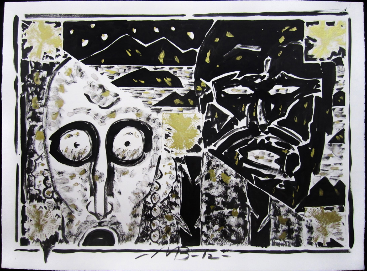
East and West 30 x 40 inches, 2012