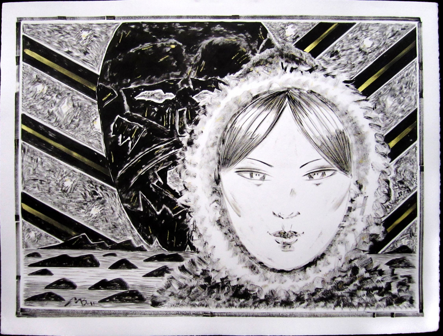
Nerrivik and the Great Spirit 30 x 40 inches, 2011