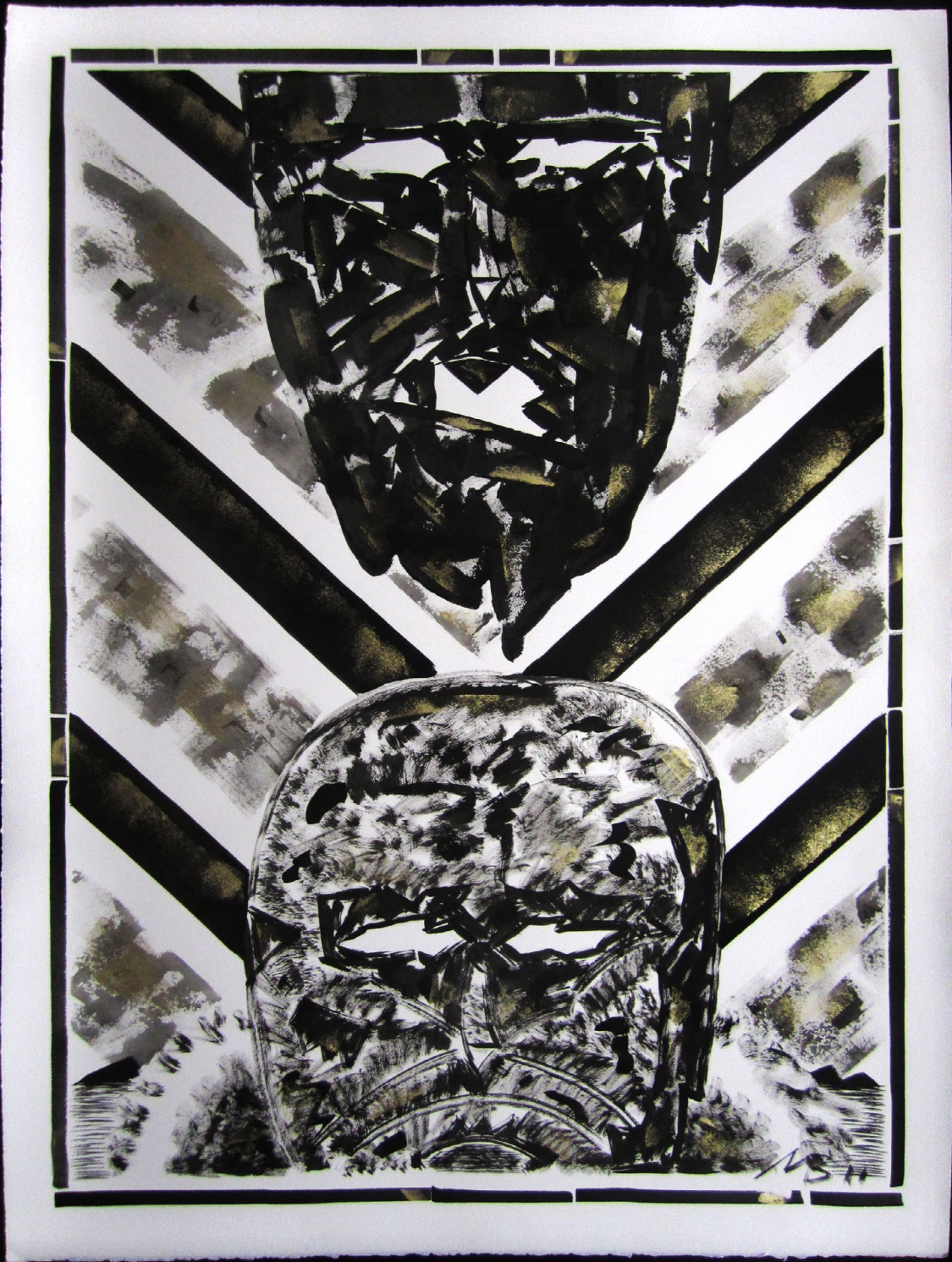
Overshadowed 30 x 40 inches, 2011