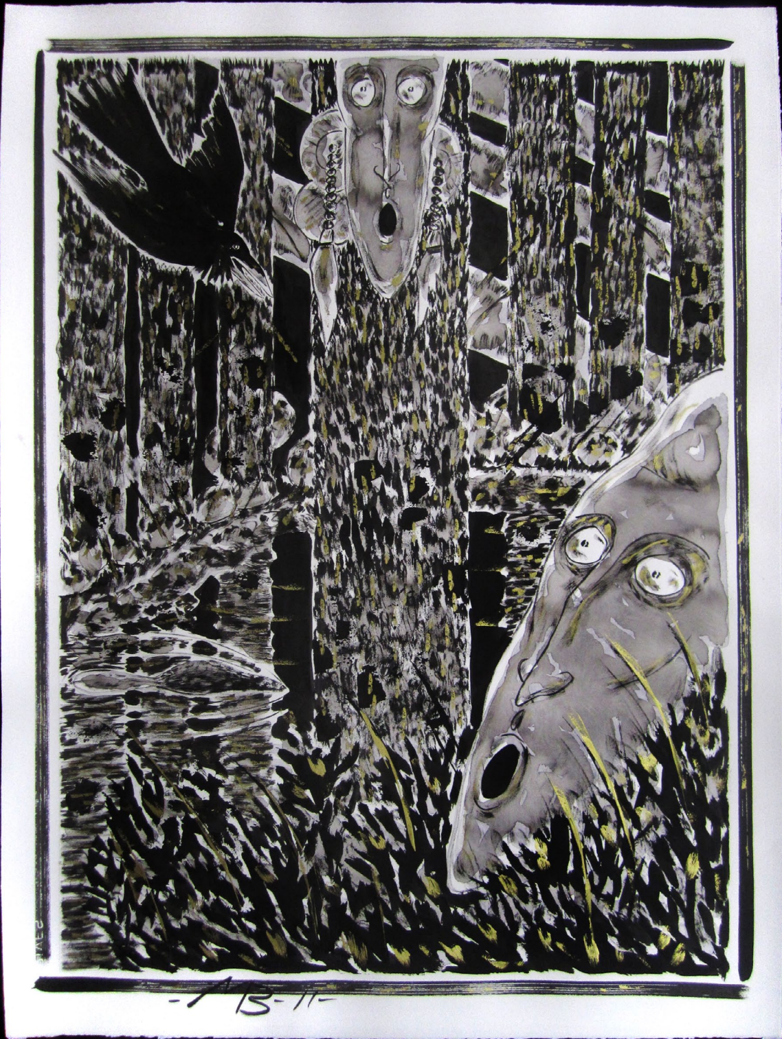
A Corner of the Forest 29.5 x 40 inches, 2011