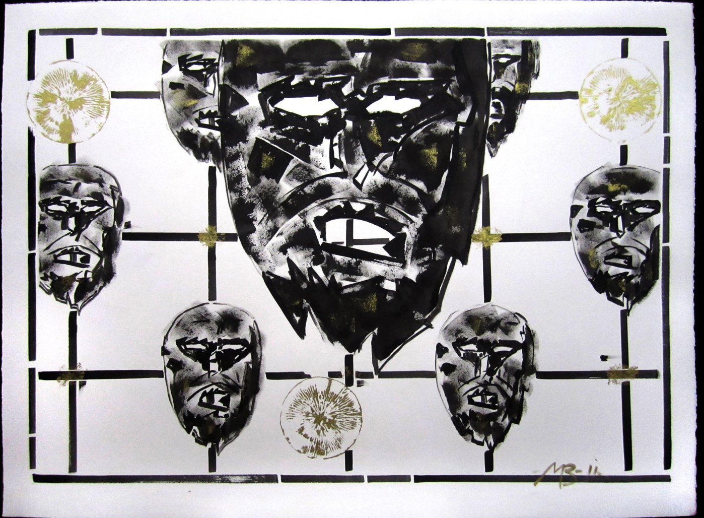
Grid of the Great Spirit 30 x 40 inches, 2011