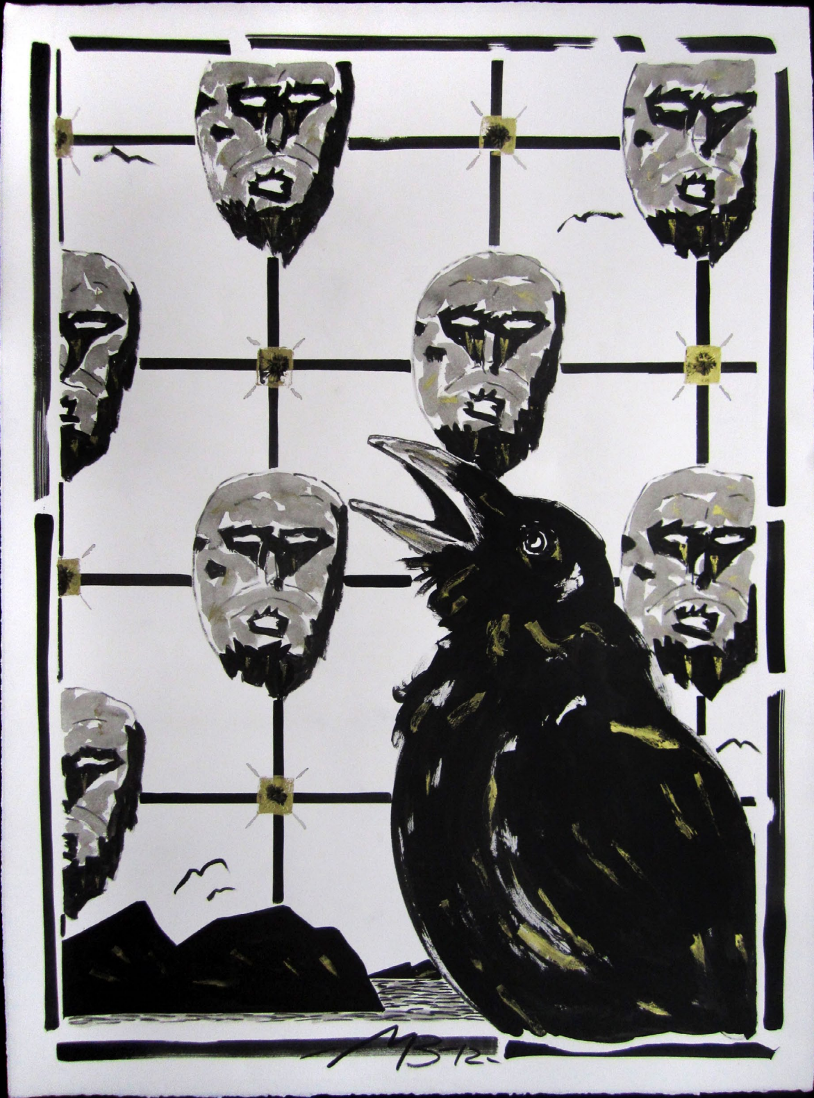
Call of the Great Spirit 30 x 40 inches, 2012