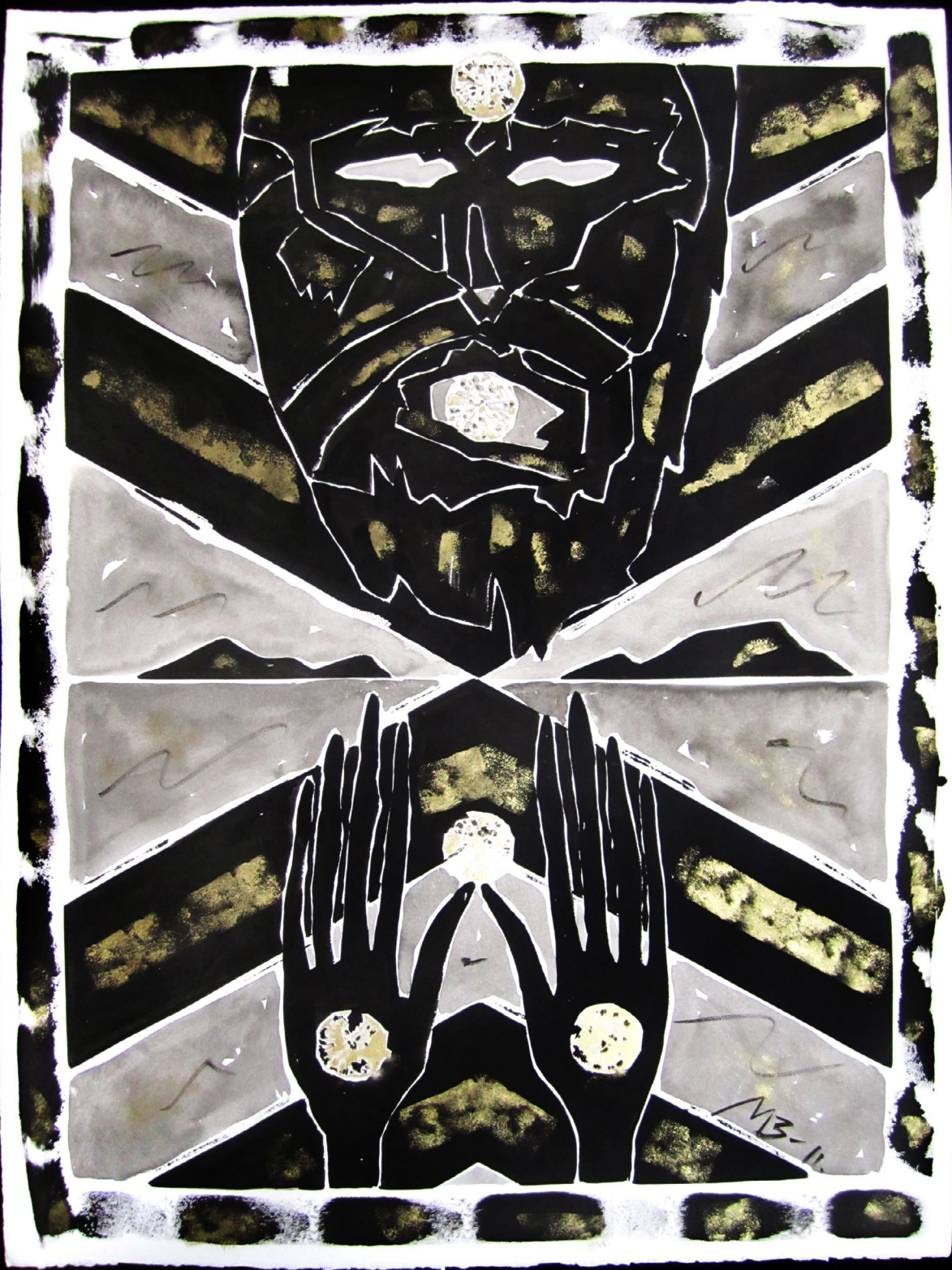
Salutations to the North 30 x 40 inches, 2011