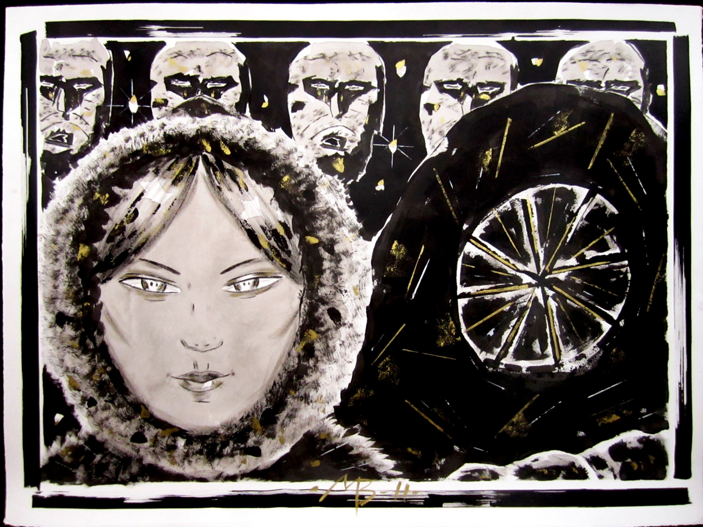
Nerrivik's Meteorite 29.5 x 40 inches, 2011