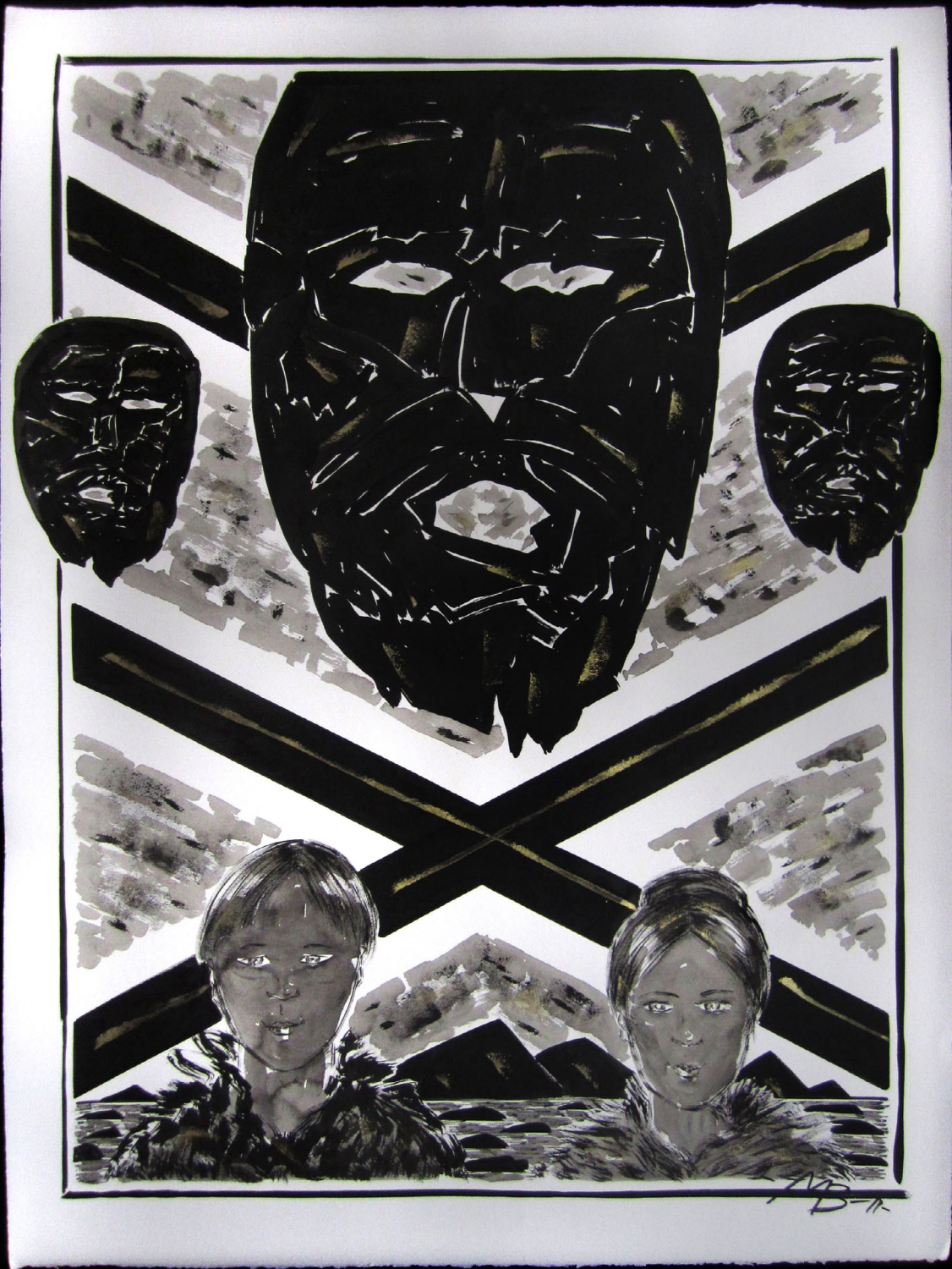
North Spirit 40 x 30 inches, 2011