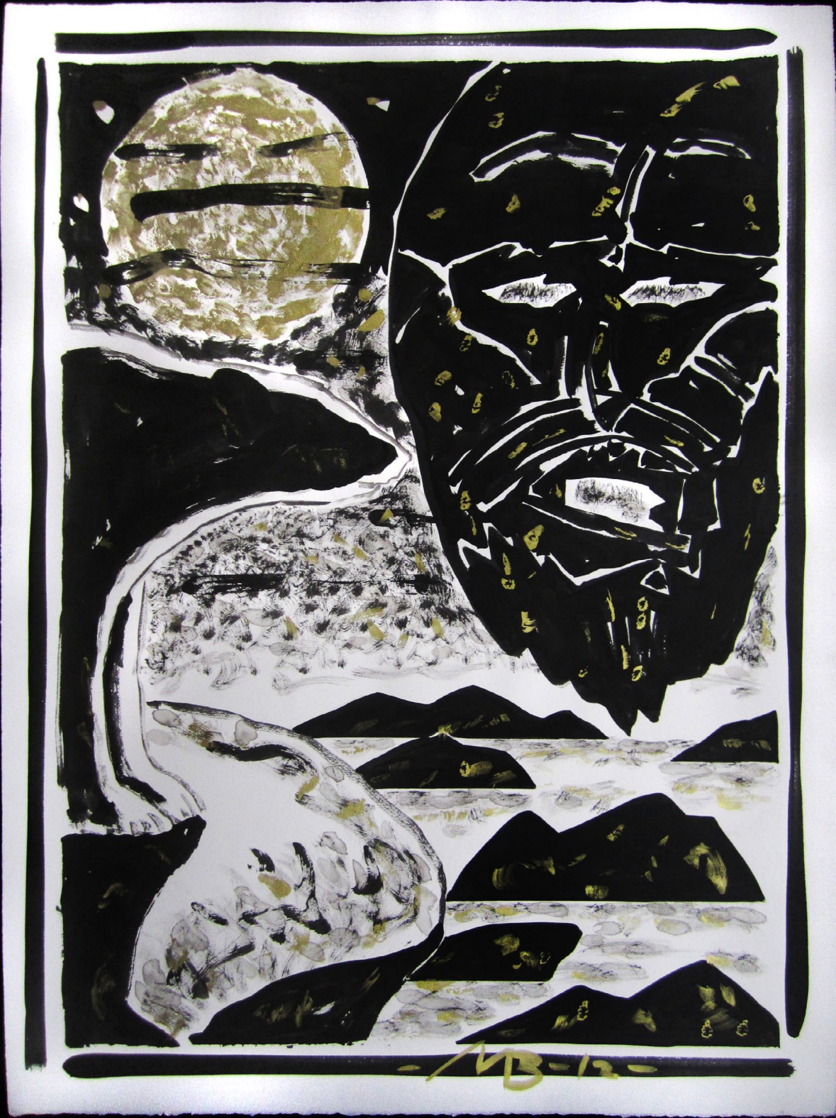
Winter Approaches 40 x 30 inches, 2012