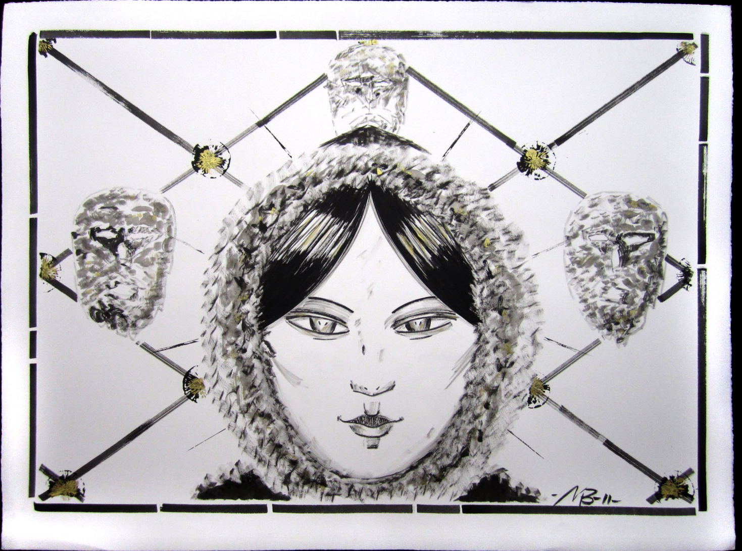
Nerrivik's Radiance 30 x 40 inches, 2011