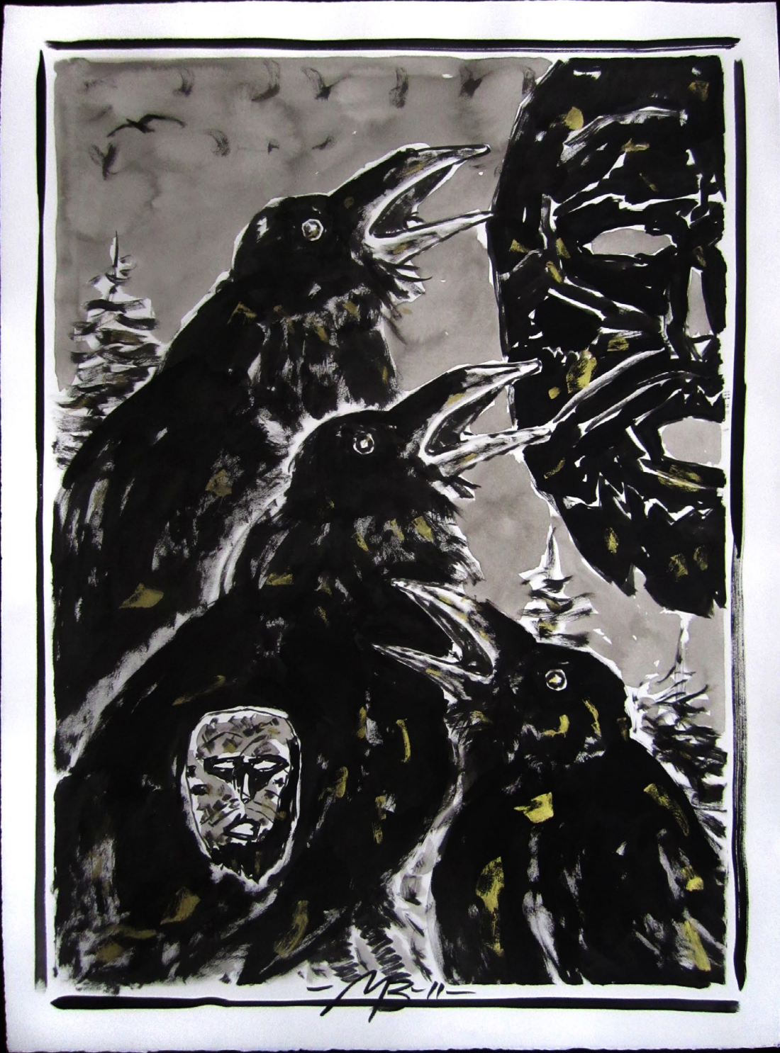
In Unison 40 x 30 inches, 2011