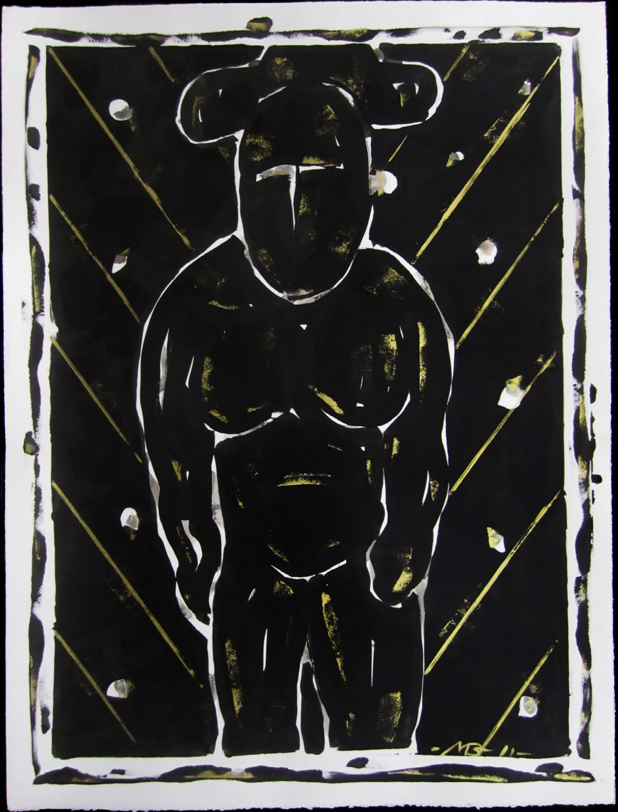
Woman of the North 30 x 40 inches, 2011