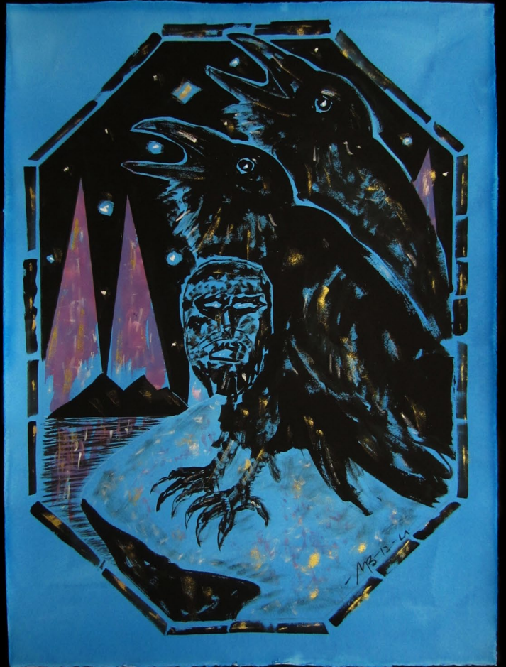
Raven Diptych 40 x 29.5 inches each, 2012