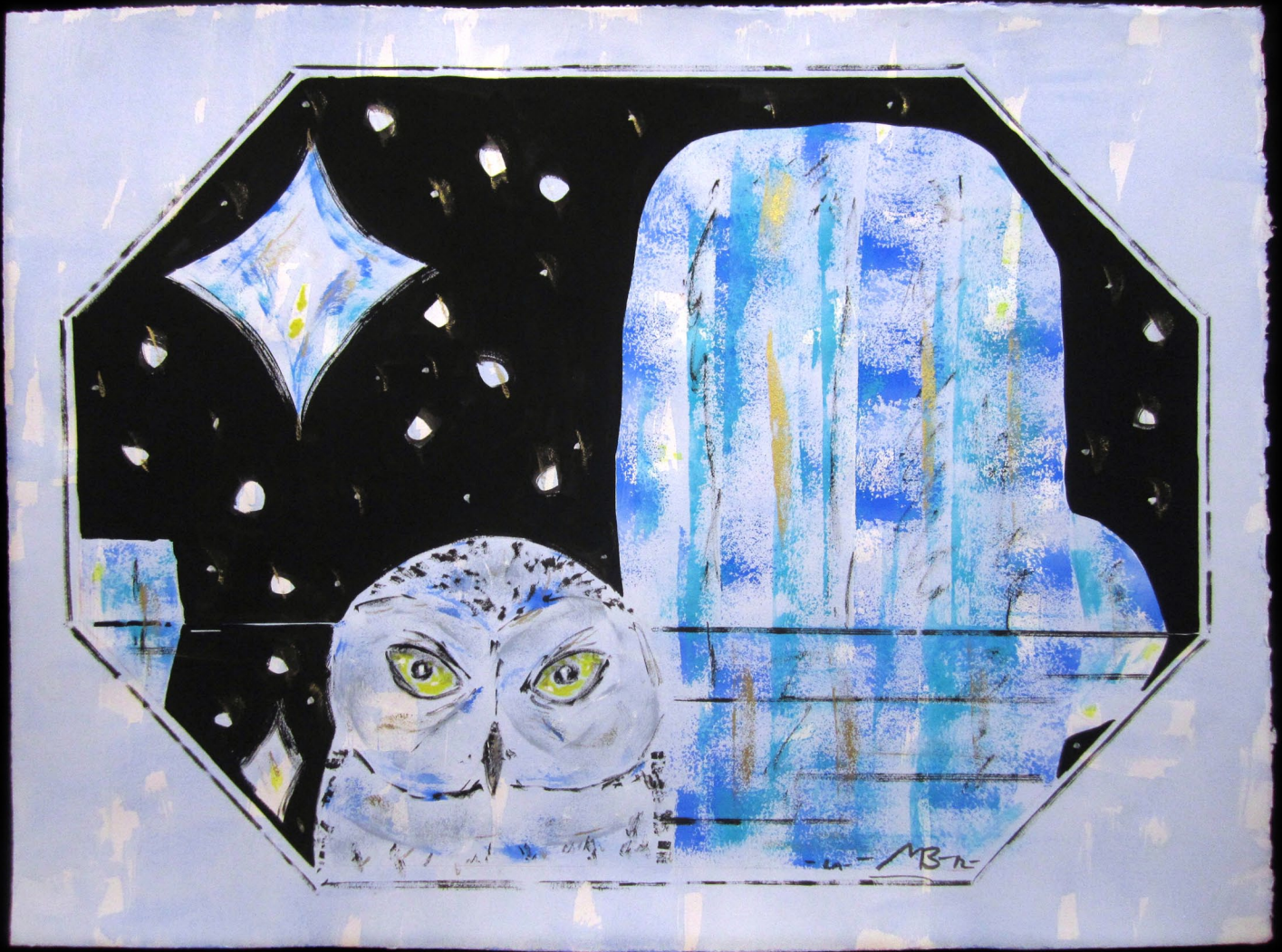
White and Shining 29.5 x 40 inches, 2012