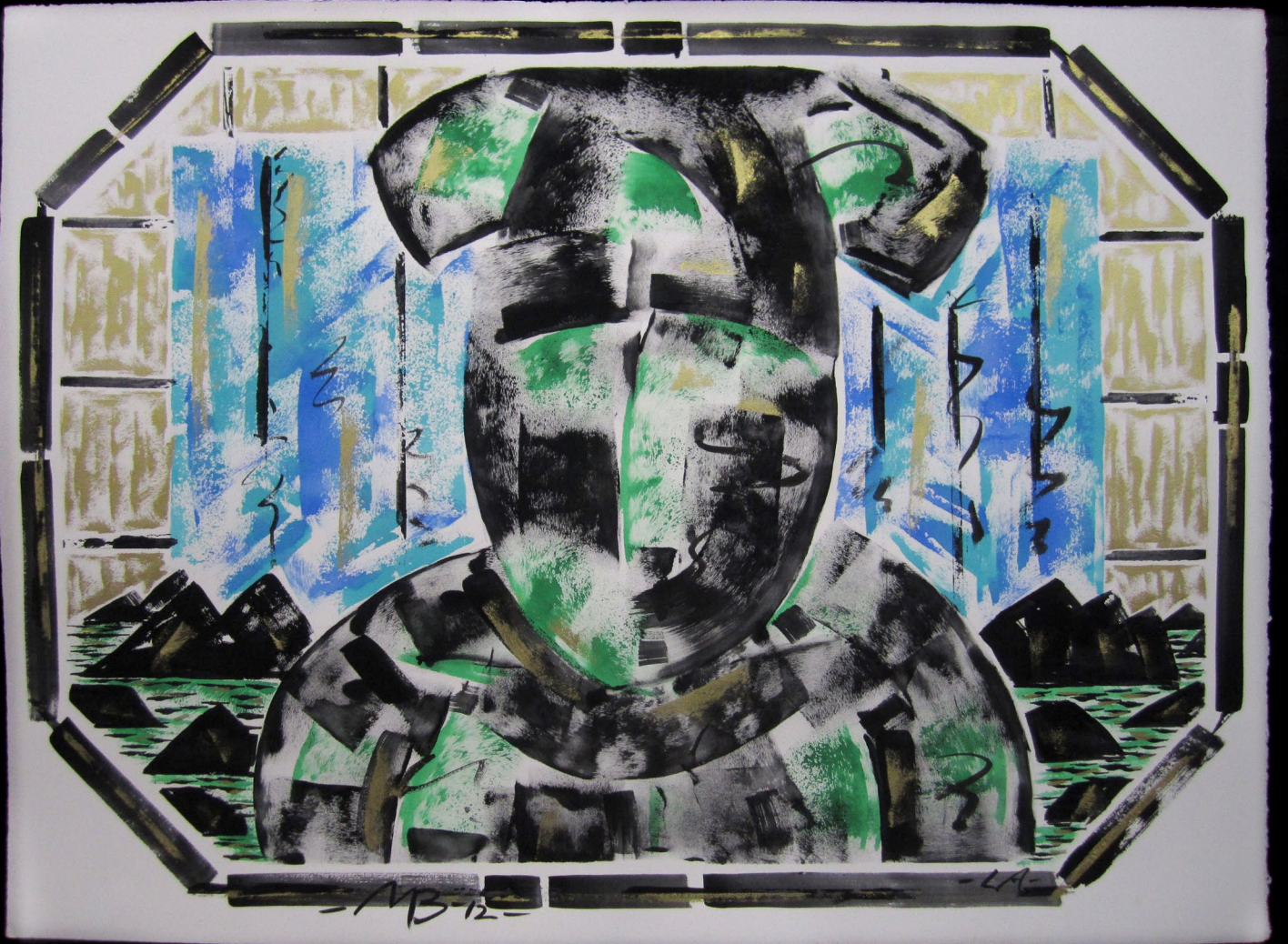
Freshwater Mother 29.5 x 40 inches, 2012