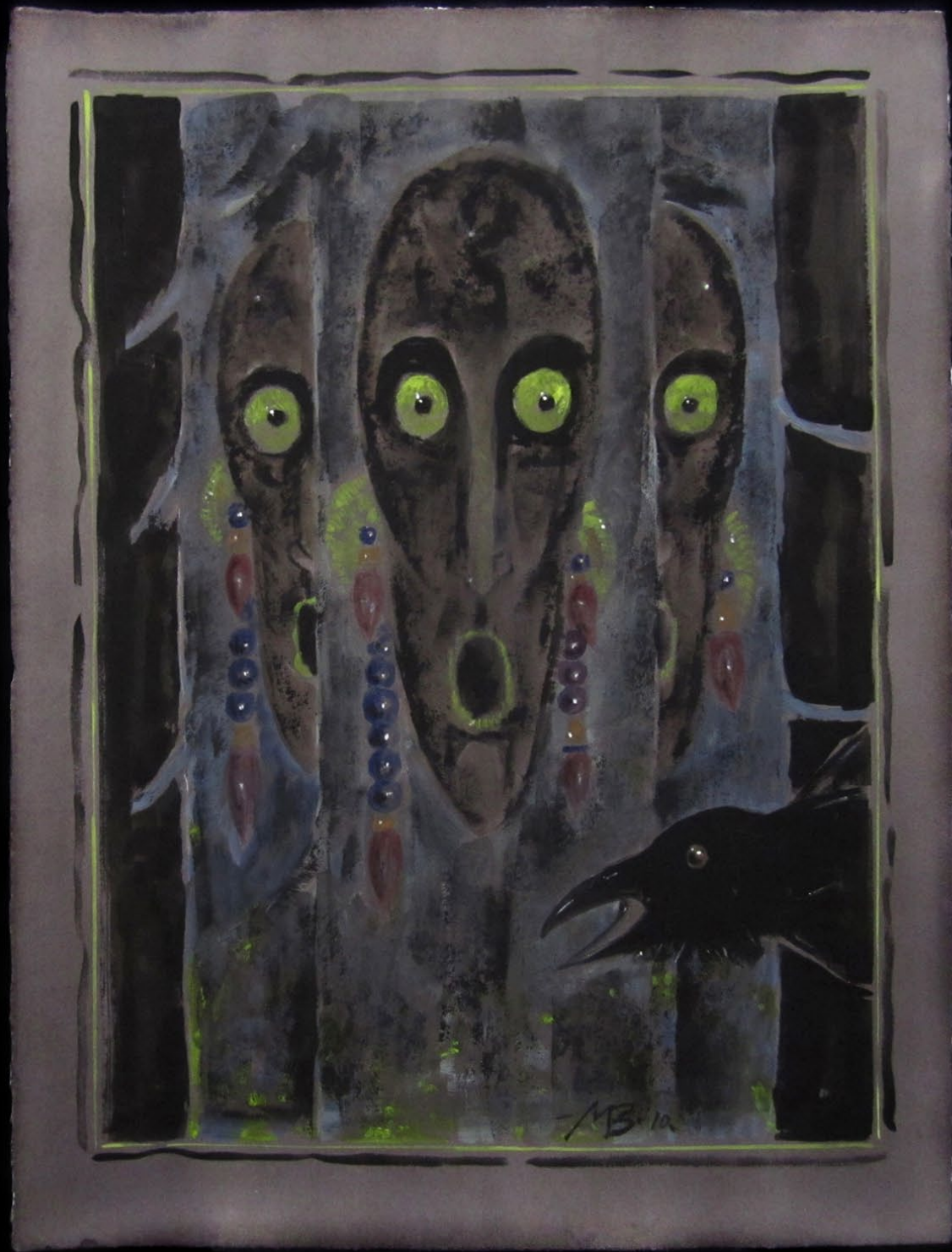
Three Abreast 22 x 30 inches, 2010