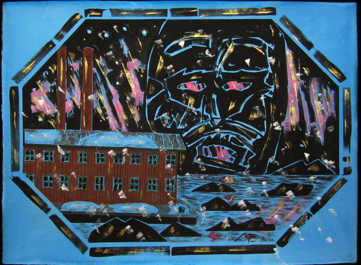
Forgotten Factory 29.5 x 40 inches, 2012