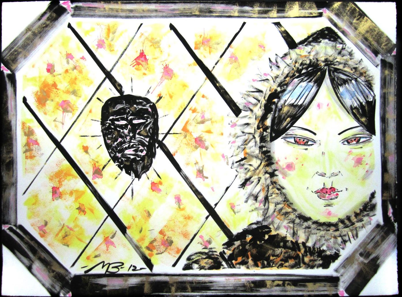
Realm of the North 29.5 x 40 inches, 2012