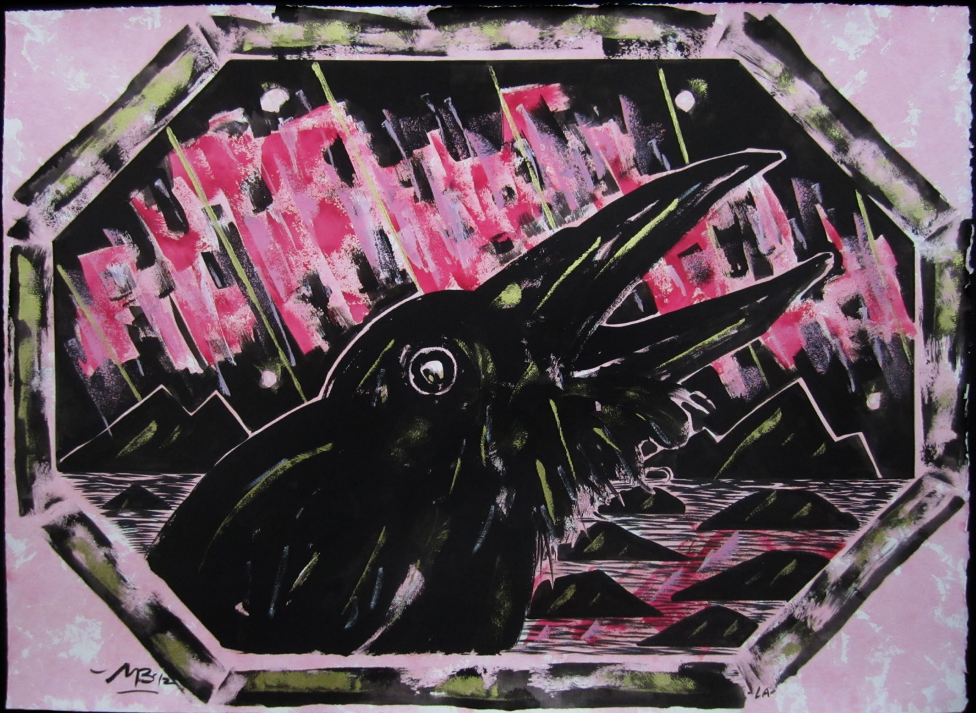
Aurora's Call 29.5 x 40 inches, 2012