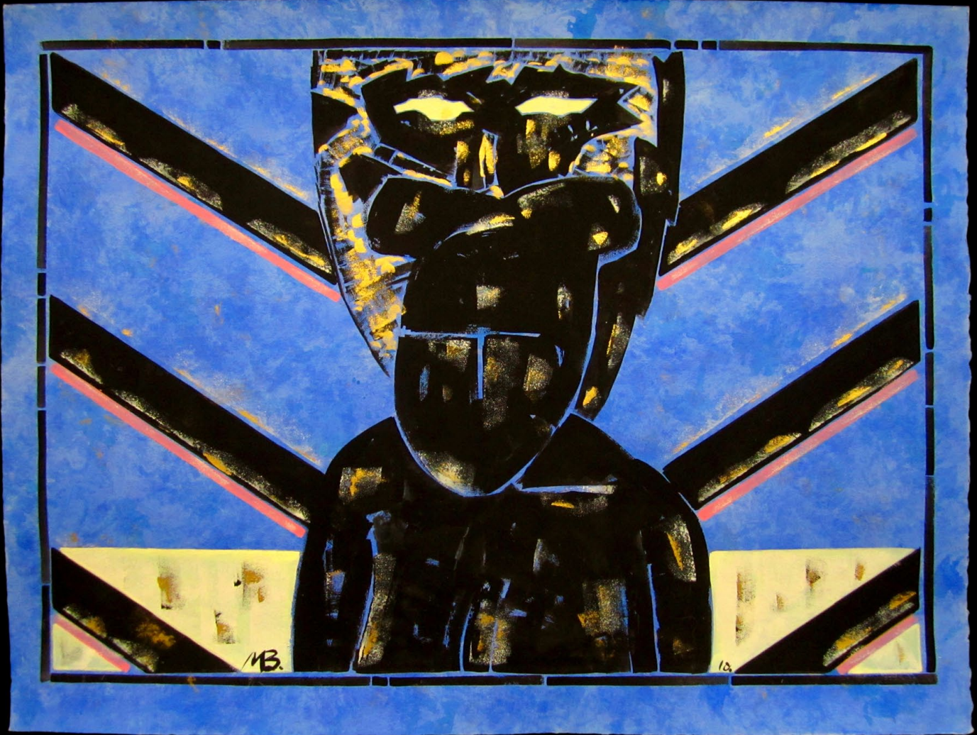
Mother Father 30 x 40 inches, 2010