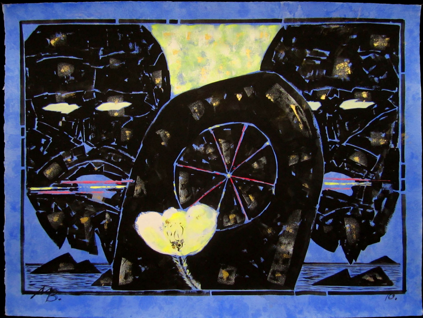
Song of the Great Spirit 30 x 40 inches, 2010