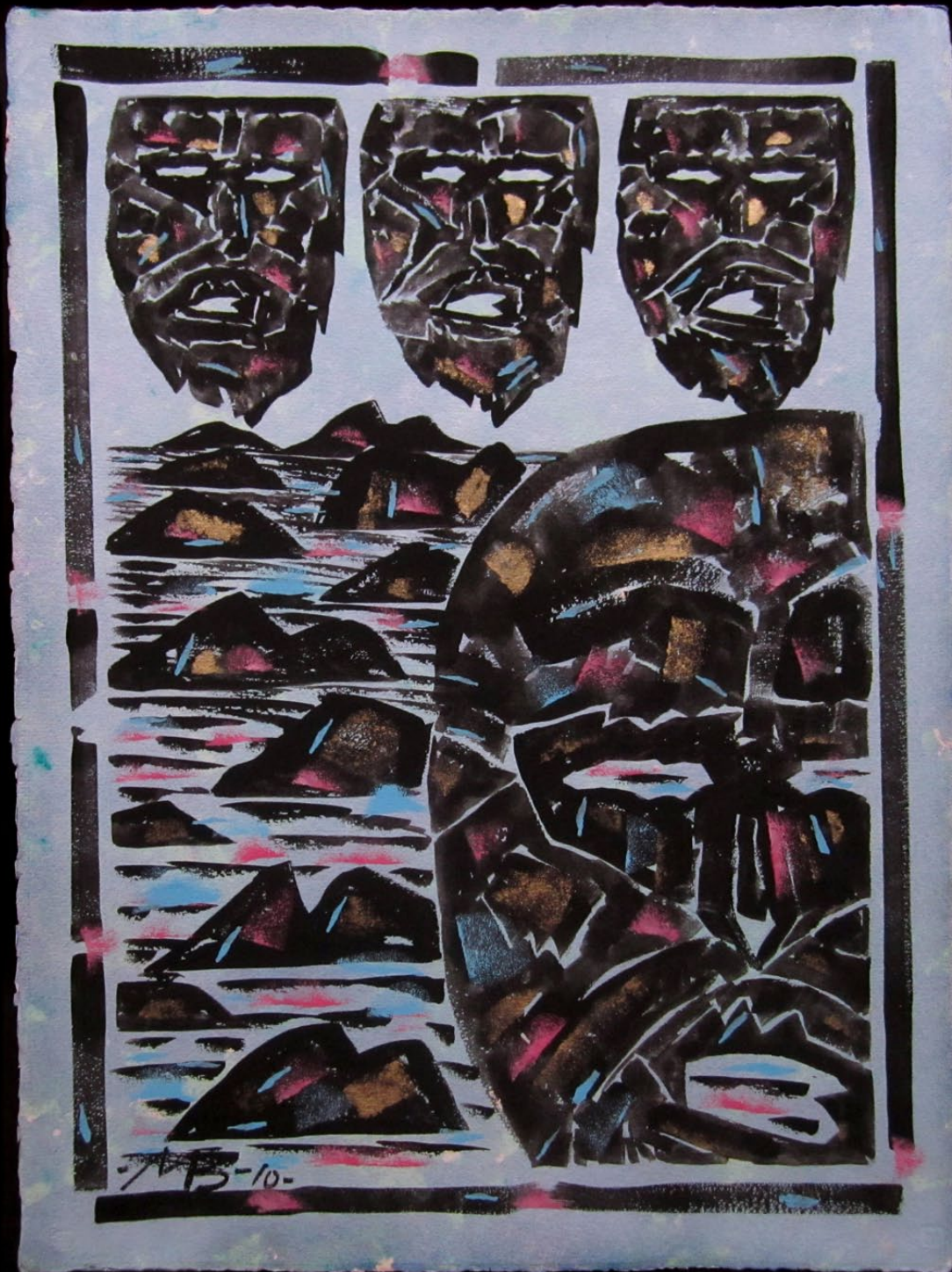
Horizon 22 x 30 inches, 2010