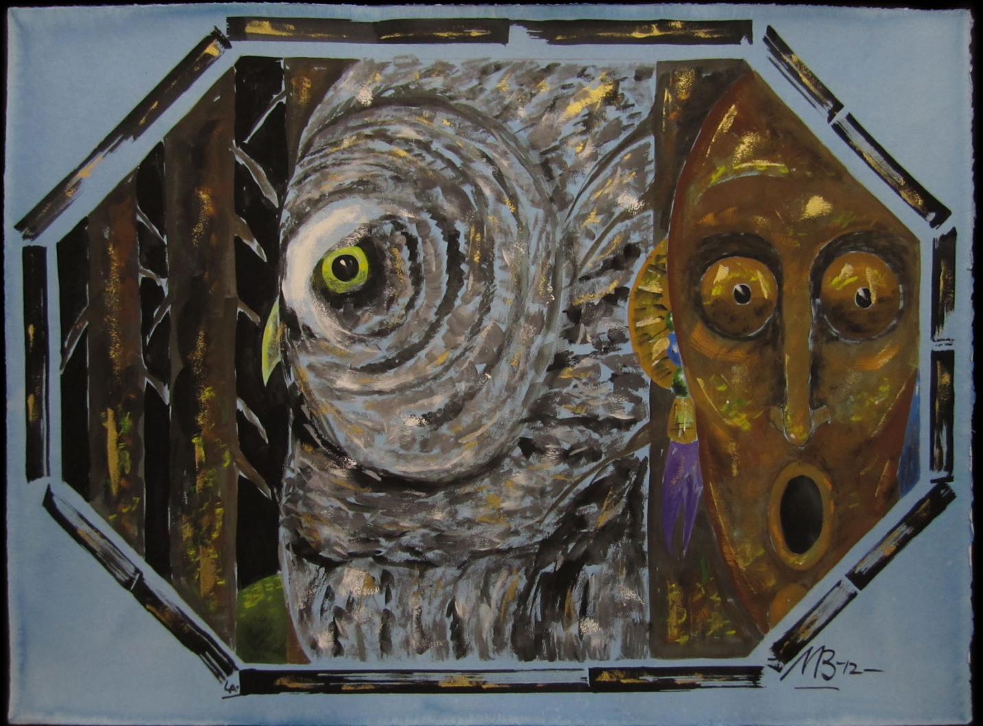
Forest Profile 29.5 x 40 inches, 2012