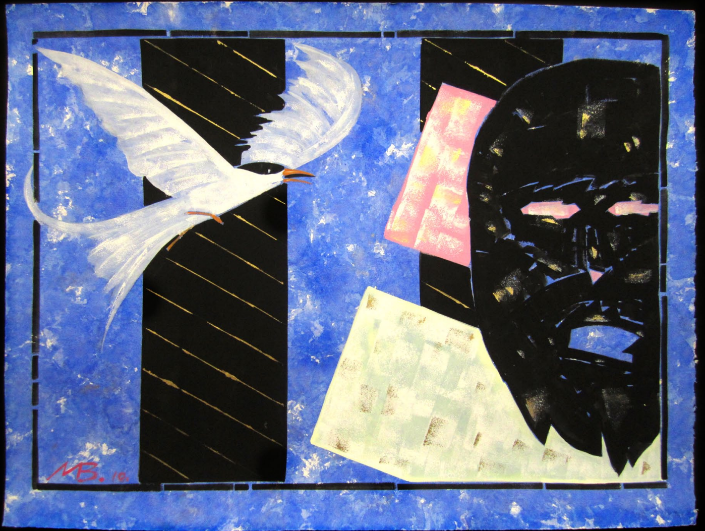
Arctic Presence 30 x 40 inches, 2010