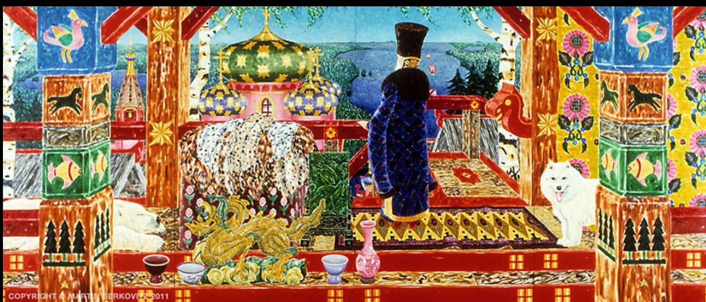
“Mangazeya” Oil on Canvas, 90 in. x 216 in. - 1982