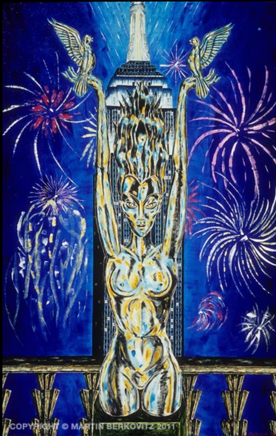
“Blue Manhattan” Oil on Canvas, 78 in. x 120 in. - 2004