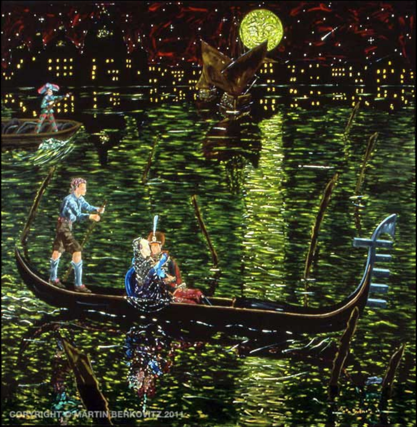
"The Courtship of Mars & Venus" Oil on Linen, 68 in. x 68 in. - 1995