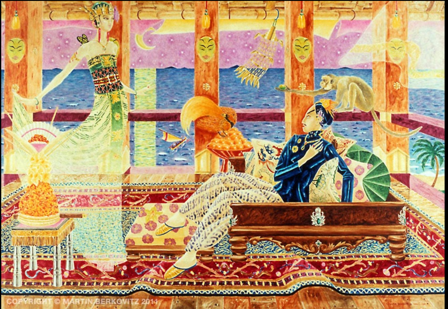
“Raden Loro Kidul: Queen of the Southern Ocean” Oil on Canvas, 54 in. x 78 in. - 1985