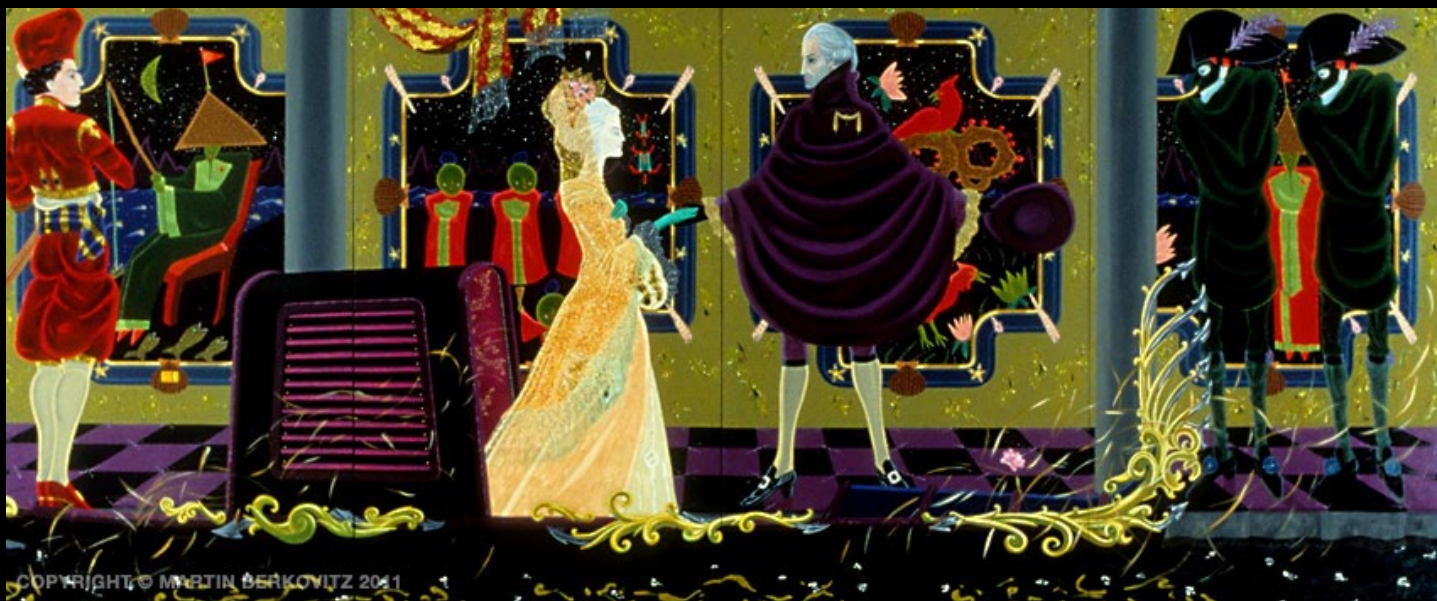
“Aphrodite’s Arrival” Oil on Canvas, 90 in. x 216 in. - 1983-1984