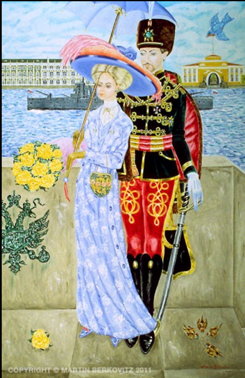
“Mars and Venus on the Neva” Oil on Linen, 48 in. x 72 in. - 1995