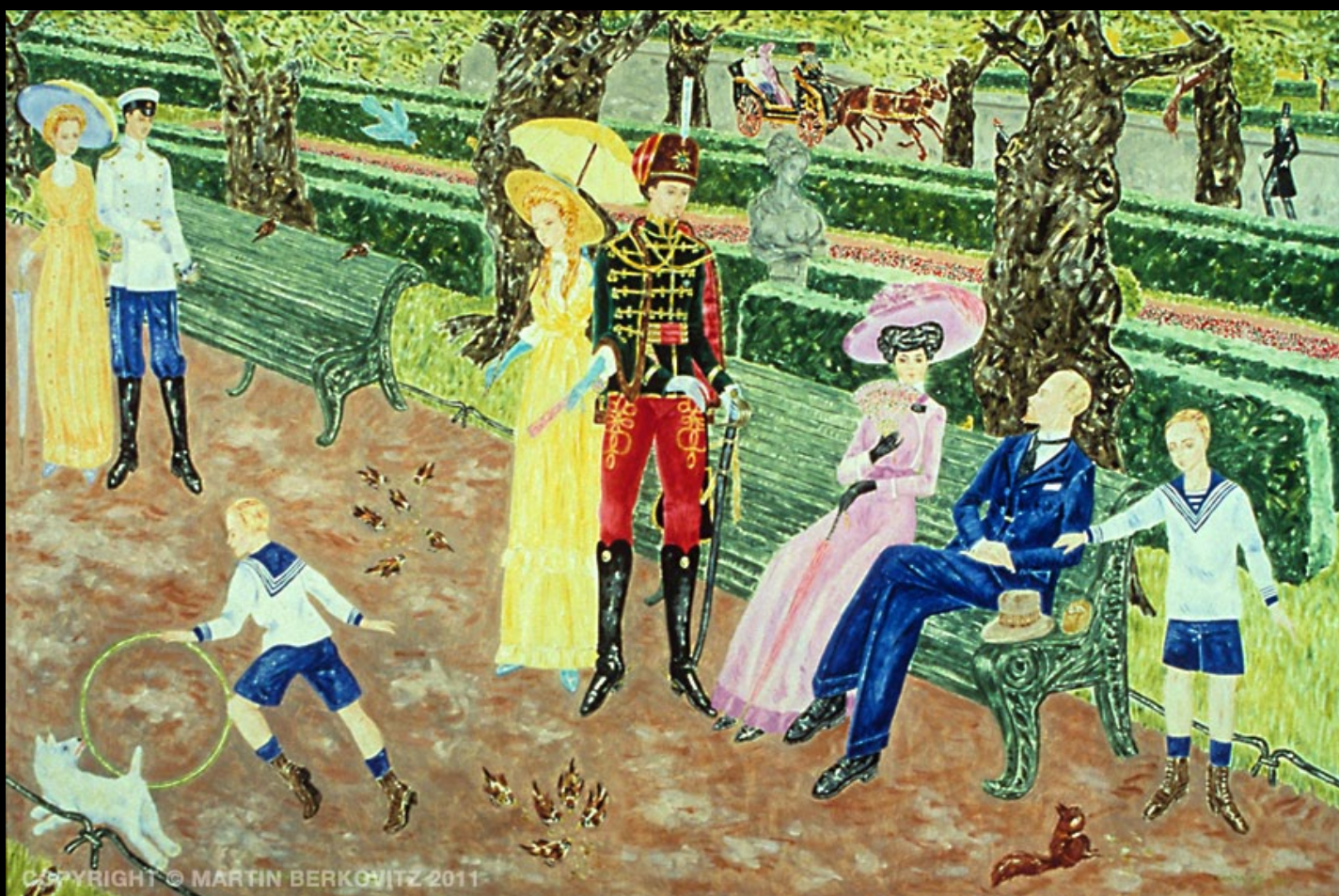
“The Summer Garden: 1911” Oil on Linen, 40 in. x 60 in. - 1995