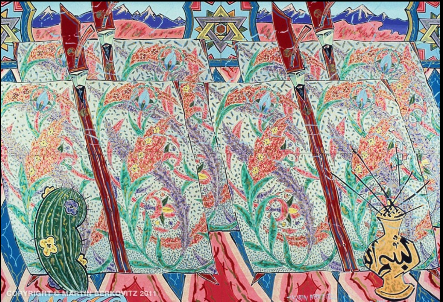
“Dance of the Turkish Guard” Gouache on Arches Paper, 80 in. x 120 in. - 1980