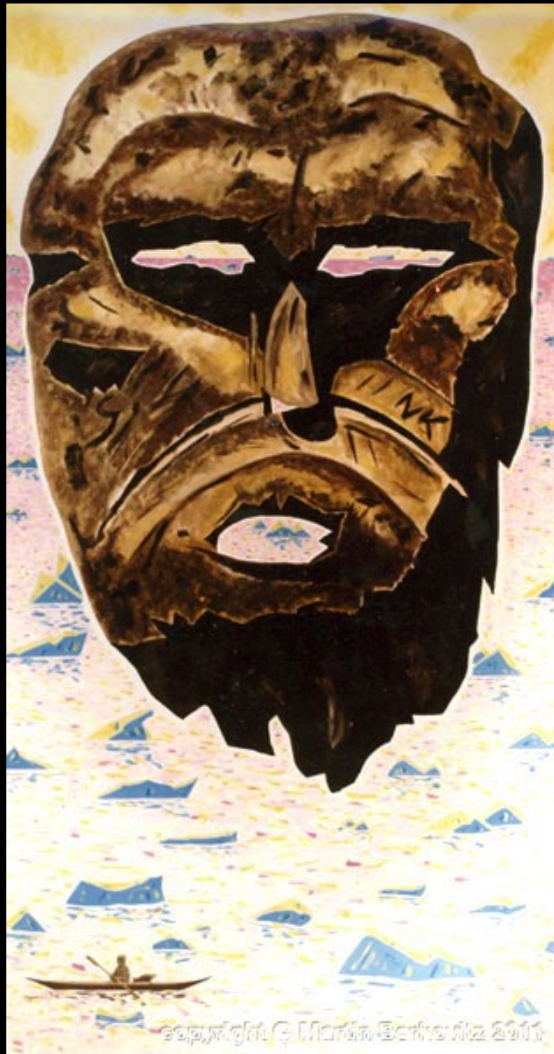
“Great Spirit of the Arctic” Oil on Canvas, 48 in. x 90 in. - 1979