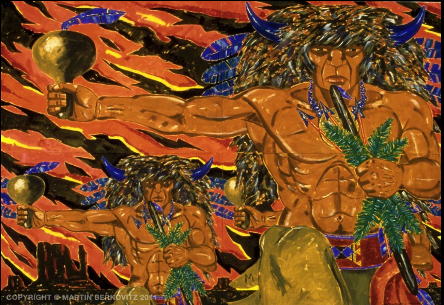
“Buffalo Dance” Gouache on Arches Paper, 80 in. x 120 in. - 1982