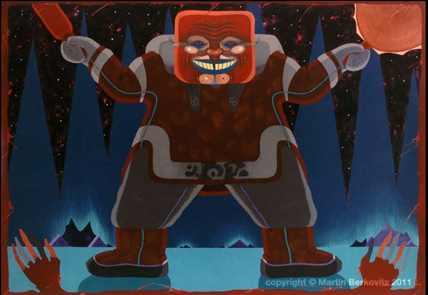
“Shaman Diptych” Oil on Canvas, 60 in. x 168 in. - 1978