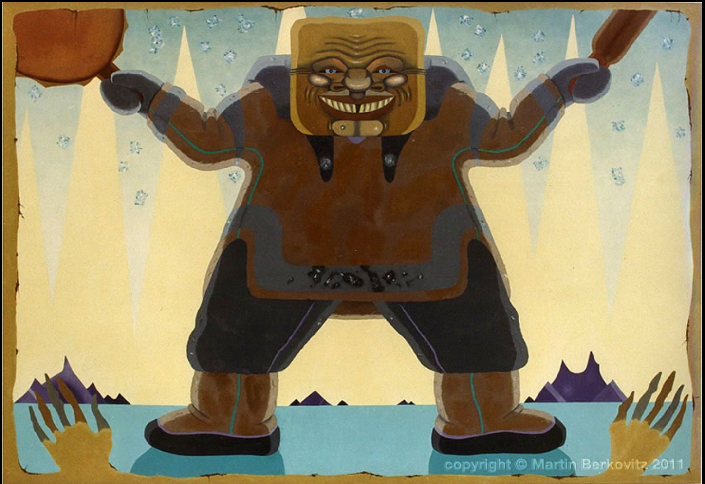
“Shaman Diptych” Oil on Canvas, 60 in. x 168 in. - 1978