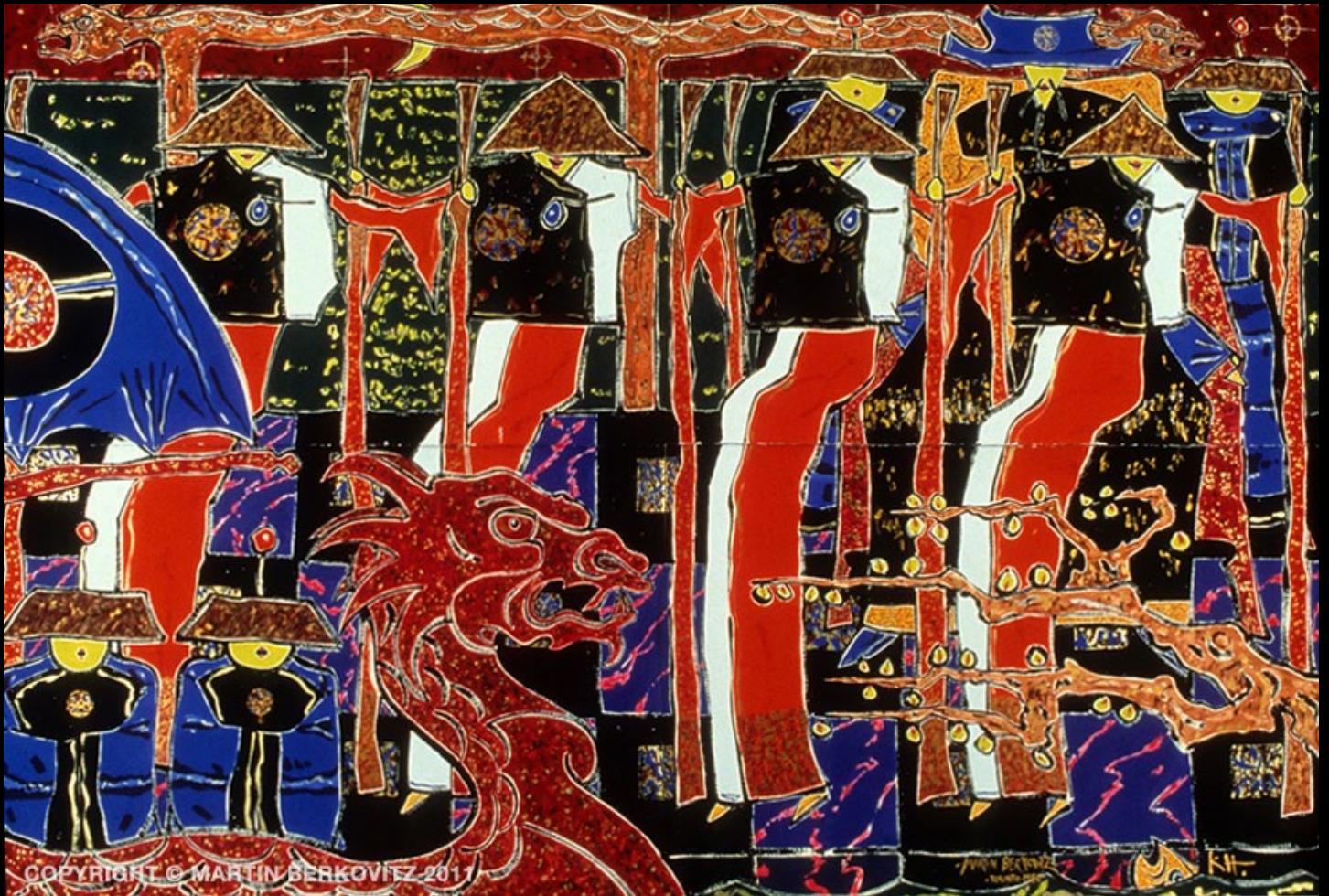
“Vermillion Nights” Gouache on Arches Paper, 80 in. x 120 in. - 1980