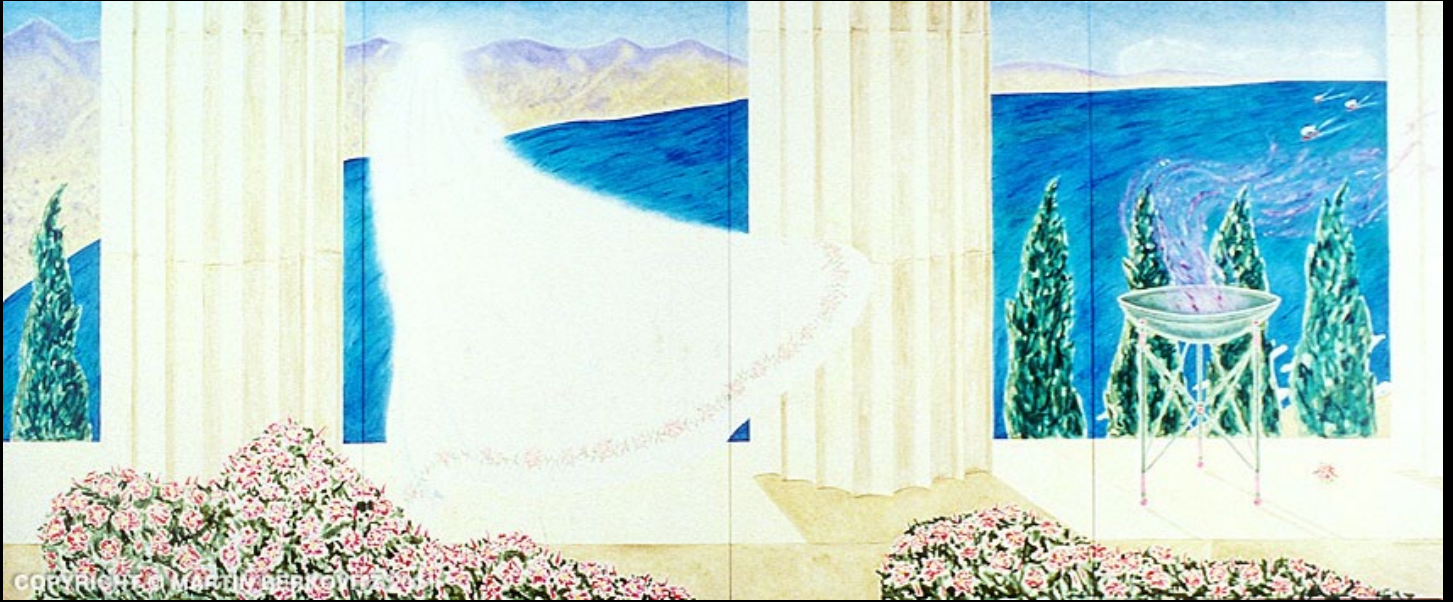
“Olympus” Oil on Canvas, 90 in. x 216 in. - 1984