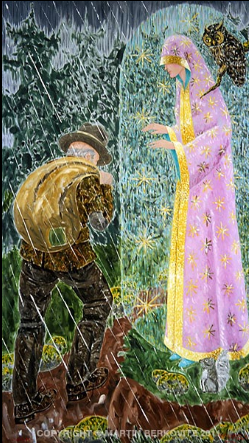
“Invisibly Present” Oil on Linen, 48 in. x 84 in. - 1999