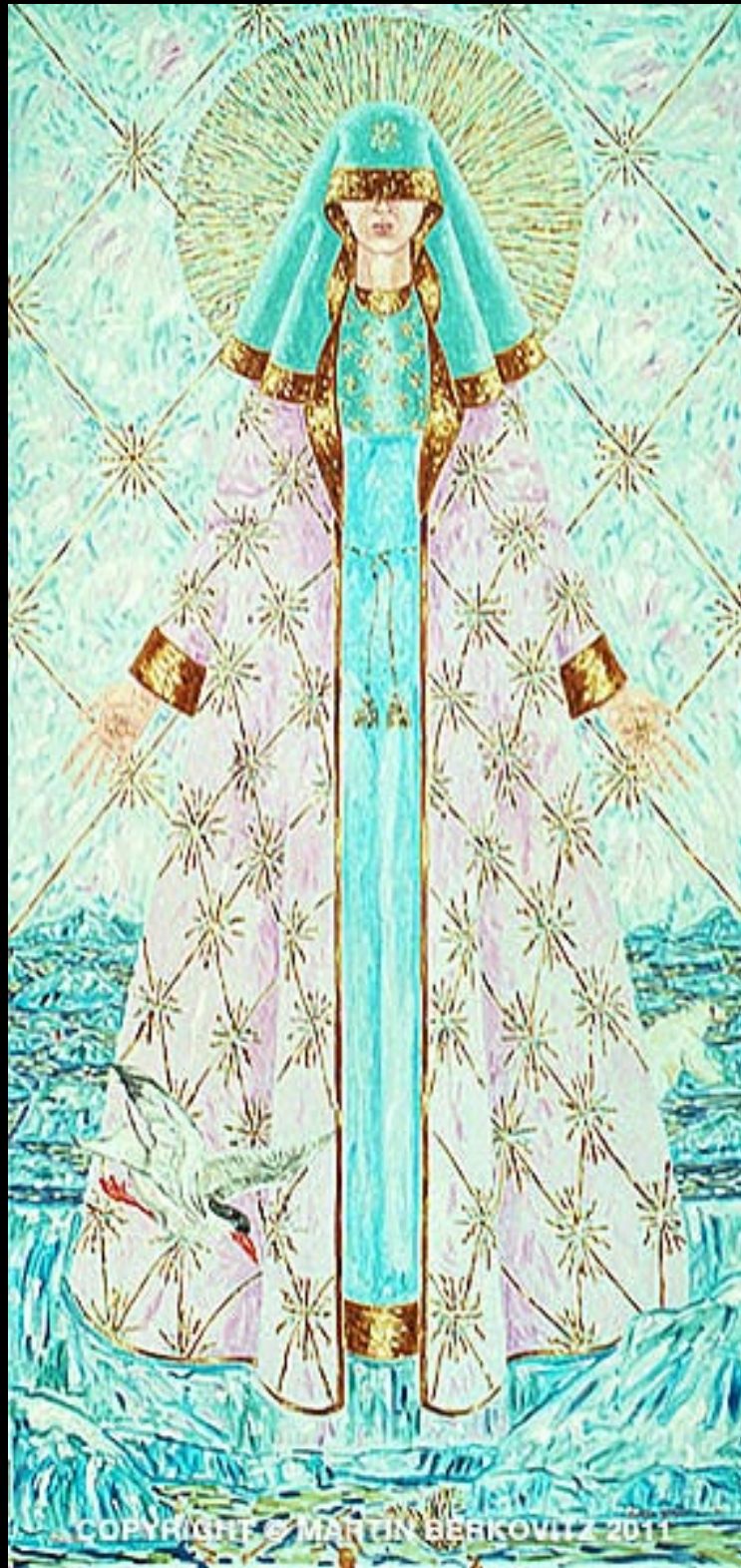
“Mother of the Ice & Snow” Oil on Linen, 40 in. x 84 in. - 1996