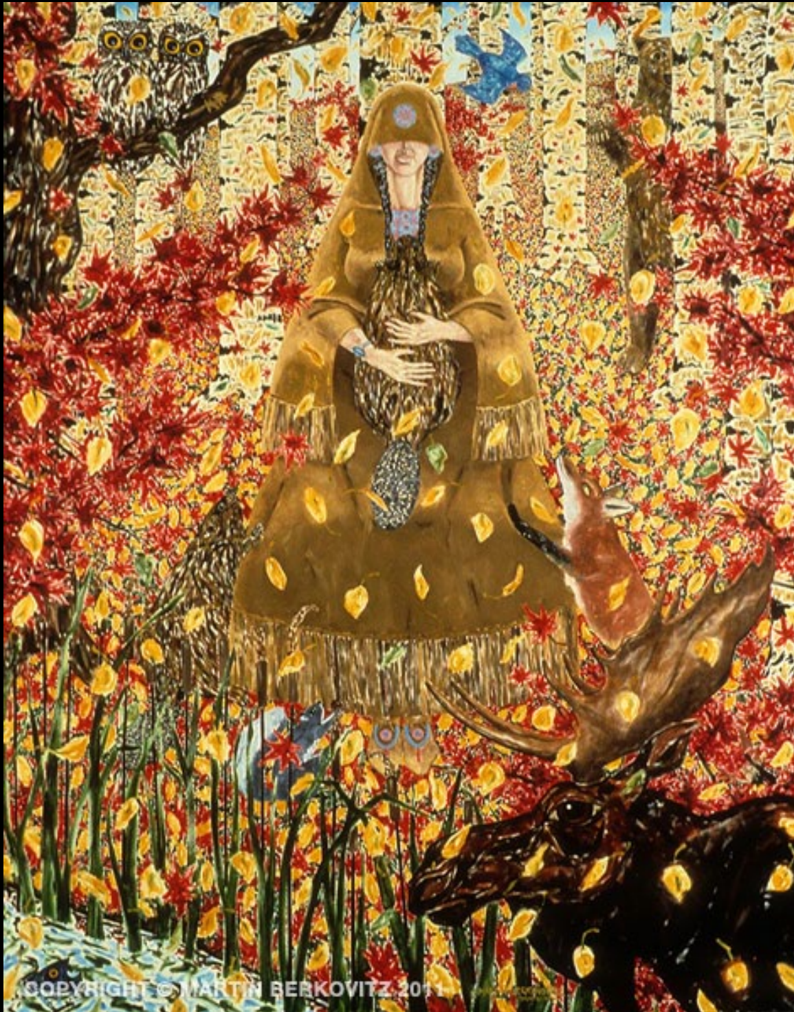
“Mother of the Woods” Oil on Canvas, 78 in. x 90 in. - 1980