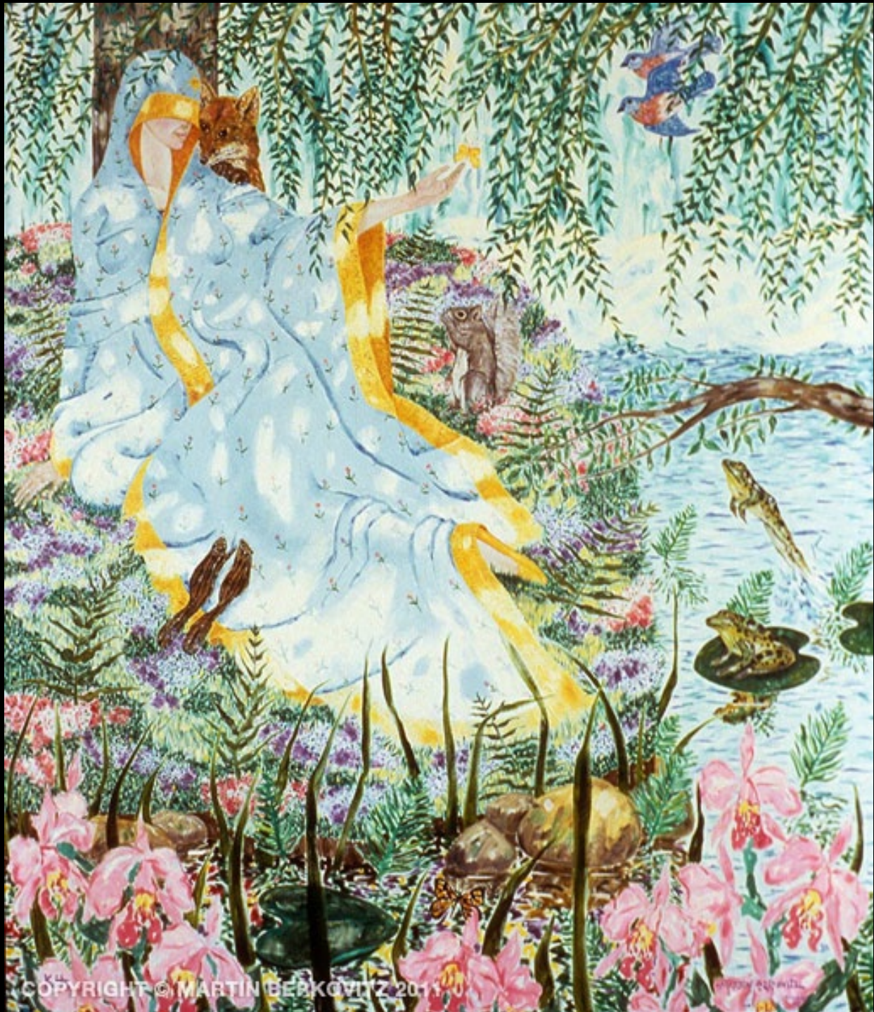
“The Great Play of the Mother of the World” Oil on Canvas, 78 in. x 90 in. - 1981