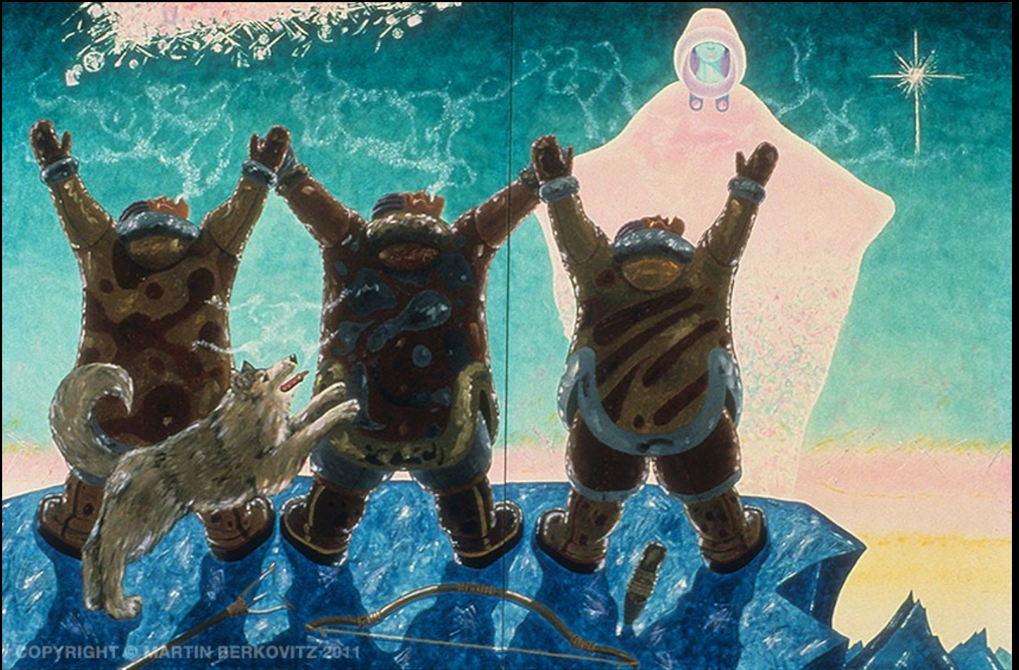
“Urusvati: Light of the Morning Star” Oil on Linen, 78 in. x 120 in. - 1980