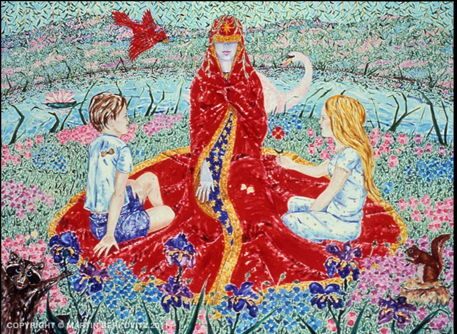
"The Garment of the Mother of the World" Oil on Canvas, 66 in. x 90 in. - 1980