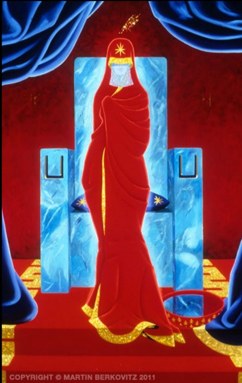
“Mother of the World” Oil on Linen, 54 in. x 84 in. - 1980