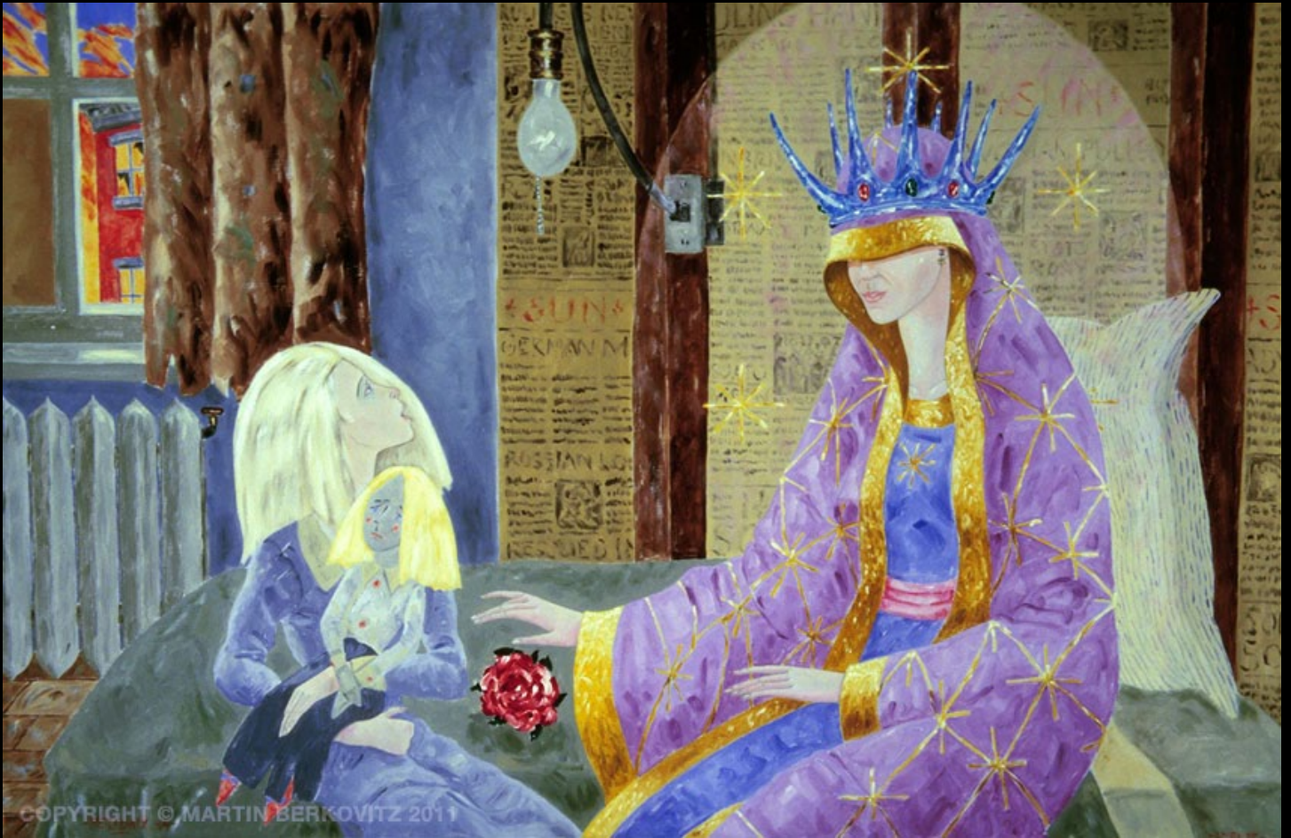
“A Child’s Sick Room” Oil on Linen, 40 in. x 60 in. - 1999