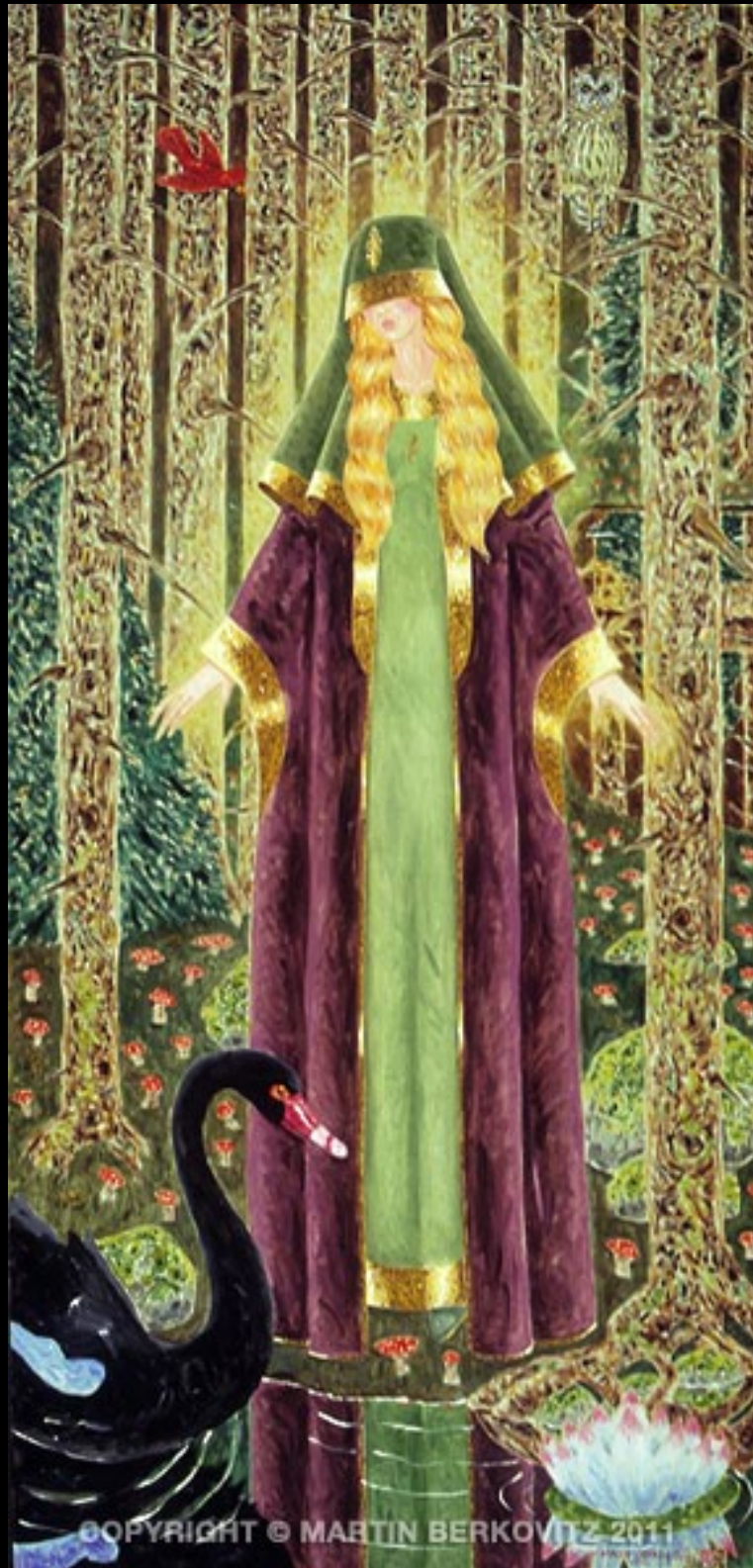
“Mother of the Fir & the Pine” Oil on Linen, 40 in. x 84 in. - 1996