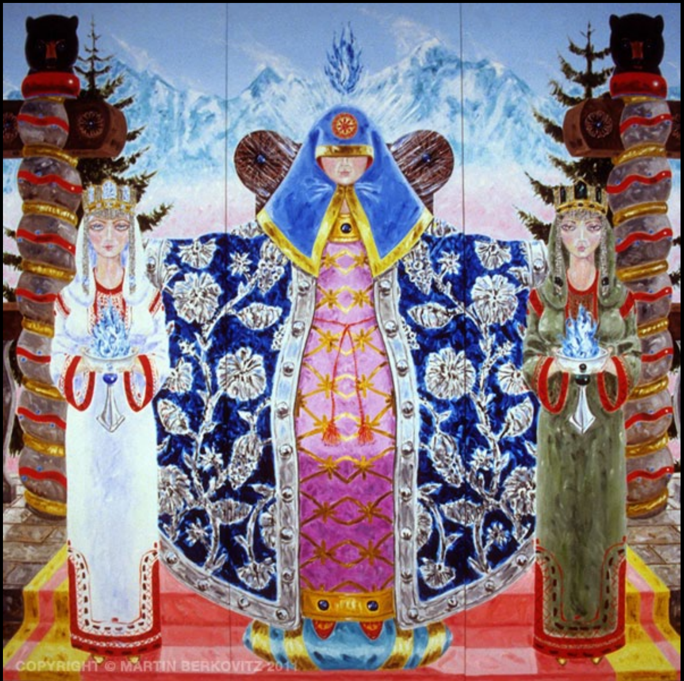
“Great Mother of Belukha” Oil on Linen, 120 in. x 120 in. - 2001