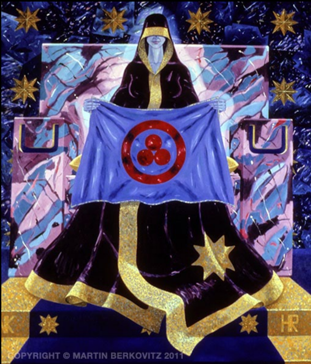
“The Banner of the Mother of the World” Oil on Canvas, 78 in. x 90 in. - 1980