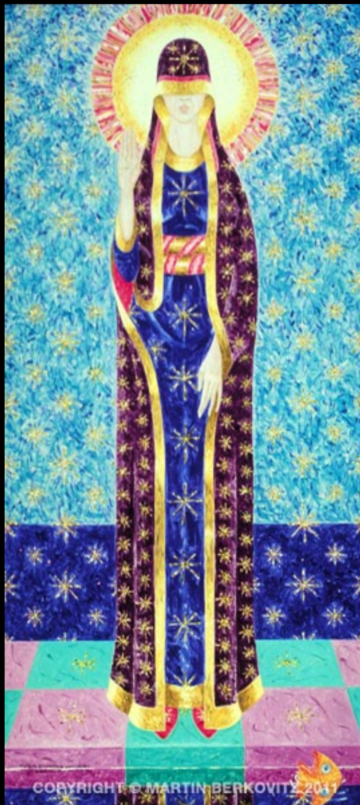
"Benediction" Oil on Linen, 34 in. x 76 in. - 1996