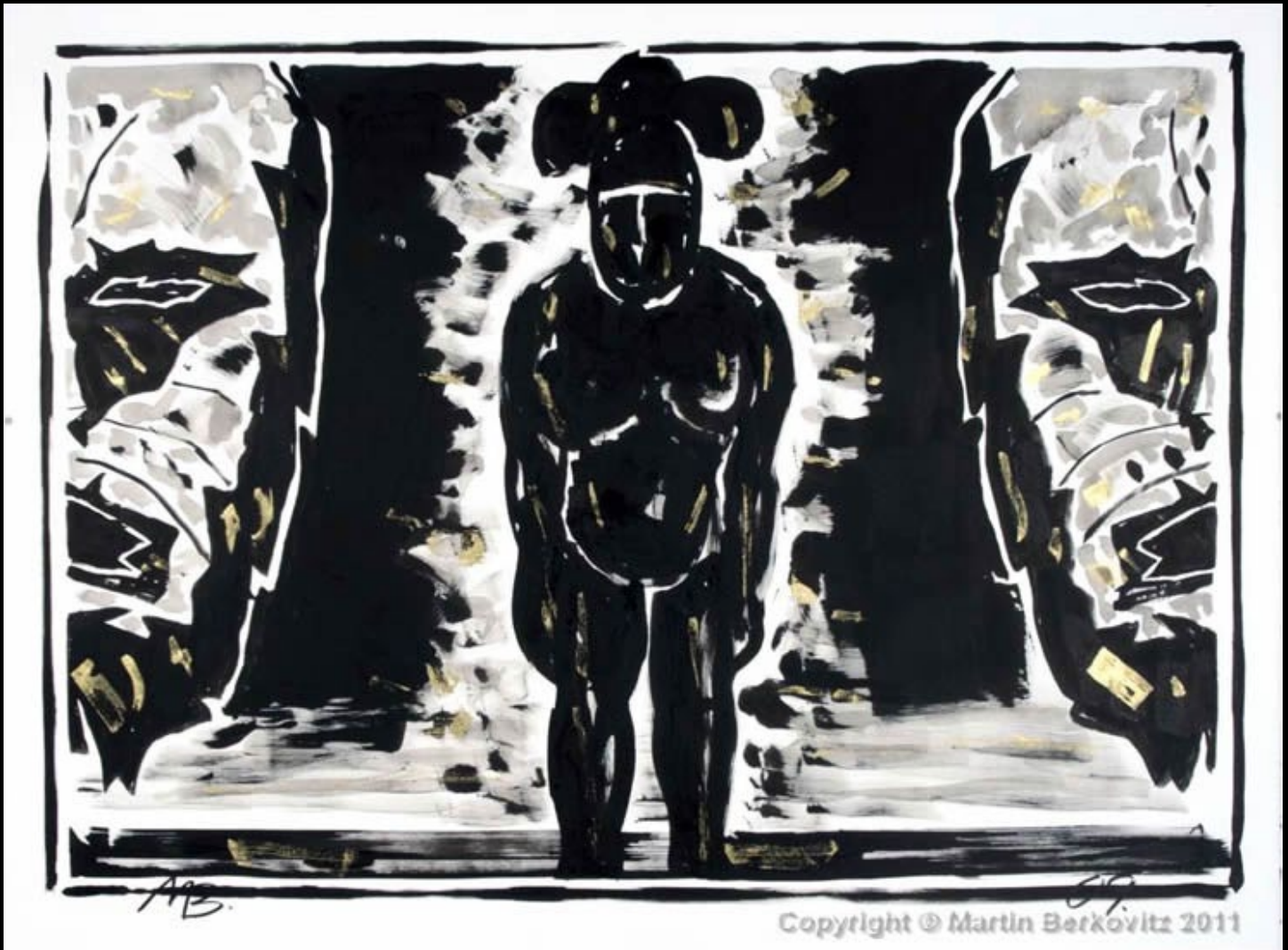
“Mother of the Polar Night 5” Ink and Brush with Gold Gouache, 30 in. x 40 in. - 2009