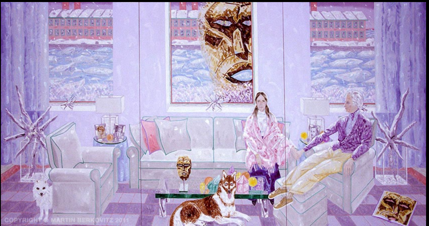
“The Polar Place” Oil on Linen, 102 in. x 198 in. - 2007