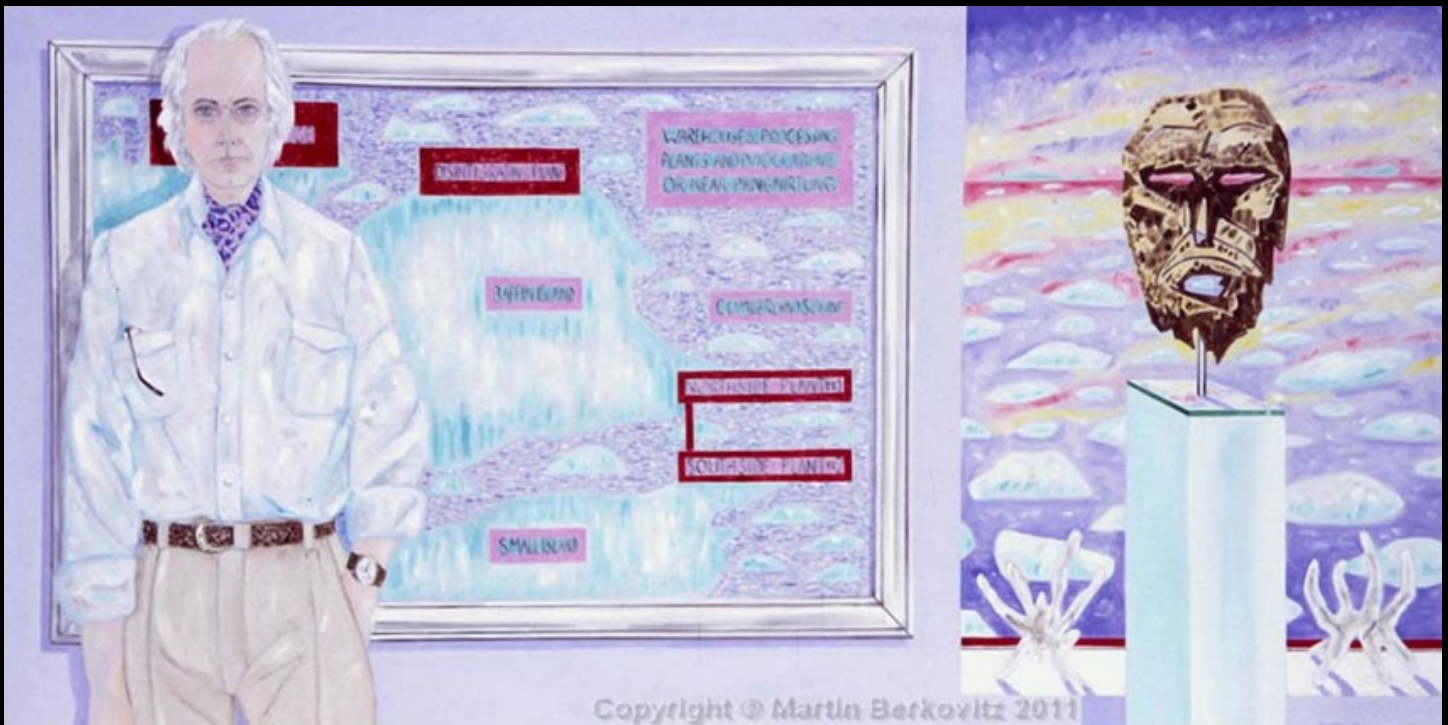
“Self Portrait with Map” Oil on Linen, 46 in. x 90 in. - 2007