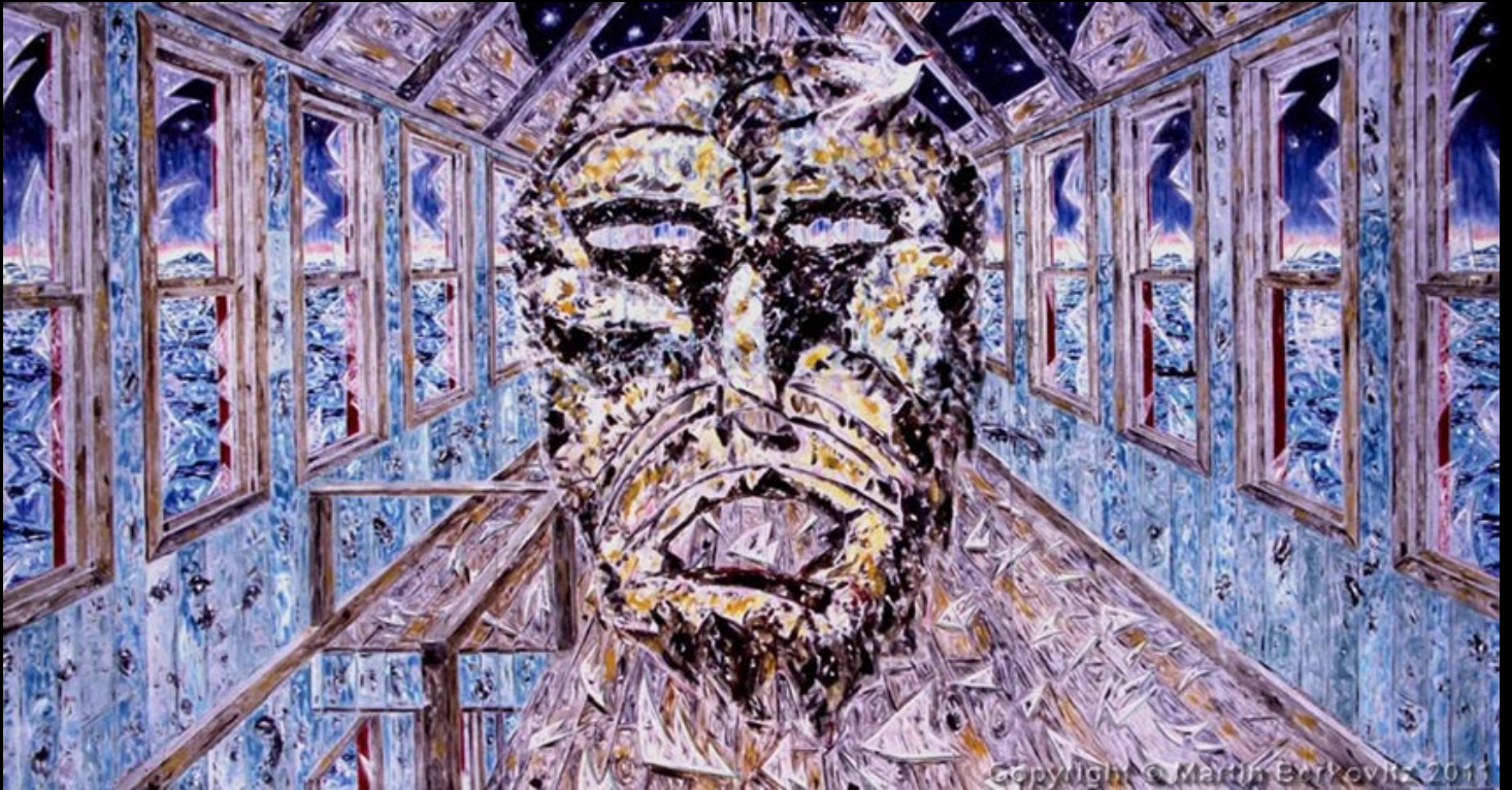
“Great Spirit” Oil on Linen, 102 in. x 198 in. - 2008