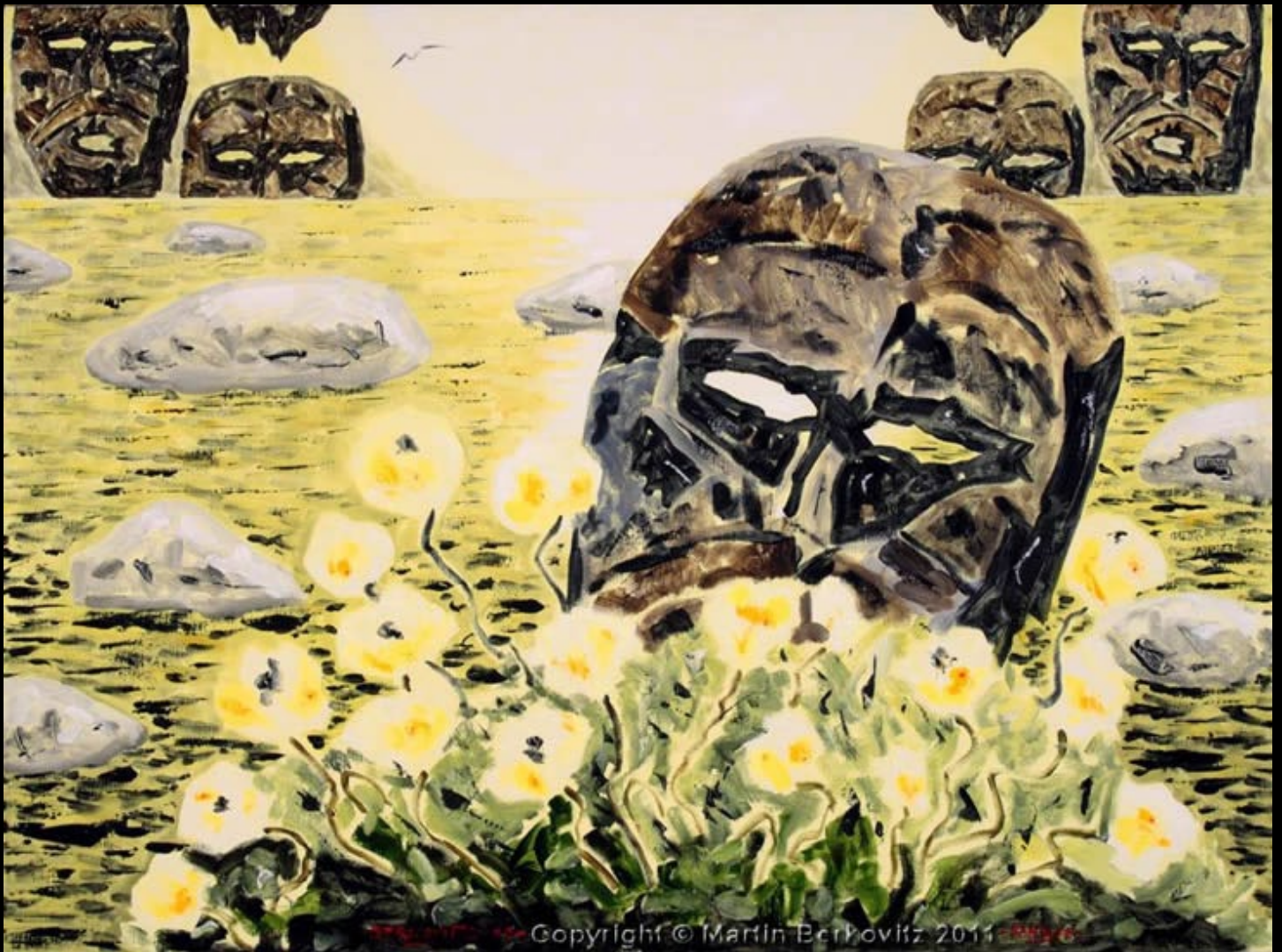
"Arctic Gold" Oil on Linen, 30 in. x 40 in. - 2009