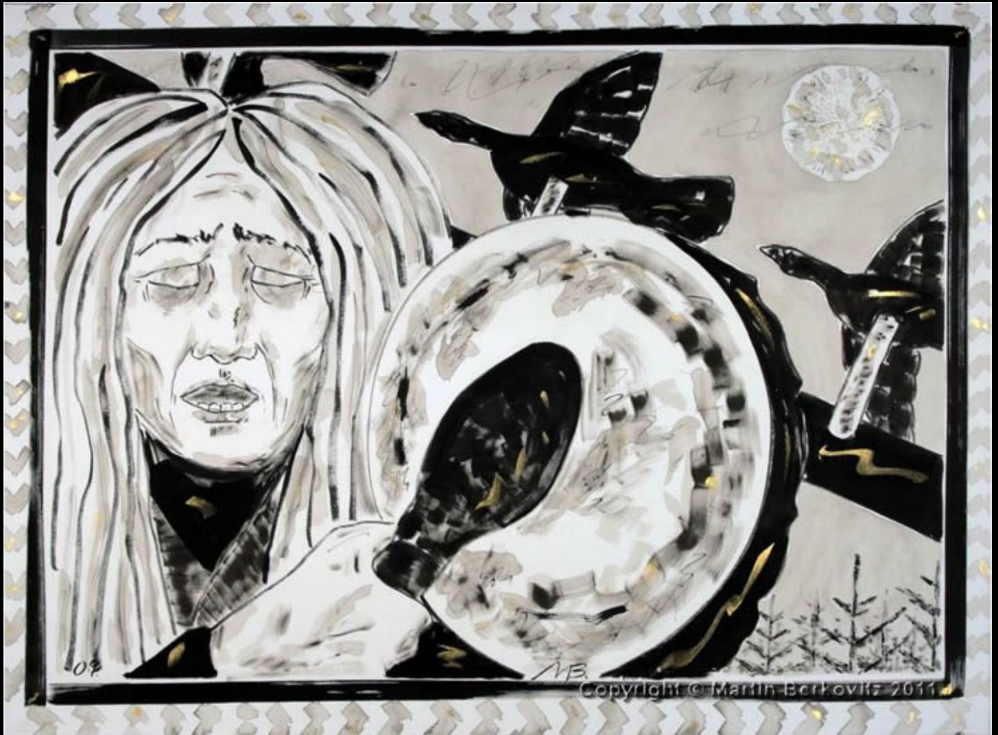
“Siberian Shaman Drummer” Ink and Brush with Gold Gouache, 30 in. x 40 in. - 2009