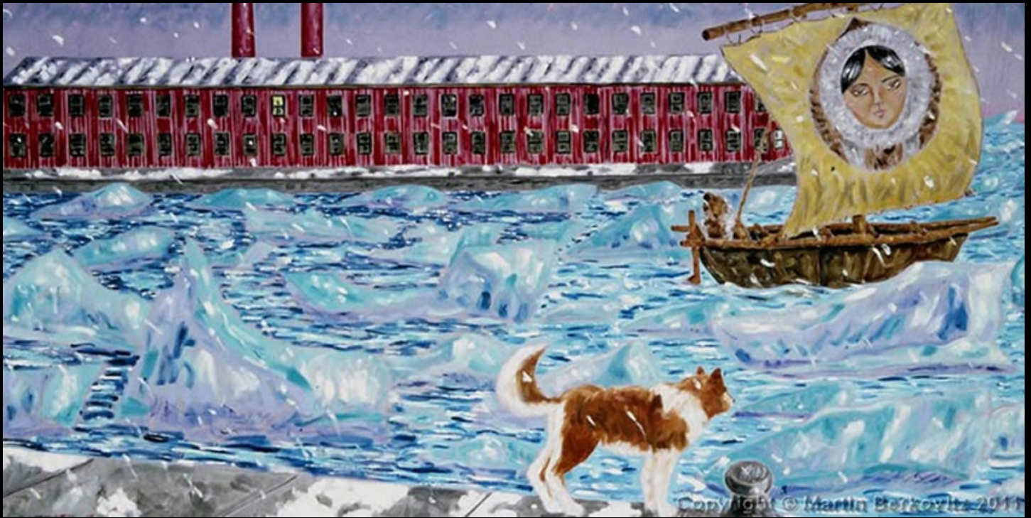
“Above or Near Pangnirtung” Oil on Linen, 46 in. x 90 in. - 2006