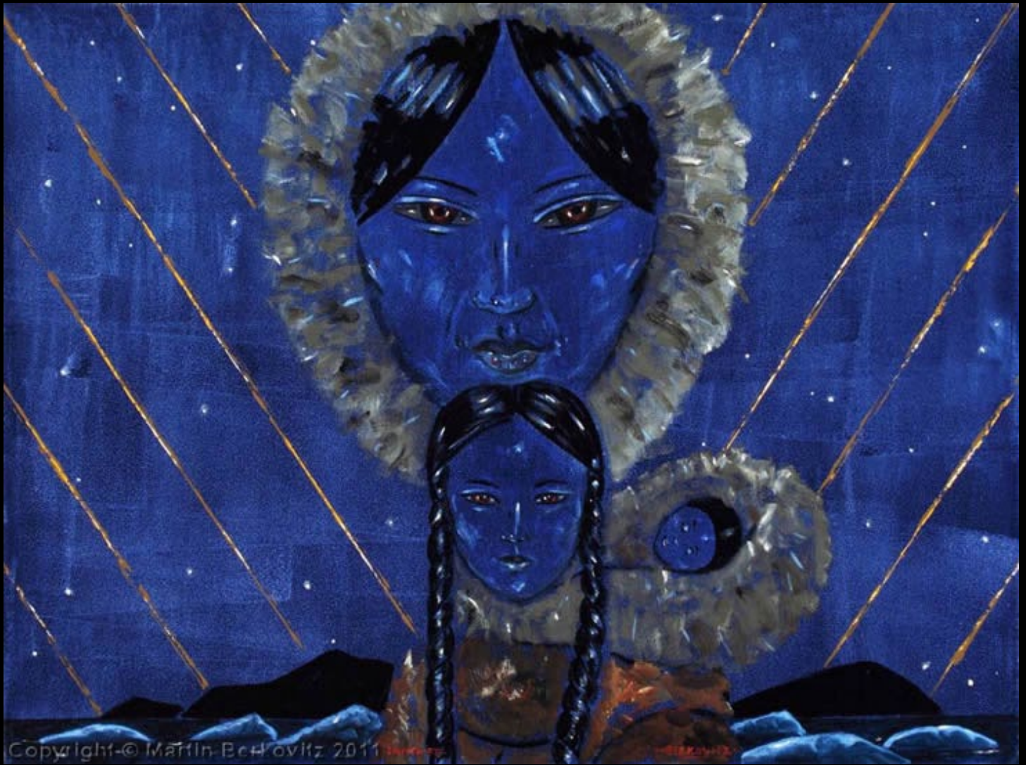
“Daughters of the North” Oil on Linen, 30 in. x 40 in. - 2009