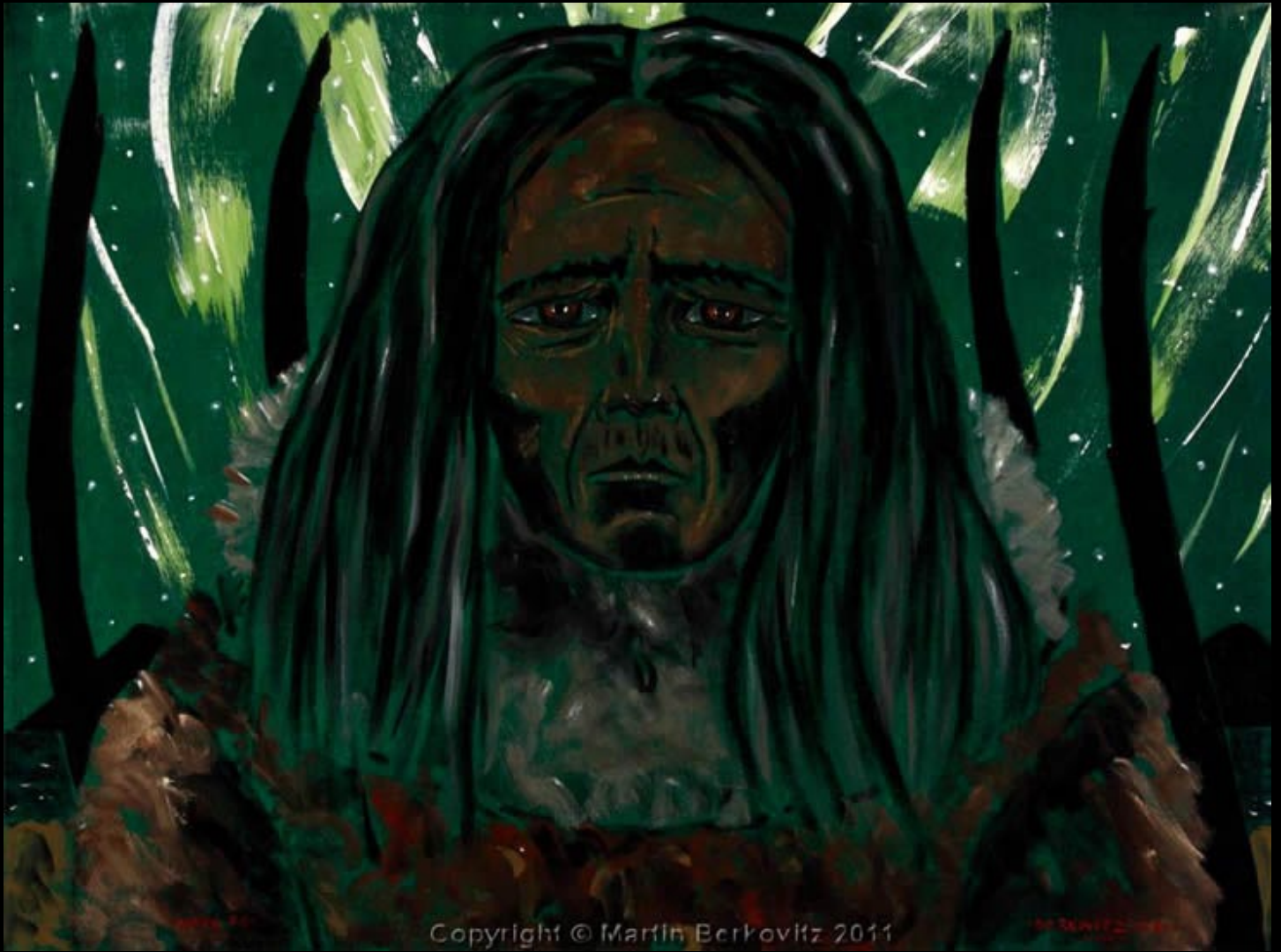
“Arakamchechen” Oil on Linen, 30 in. x 40 in. - 2009