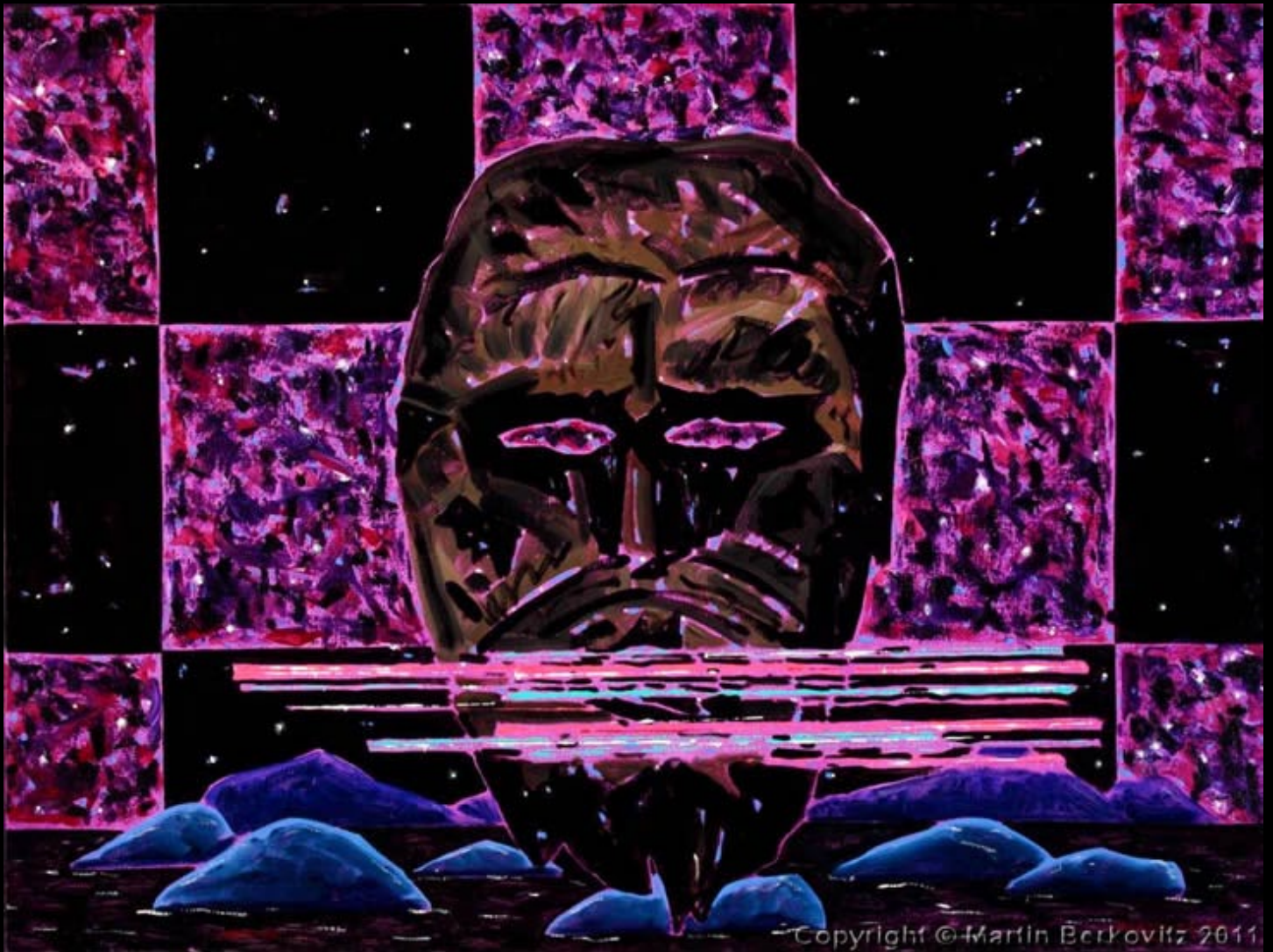
"Voice of the Great Spirit" Oil on Linen, 30 in. x 40 in. - 2009