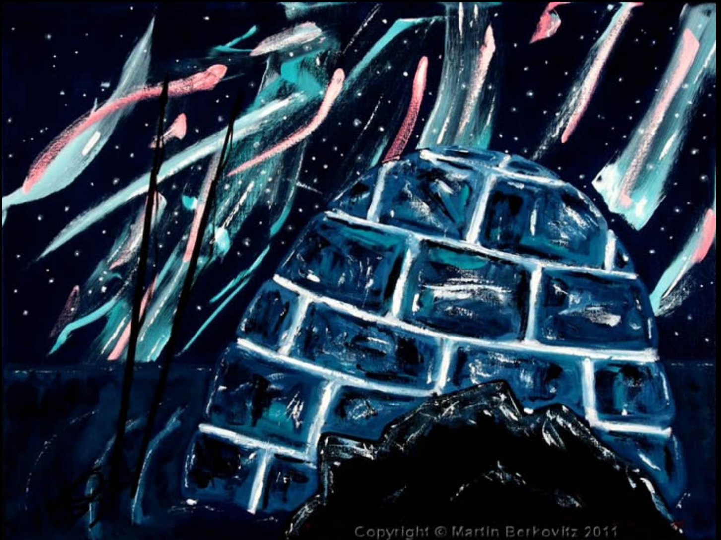
“Isle of Warmth” Oil on linen, 30 in. x 40 in. - 2009