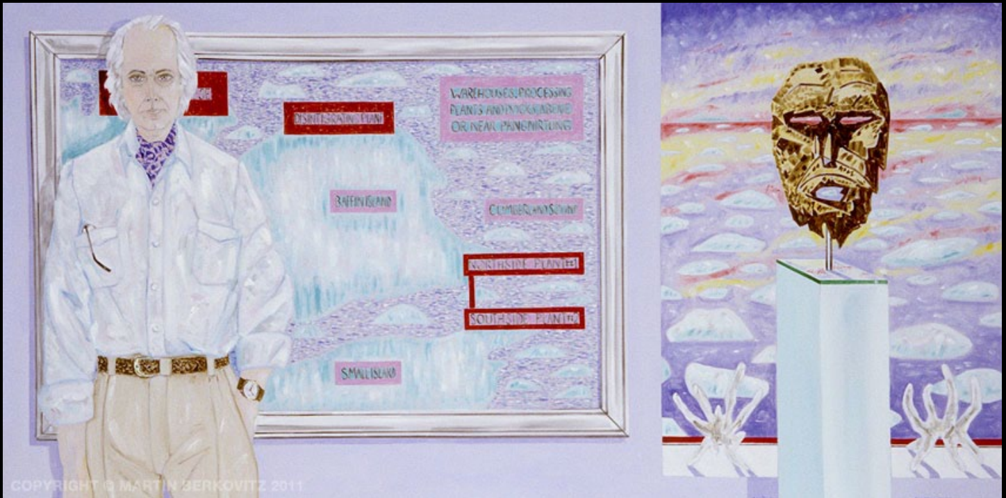
“Self Portrait with Map” Oil on Linen, 46 in. x 90 in. - 2007