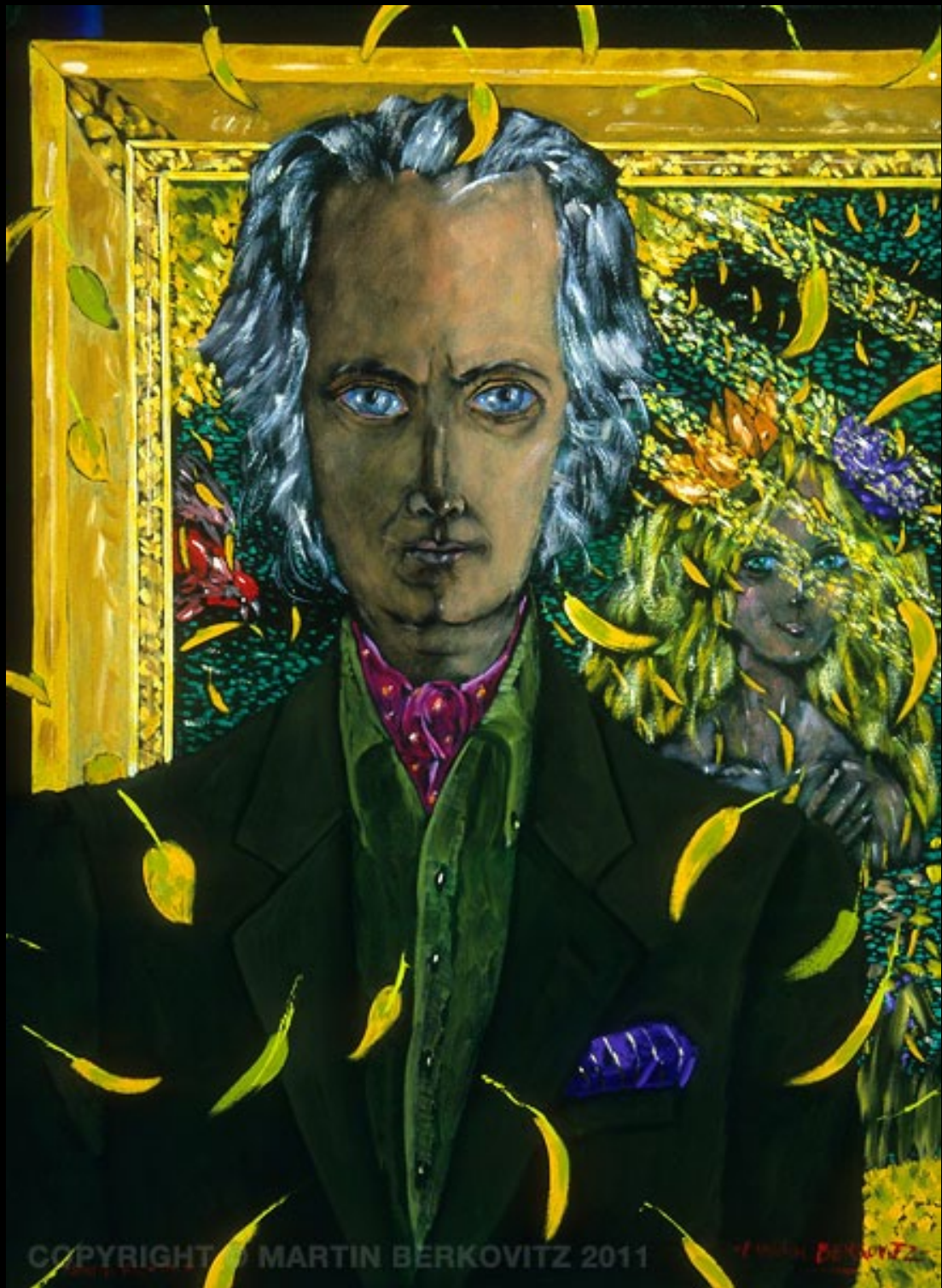
“Self Portrait Study from ‘Mikhail’” Oil on Linen, 22 in. x 30 in. - 2005