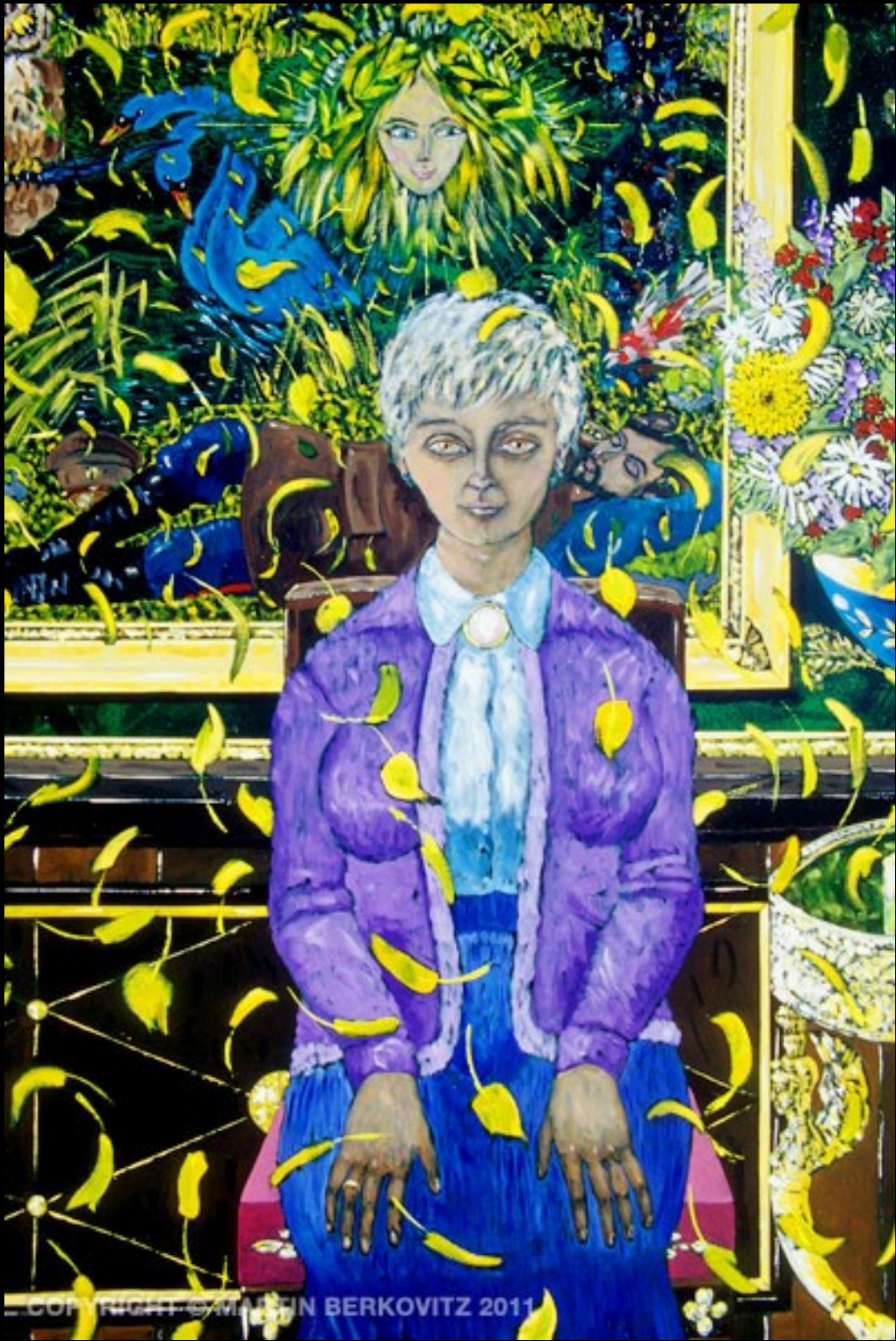
“Mikhail’ (detail): Vera” - 2005