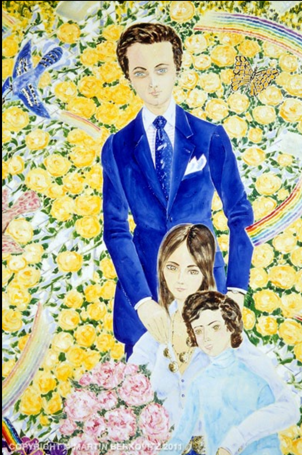
“Passage (detail)” - 2009