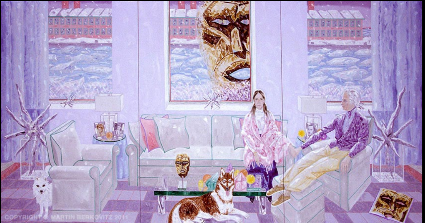
"The Polar Place" Oil on Linen, Triptych 102 in. x 198 in. - 2007