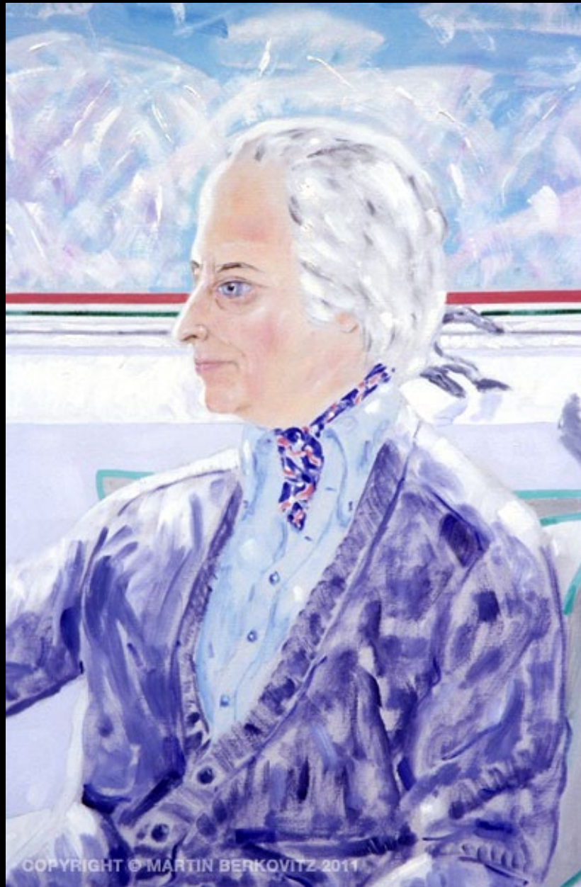
“The Polar Place (detail): Artist” - 2007