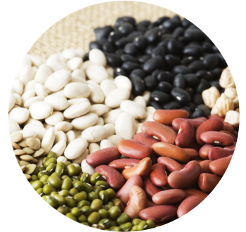
BEAN & LENTILS