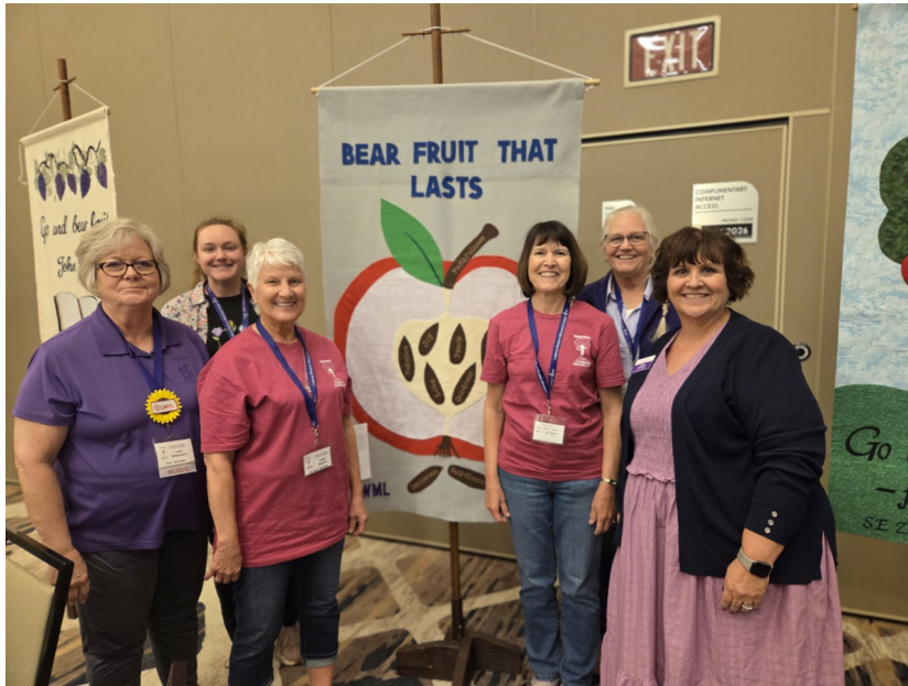
Photo from the LWML Kansas District Convention held in Manhattan April 17-19. There were 283 in attendance. A Mission Goal of $160,600 was approved by delegates for the 2026-2028 Biennium. Highlights were the Opening Worship Service with Holy Communion, Bible Studies, Mites in Action Mission Speakers, and entertainment by Harmony Hill Farmstead and Band. All activities revolved around the theme "Bear Fruit That Will Last" based on John 15:16 emphasizing that we need to stay connected to The Vine so we can bear good fruit that glorifies God and leads others to eternal life.