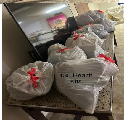
135 Health Kits