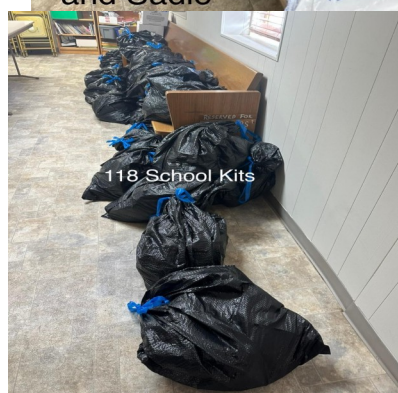
118 School Kits