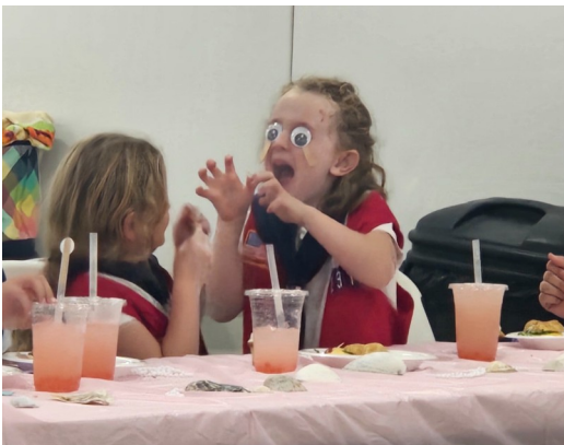
Pictures from the Bring a Friend Night and AHG 30th Birthday Priceless Party.