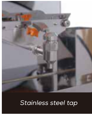
Stainless steel tap