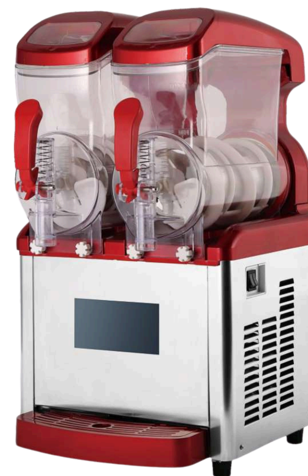
ICE 6LX2– touch

型号(Model): ICE 6LX2-touch 电压(Voltage): 220-240V/110-115V 频率(Frequency): 50/60HZ 冷冻功率(Cold power): 900W 冷冻时平均温度(Cold-beverage temperture): 7°C ~ - -7°C 外形尺寸mm(Shape size): 470X420X740 纸箱尺寸mm(Carton Packing): 480X440X750 木箱尺寸mm(Wooden Packing): 520X480X810 净重kg(Net Weight): 43 毛重kg(Gross weight): 54