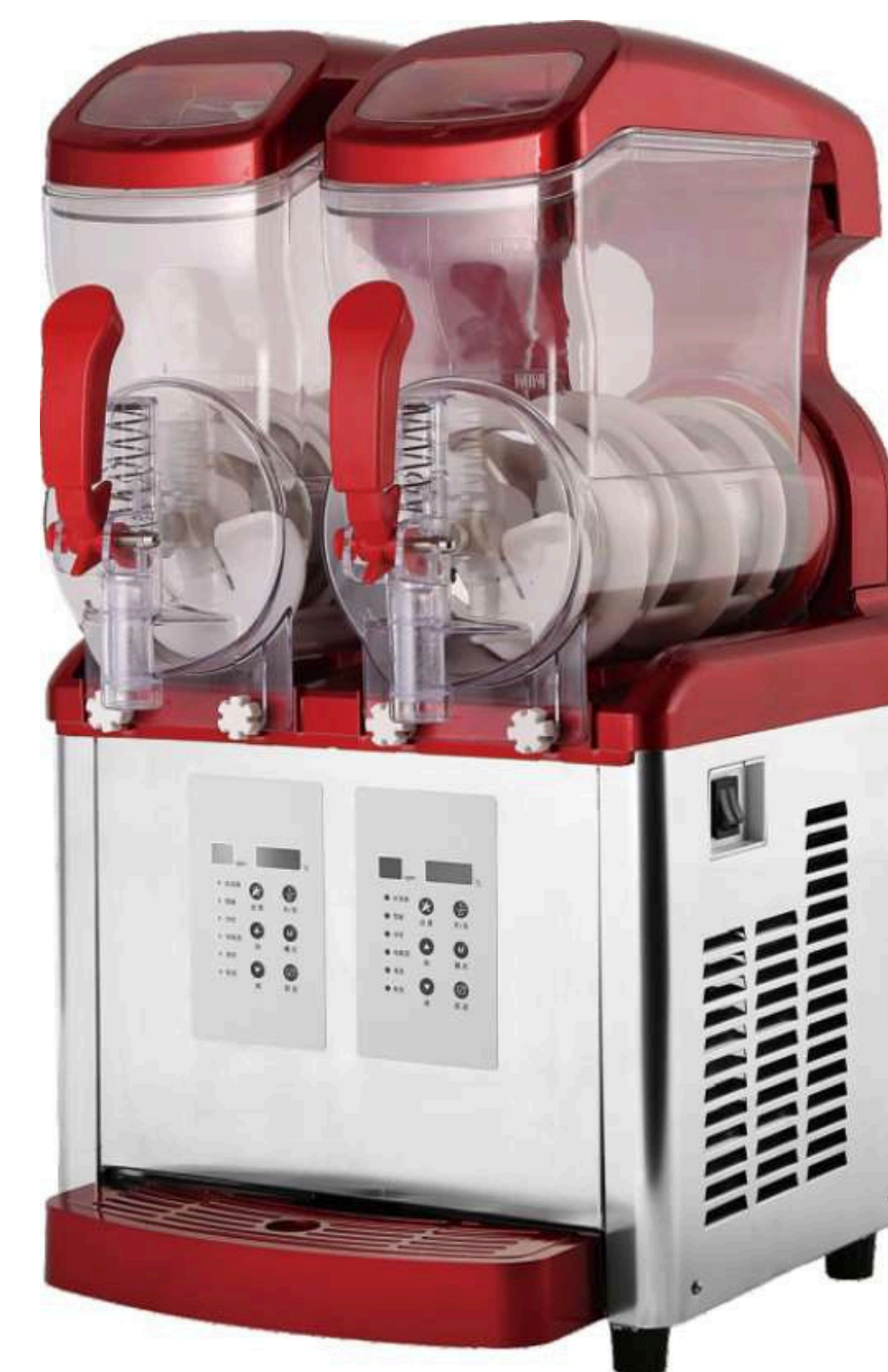
ICE 6LX2– digital

型号(Model): ICE 6LX2-digital 电压(Voltage): 220-240V/110-115V 频率(Frequency): 50/60HZ 冷冻功率(Cold power): 900W 冷冻时平均温度(Cold-beverage temperture): 7°C ~ - -7°C 外形尺寸mm(Shape size): 470X420X740 纸箱尺寸mm(Carton Packing): 480X440X750 木箱尺寸mm(Wooden Packing): 520X480X810 净重kg(Net Weight): 43 毛重kg(Gross weight): 54