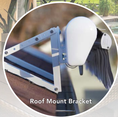
Roof Mount Bracket