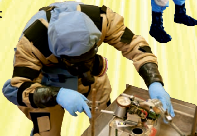
FPS CBRNE Fragment Protection System