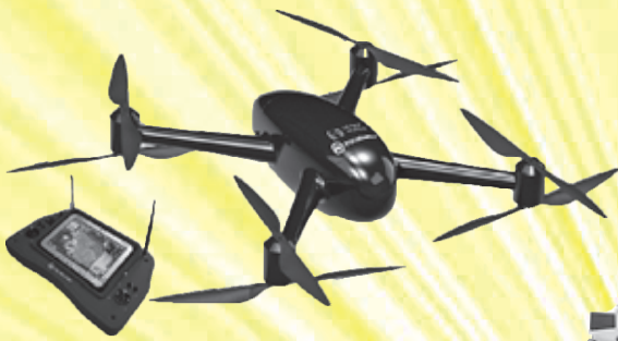
UAIS PM2110 Radiological/ Chemical Reconnaissance