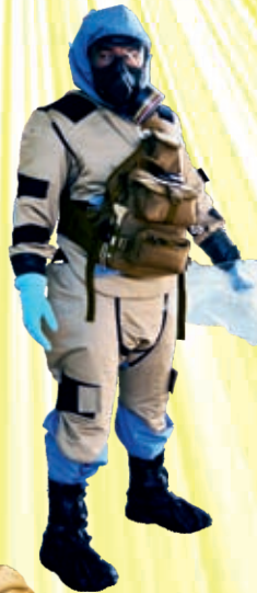
Modular CBRNE Sampling Kits