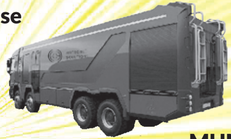
MHMTU Hazardous Material Plasma Treatment Unit

Transforming operational experience to operational solutions: a full spectrum of unique products for hazardous substances management