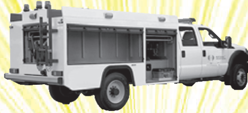
FR1 Fast Response