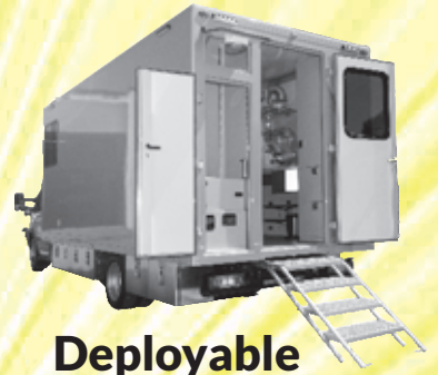
Deployable Analytical Laboratories