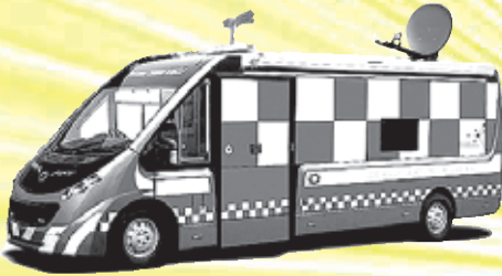
ICP Incident Command