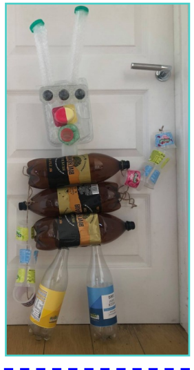
Three worthy winners!