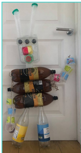
Three worthy winners!