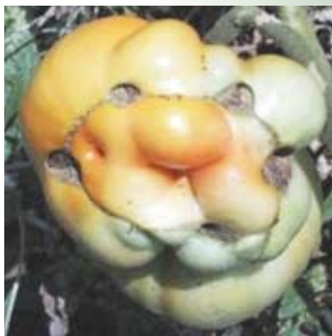
Catfacing can result from herbicides or from cool weather as the blossom are just beginning to be formed. Varieties differ in their susceptibility to this problem.

Do not refrigerate tomatoes! The cold temperature will ruin the flavor.