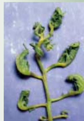
Exposure to herbicides can cause thick rubbery, misshapened leaves.

Cracking is a related problem. Both concentric cracks around the stem end and lateral cracks (from the stem to the blossom end) may be caused by severe fluctuations in moisture or temperatures. Loss of foliage due to disease may worsen cracking. Again, some varieties are more susceptible, although even highly resistant cultivars may develop cracks when grown under the right (or wrong) conditions.