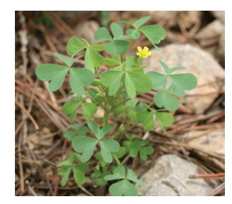
Yellow woodsorrel (oxalis)