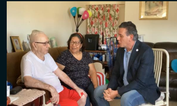
Non-verbal patient now sings