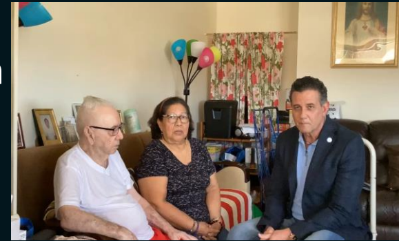
Testimonial with patient & wife