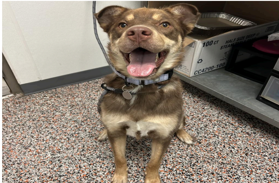
Cortana (Shepherd, Australian mix) Female

Meet Cortana, the epitome of youthful exuberance and boundless energy! This wiggly, playful girl is eagerly awaiting her chance to join a loving family as their ultimate adventure buddy.