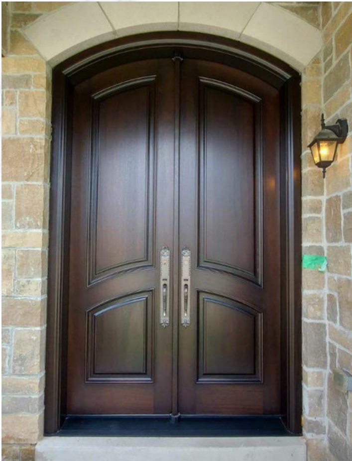
MODEL: DD2A Stain: Nior