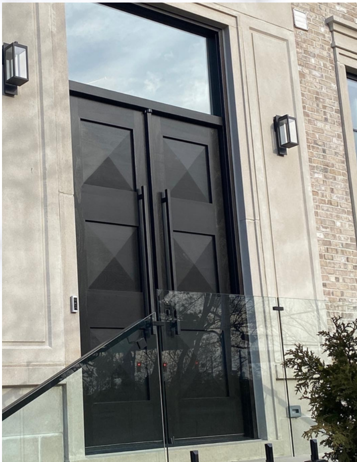
MODEL: D3PP Stain: Shaded Tru Black