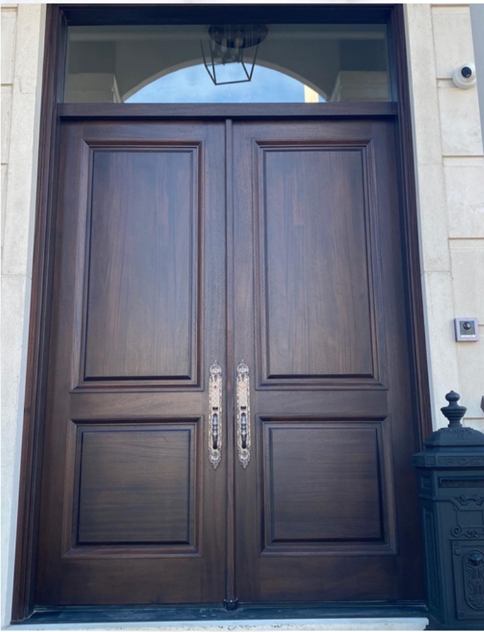
MODEL: DD2P Stain: Brown Mahogany