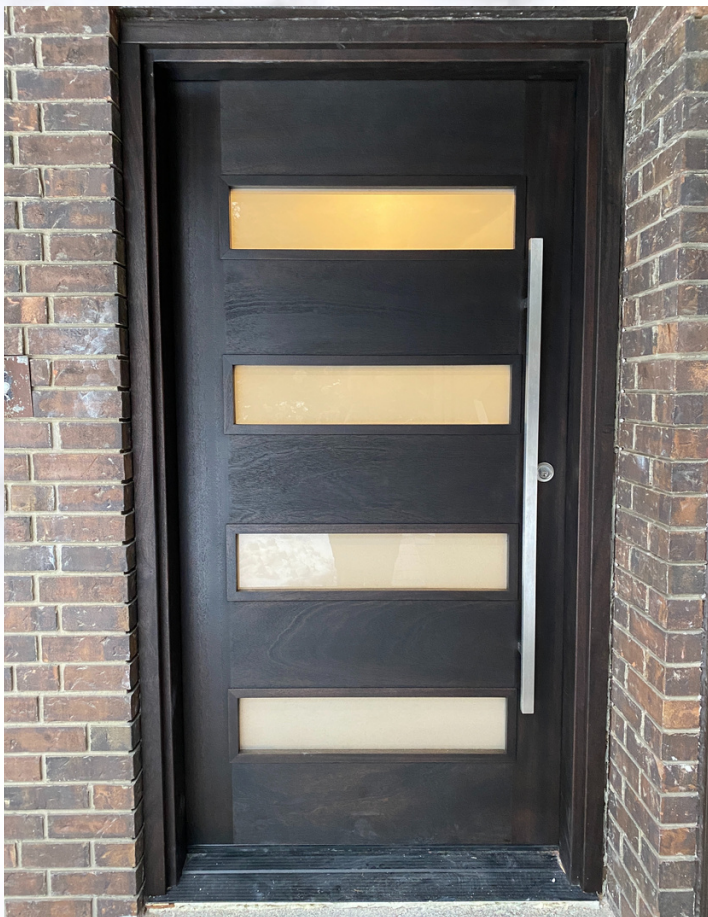
MODEL: S4G Stain: Brown Mahogany