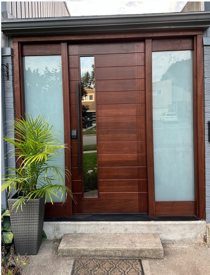
MODEL: SFNG Stain: Rose Wood