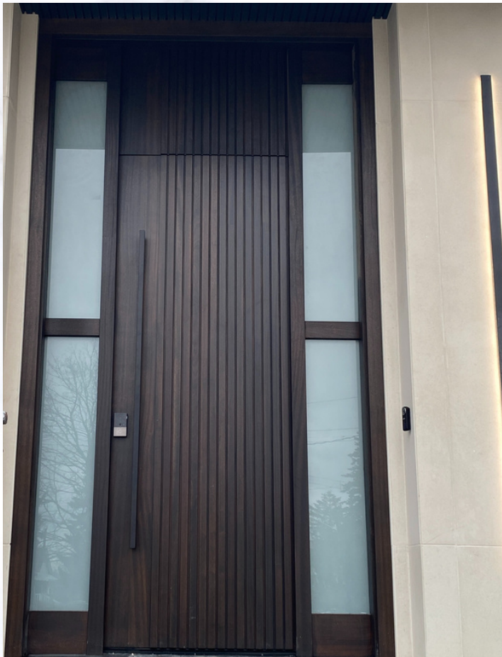
MODEL: SFFM Stain: NIOR