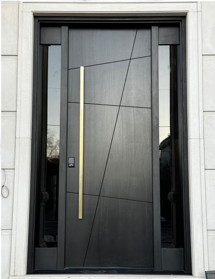
MODEL: FCG3 Stain: Shaded Tru Black