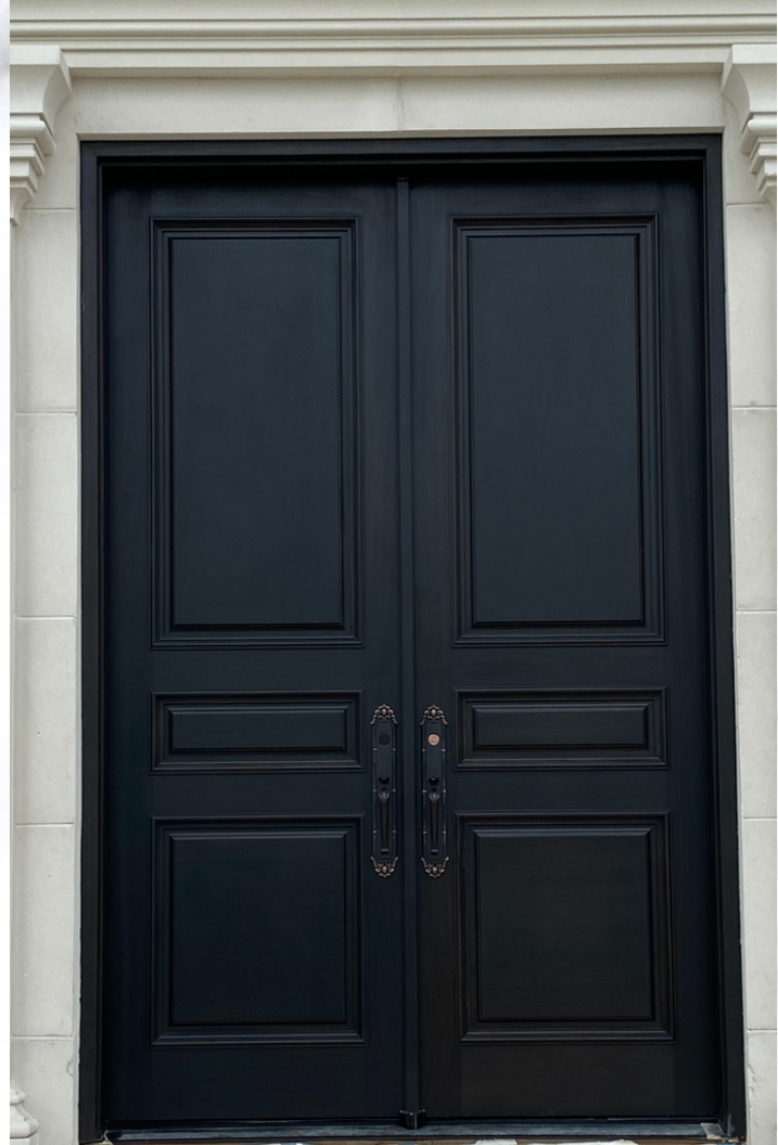
MODEL: DD3P Stain: Tru Black