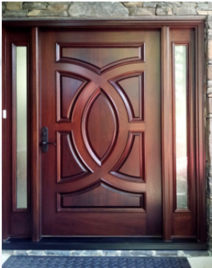
MODEL: SFH1 Stain: Brown Mahogany