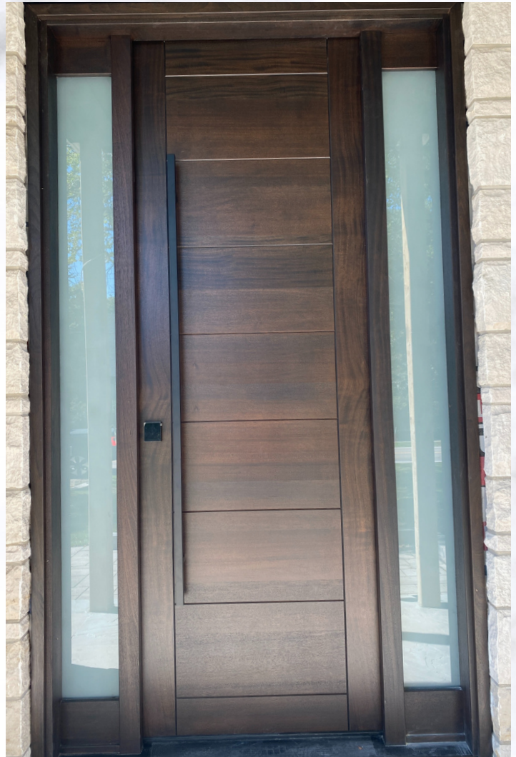
MODEL: FCG2 Stain: NIOR