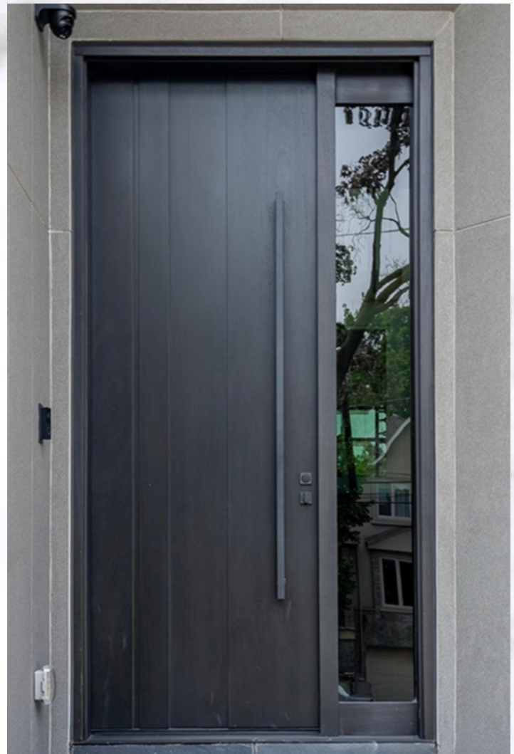
MODEL: S3FP Stain: GUNSTOCK WALNUT