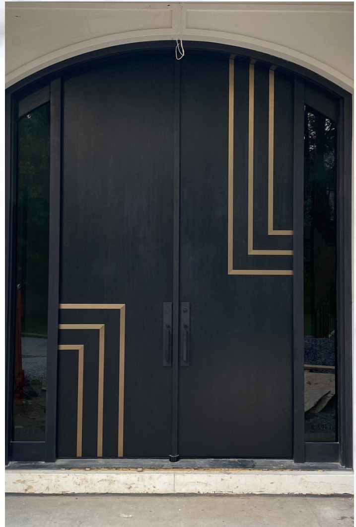
MODEL: DFCB Stain: Shaded Tru Black