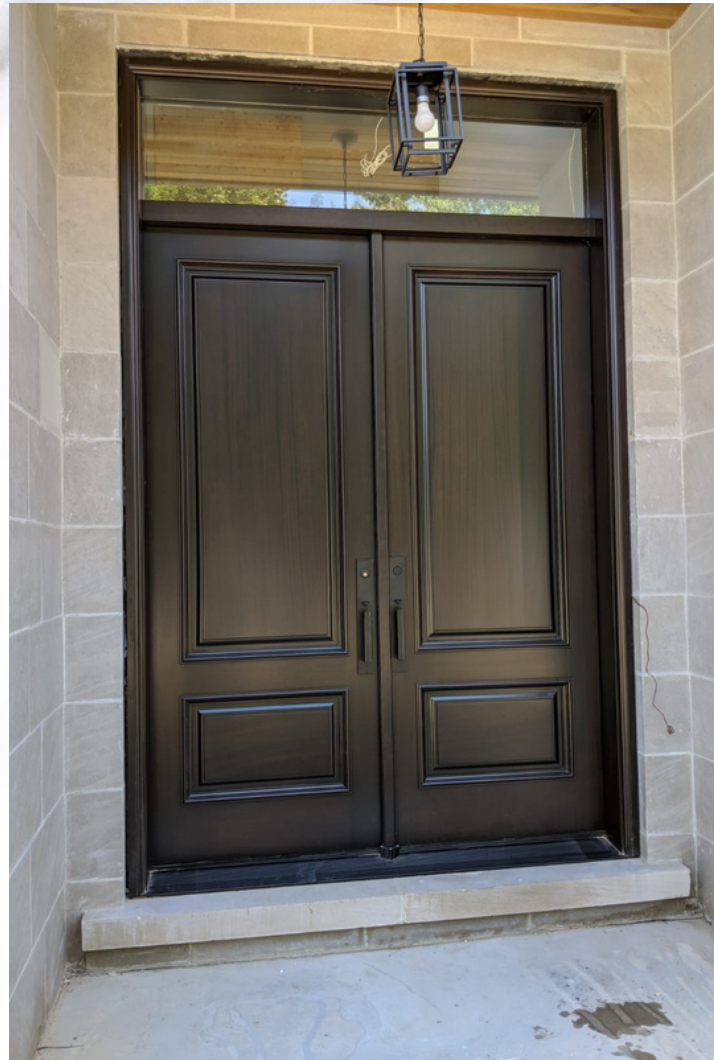
MODEL: DD2PS Stain: Brown Mahogany