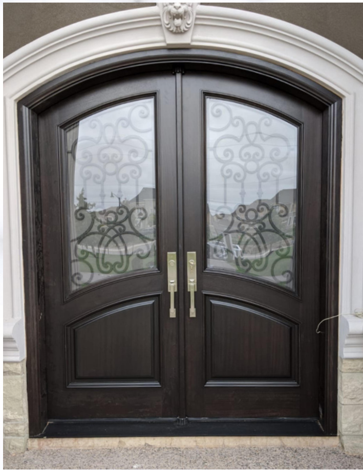
MODEL: DAG1 Stain: Brown Mahogany