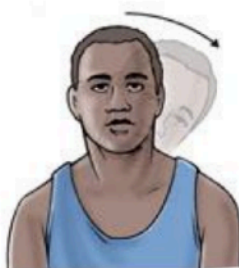
Active neck sidebend