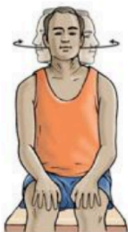
Active neck rotation