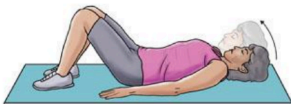
Head lift: Neck curl