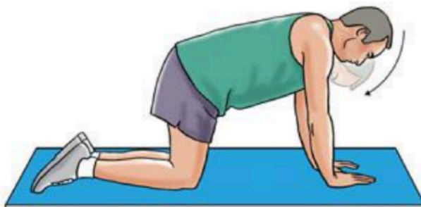
Neck extension on hands and knees