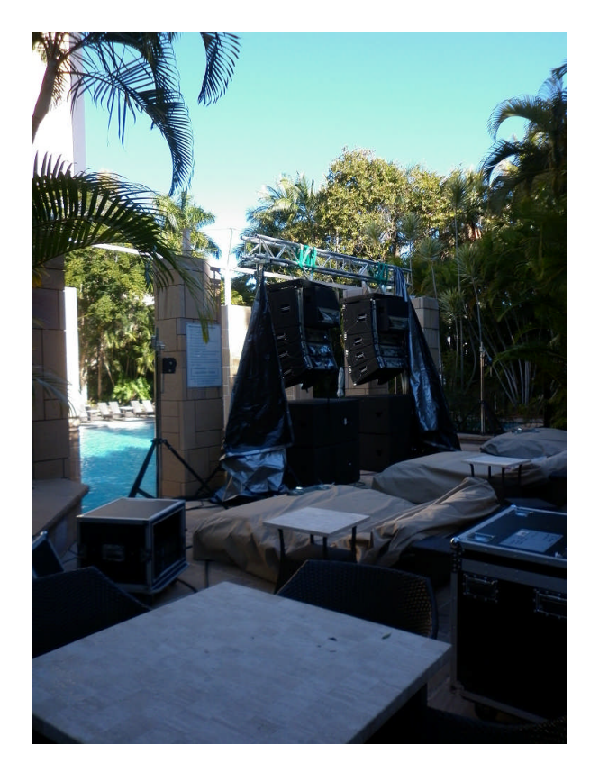
Figure 4 – Line Array sound system (rear view)