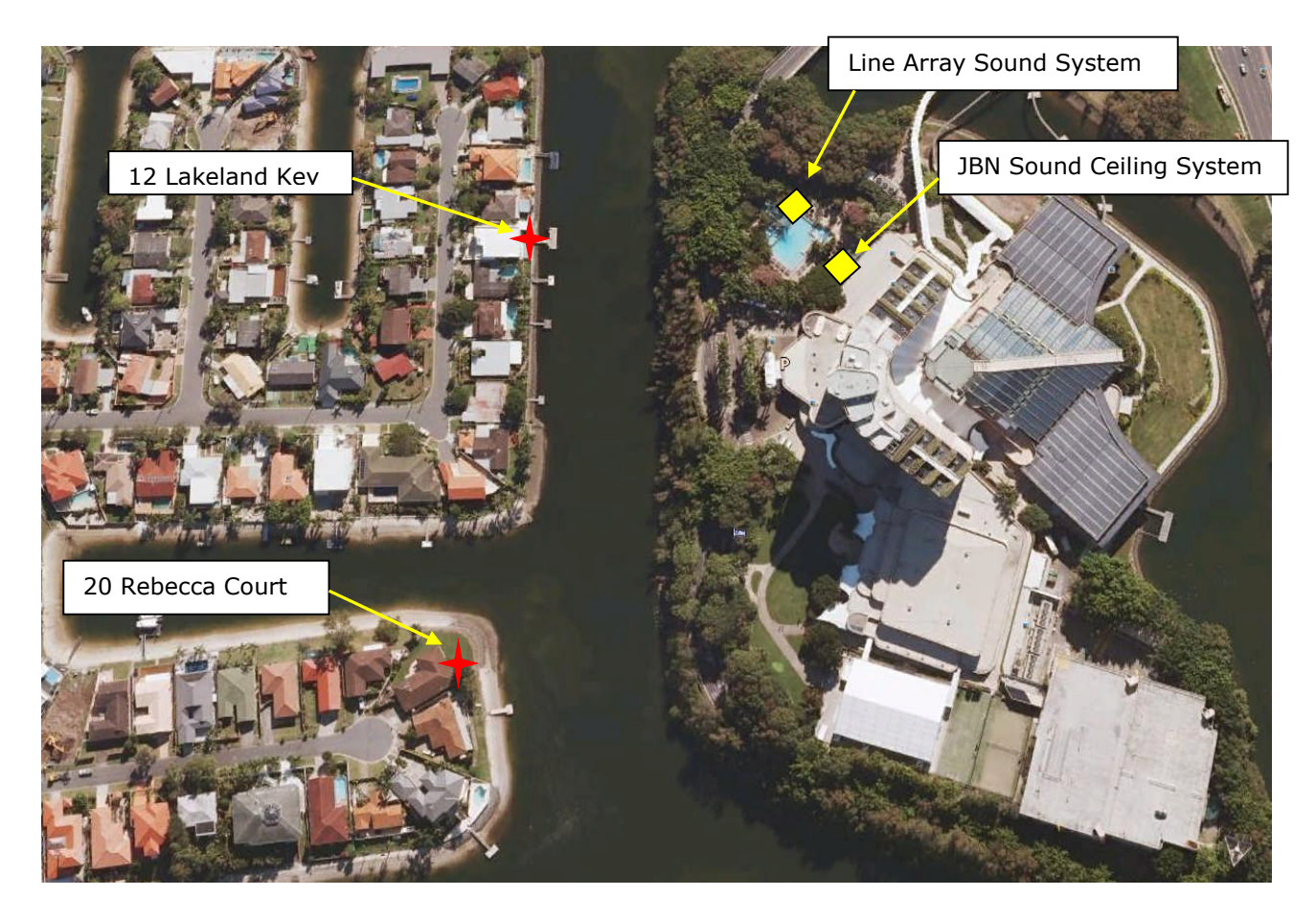
Figure 9 – Speaker System Locations & Residential Measurement Locations