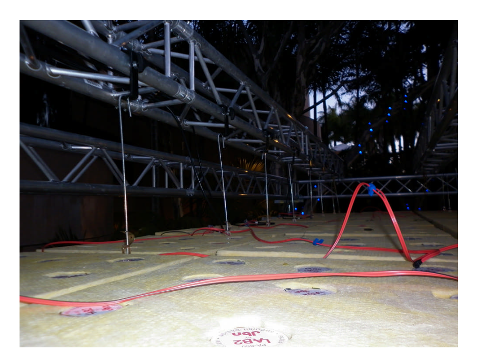
Figure 2 – Sound Ceiling panel from above

A second standard Line Array sound system was setup near the pool area in order to compare noise levels against the Sound Ceiling system. Figures 3 and 4 show photographs of the Line Array system from front and rear views.