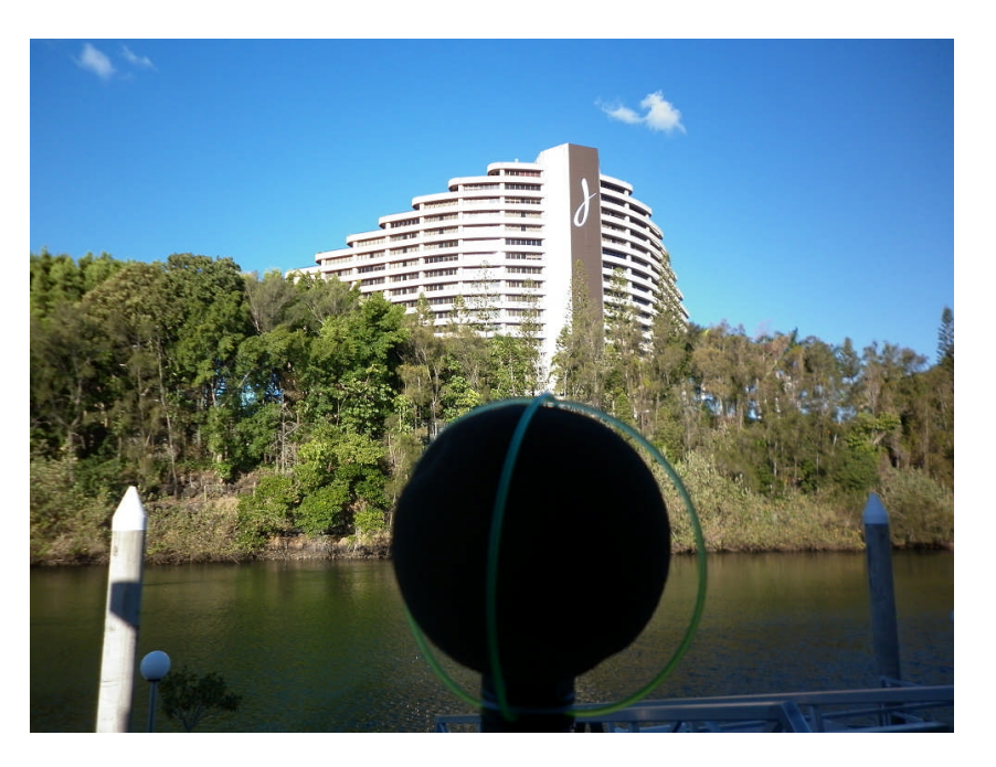
Figure 8 – Noise Measurement location at 12 Lakeland Key

The second location was at the rear yard of 12 Lakeland Key, facing the canal and Jupiters Casino. The location is approximately 115m east of the Line Array sound system and 130m east of the Sound Ceiling system. Refer to Figure 8 for view to Casino from noise meter.