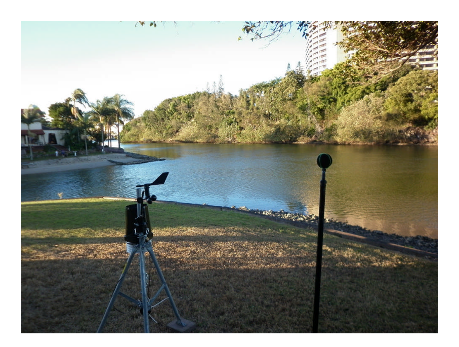
Figure 7 – Noise Measurement location at 20 Rebecca Court

The second location was at the rear yard of 12 Lakeland Key, facing the canal and Jupiters Casino. The location is approximately 115m east of the Line Array sound system and 130m east of the Sound Ceiling system. Refer to Figure 8 for view to Casino from noise meter.