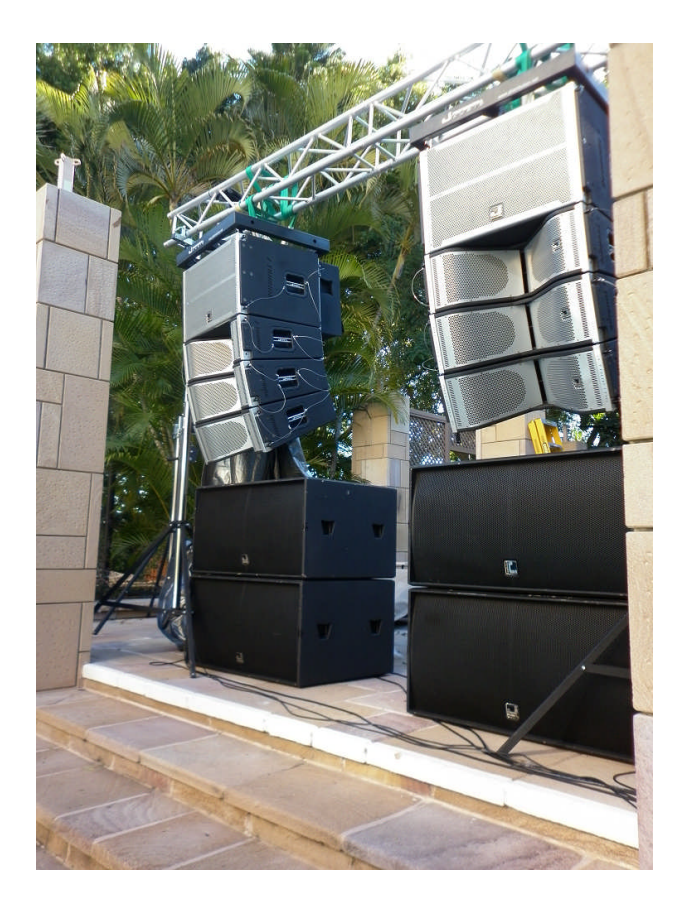
Figure 3 – Line Array sound system (front view)