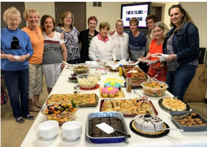
The "GLOH Girls" enjoyed a summer picnic at their June gathering. Meetings are in recess for the summer months, and will resume on September 9.