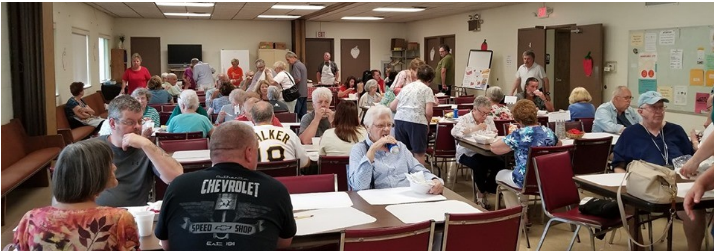
A great big thank you to everyone who came by to enjoy the Strawberry Festival and Chinese Auction!