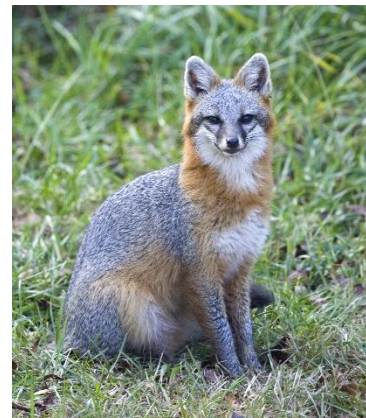
Gray foxes are common in residential areas across North Carolina.