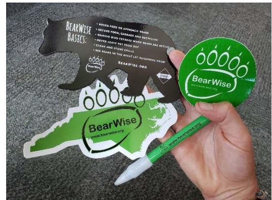
BearWise provides printable handouts and other items for community residents that teach how to live responsibly with bears.