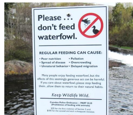
Ordinances against feeding ducks and geese can help prevent overpopulation issues.