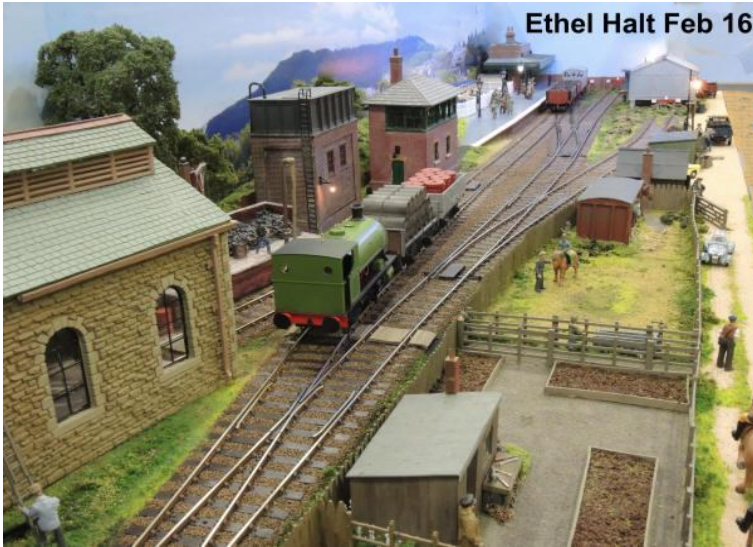
Ethel Halt Feb 16

A privately owned branch line terminus in the Colonel Stevens vain.