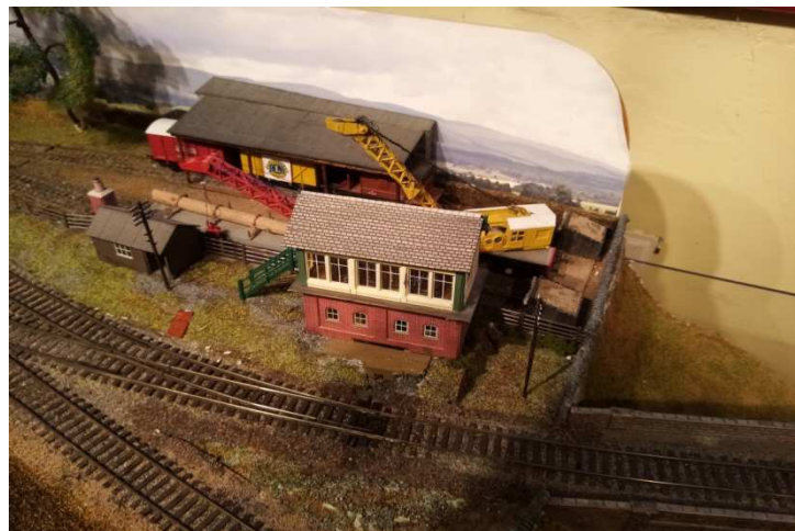
Grassington Signal Box