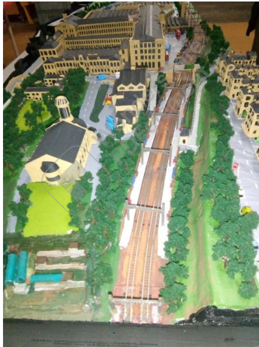
Salts Mills Layout Track Plan

The layout will be based on a dog bone type layout configuration and as it is a main line running there will be different types of trains and consists of freight with specials.