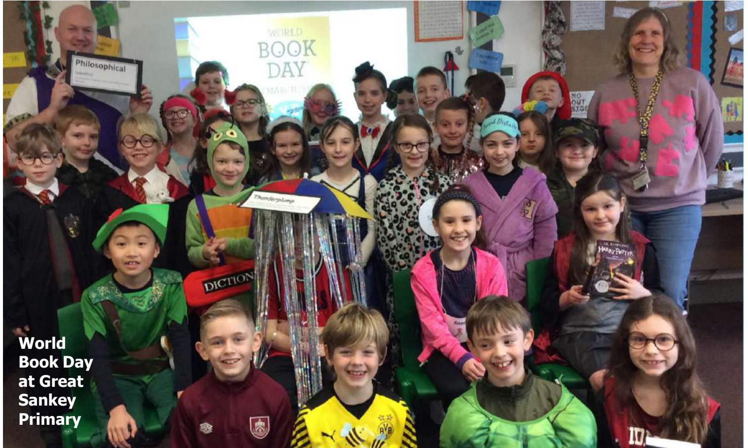
World Book Day at Great Sankey Primary