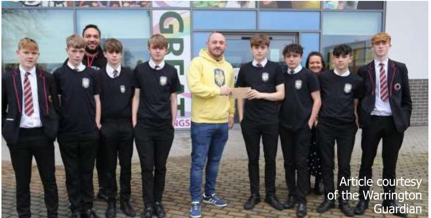
Article courtesy of the Warrington Guardian

Support plaques will be placed at suicide hotspots across the town thanks to a group of inspiring Orford high school boys.