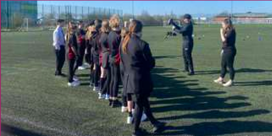
Year 7 engaged with a new sport this term. They enjoyed an American football session in the sun with Edstart Warrington.