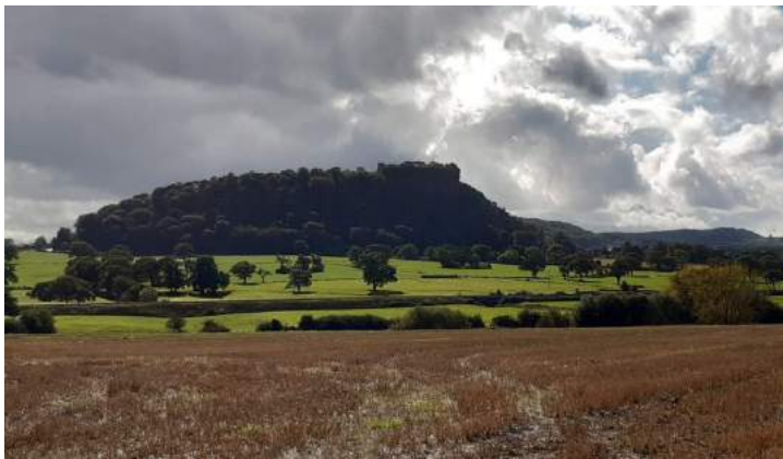
155 Year 10 students have completed their Bronze Duke of Edinburgh expedition. Both weekends had their challenges with two expedition groups hiking and camping across south west Cheshire from Whitchurch all the way to Kelsall. All students completed the weekends with an excellent attitude.