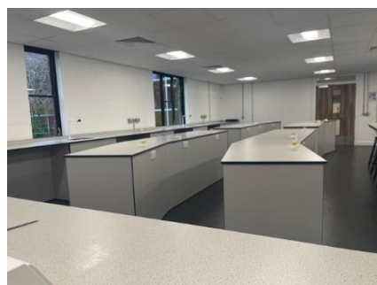
New Science Labs