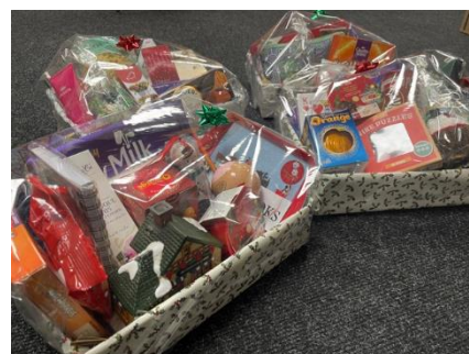
Christmas Pamper Packs

All academy news is shared through social media and our website so please do follow us.