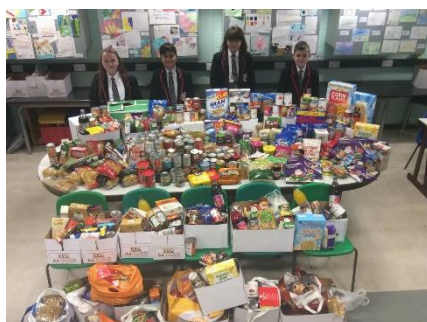
Helping Hands Food Collection