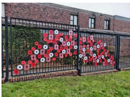
Remembrance Day Poppy Display

Staff and students have always held a number of Christmas events to welcome the elderly and vulnerable into the Academy. Due to the restrictions in place, we have had to be a little more creative producing over 100 pamper packs and virtual musical performances.