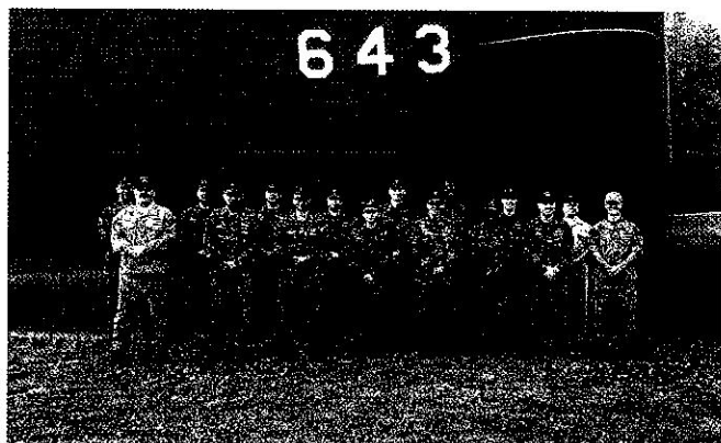
Members of SSGN CMAV LANT, SUBLANT UWO 1 and CTF 69 UWO ATL at Naval Submarine Base Kings Bay.