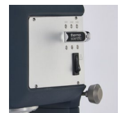
USB memory stick for data transfer