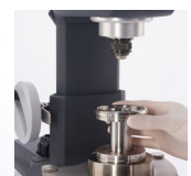
Quick bayonet mountings