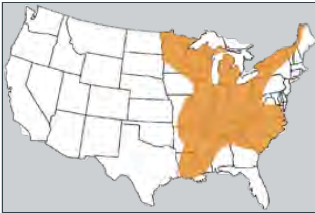
United States: common areas highlighted in orange

Has your dog been exposed to regions of the country where blasto frequently occurs?