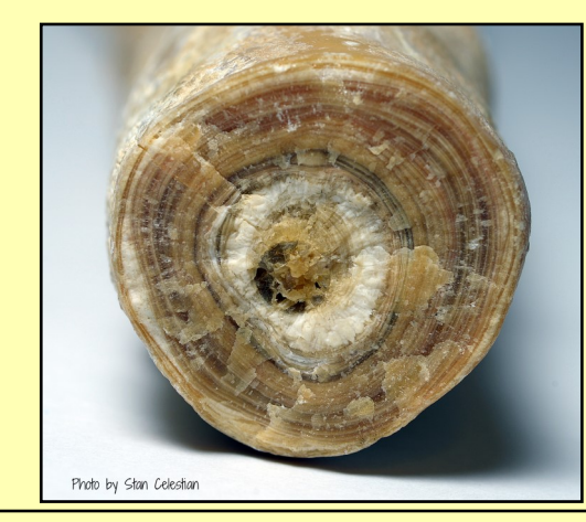
Figure 12 Travertine This is a view of the cross section of a speleothem. As groundwater dripped into a cavern, degassing and evaporation caused the precipitation of calcite. Photo by Stan Celestian

Figure 11 Travertine This lovely rock was created in ancient springs near Mayer, AZ. Small and varying amounts of iron oxide has produced the color banding. In 1927 there were 7 carmakers who used rock from Mayer for such details as gear shift knobs. Today you will see the quarry being worked for dimension stone. Photo by Stan Celestian