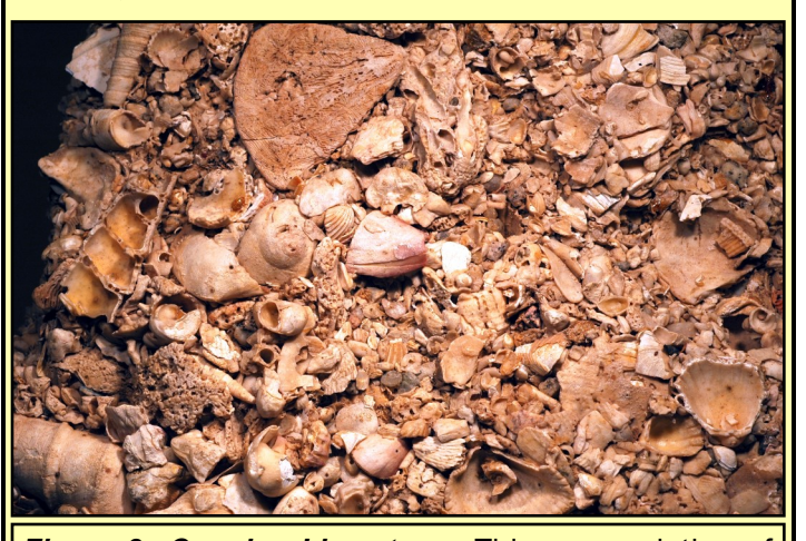
Figure 8 Coquina Limestone This accumulation of shells and shell fragments formed on a Pleistocene (about 130,000 years ago) beach at Rocky Point, Puerto Peñasco, Sonora Mexico.

Coquina Limestone Environment of Deposition : Coquina forms in places where the water is highly agitated, and capable of transporting and concentrating accumulations of relatively large shells and coral. During that transportation, the shells are abraded, broken, rounded, and sorted. The high energy tends to wash out any smaller sediment, leaving the heavier shell fragments to accumulate. These conditions are found on beaches, tidal channels, bars, and submarine banks.