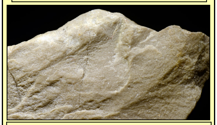
Figure 6 Oolitic Limestone This is a famous oolitic limestone building stone, from Oolitic, Indiana. The town was originally named Limestone, but the Post Office denied that name, as another Indiana town already had that name. Notable structures built of this limestone include: Empire State Building, Pentagon, Washington National Cathedral, Yankee Stadium, and 35 of the 50 state capitol buildings ( Wikipedia ). You will probably have to enlarge the screen view (200-400x) to see the oolites.