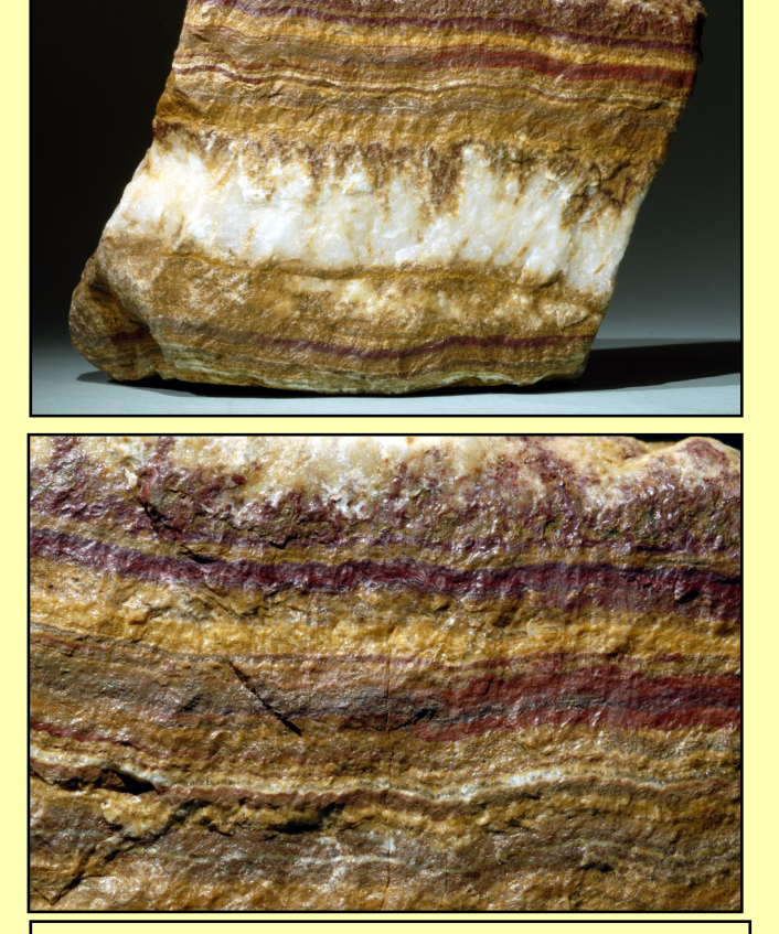
Figure 11 Travertine This lovely rock was created in ancient springs near Mayer, AZ. Small and varying amounts of iron oxide has produced the color banding. In 1927 there were 7 carmakers who used rock from Mayer for such details as gear shift knobs. Today you will see the quarry being worked for dimension stone. Photo by Stan Celestian

Figure 10 Tufa This interesting, porous, irregular formation is a bit of tufa that formed around hot springs issuing into Mono Lake, in northern California. Photo by Stan Celestian