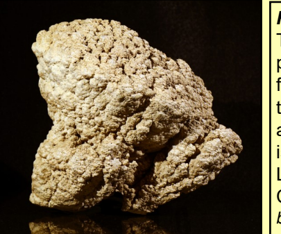
Figure 10 Tufa This interesting, porous, irregular formation is a bit of tufa that formed around hot springs issuing into Mono Lake, in northern California.