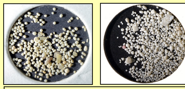
Figure 5 Oolitic Sand The photo on the left is oolitic sand from a beach at Cat Cay, Bahamas. On the right, is oolitic sand from Oolite Beach, Great Salt Lake, Utah.

calcium carbonate is laid down in concentric layers, forming small spheres. When ooids reach about 2mm in diameter, they are too big to be easily rolled about, and they stop growing, to be buried by newly-forming ooids.