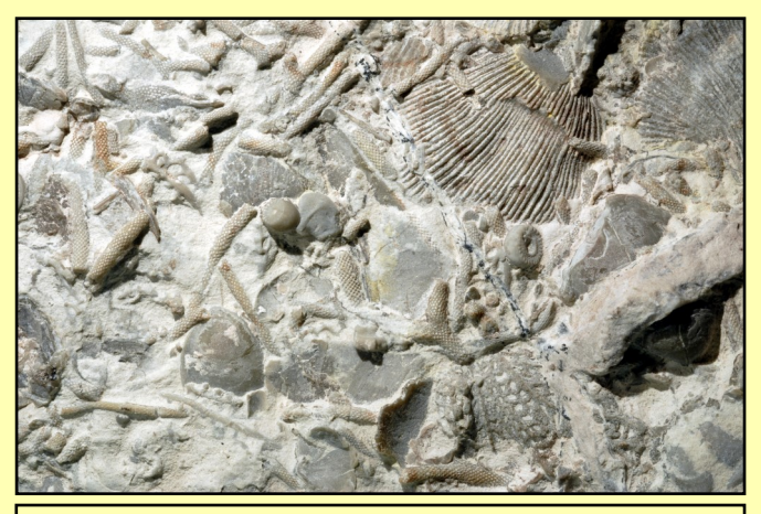
Figure 4 Fossiliferous Limestone This slab of the Naco Formation (Pennsylvanian-aged), from near Kohl's Ranch, Arizona is chock full of visible brachiopods, crinoids, bryozoans, and more.

<u>Oolitic LImestone</u> is largely composed of oolites (ooids), small, spherical balls of calcium carbonate, or other mineral. See Figure 5-7.