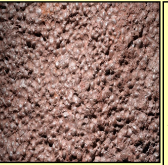
Figure 7 Oolitic Iron Ore This is the Silurian-aged Clinton Ironstone of Pennsylvania. In this case, the ooids are composed of hematite (iron oxide). In the literature, hematite ooids form either by direct precipitation, or by replacement of originally carbonate ones. Photo by Stan Celestian

Figure 6 Oolitic Limestone This is a famous oolitic limestone building stone, from Oolitic, Indiana. The town was originally named Limestone, but the Post Office denied that name, as another Indiana town already had that name. Notable structures built of this limestone include: Empire State Building, Pentagon, Washington National Cathedral, Yankee Stadium, and 35 of the 50 state capitol buildings ( Wikipedia ). You will probably have to enlarge the screen view (200-400x) to see the oolites. Photo by Stan Celestian