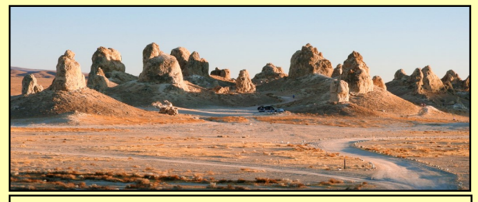
Figure 9 The Pinnacles These tufa towers, near Ridgecrest, CA, formed around springs issuing into a large pluvial lake that occupied this basin during the Pleistocene.

Travertine Environment of Deposition : Travertine is deposited in caves and springs (usually hot). Upon emergence at the surface, highly mineralized water, will degas, lowering the partial pressure, and inducing precipitation. At higher temperatures, aragonite is the mineral deposited; while at lower temperatures, calcite is the mineral. Since deposition may be episodic, and the waters are generally intimately associated with surface conditions, the chemistry of the water changes frequently, resulting in impurities creating color banding.