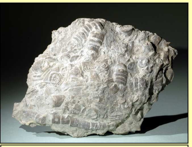
Figure 3 Fossiliferous Limestone This is a specimen of the Redwall Limestone, a Mississippianaged formation renowned for abundant crinoid fossils.