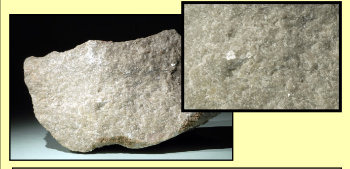
FIGURE 1 Redwall Limestone This is a coarse-grained crystalline limestone, formed by the accumulation and re-crystallization of crinoid fragments.

Crystalline Limestone Environments of This rock most typically Deposition: forms in shallow, relatively quiet, warm, ocean environments -- such as on the continental shelf -- remote from the influx of stream-introduced sands and muds. Occasionally, it forms in mineralized lake environments. The calcite is either directly precipitated from the water, or is secreted by algae or coral. Very, very fine-grained rocks were probably deposited in hypersaline and anoxic lagoons.