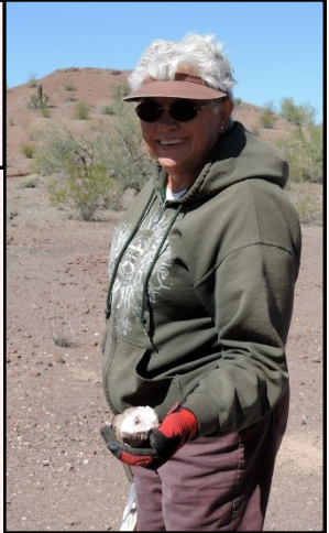
Gila Mts continued on page 4.....