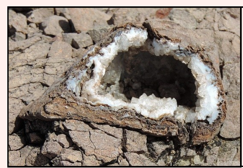
FIGURE 11 Geode lined with quartz crystals, embedded in basalt.

On Wednesday, March 23rd, Stan Celestian led a club trip to the Gila Bend Mountains, in the vicinity of 4th of July Butte, in search of drusy quartz and banded agate. A good time was had by all ©. See Figures 11-23.