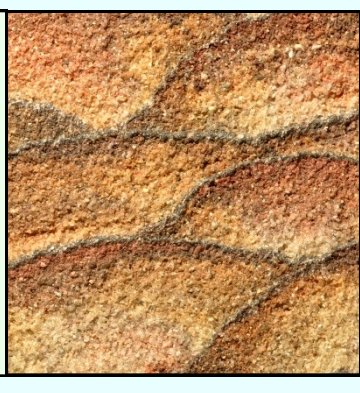
FIGURE 7 Quartz Sandstone aka Kanab Wonderstone This is a close-up view of the Jurassic-aged Navajo Sandstone — another dune sand, that (like Figure 6) has been stained by iron-rich water. Photo by Stan Celestian

near Forest Lakes Arizona. It has been permeated by iron-rich groundwater, that stained the rock with pink-red banding. Photo by Stan Celestian