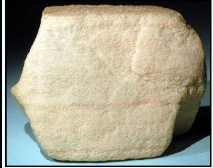
FIGURE 5 Quartz Sandstone The purity of this rock is reflected in the white color. This is the Coconino Sandstone, a Permian dune deposit.

Quartz is an extremely hardy mineral at Earth's surface. It is hard, with very strong atomic bonds, and does not cleave. As a result, quartz will persist, while feldspars, micas, amphiboles, and pyroxenes break down and weather away. Remember the Rock Cycle? Sedimentary rocks containing quartz may recycle over and over again — and each time, the percentage of quartz goes up.