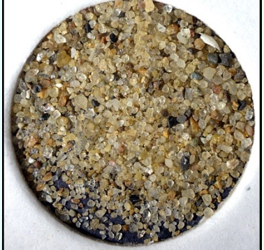
FIGURE 8 Fluvial Sand — a River Sand Bar at Falls of the Ohio, IN This sand reflects a lot of weathering and transportation angular to rounded quartz grains, with few of other minerals. Stream sands will

Quartz Sandstone Environments of Deposition : Quartz Sandstone is typical of very selective environments, such as marine and lake beaches, stream bars, barrier islands, and dunes. See Figures 8-10, for pictures of future quartz sandstones.