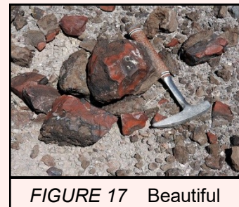
jasper also litters the desert floor.