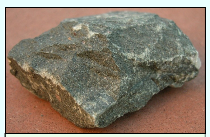
FIGURE 2 Graywacke Image from nasa.gov/mer/classroom/schoolhouse/rocklibrary/index2.htm

Since water is much thicker than air, when the sediments of a turbidity current come to rest in the quiet depths, the fragments settle out by size — the largest particles settle out first, and progressively finer and finer particles settle out. This produces a sedimentary structure called graded bedding (a subject for a later article). Sequences of turbidity current deposits are called turbidites .