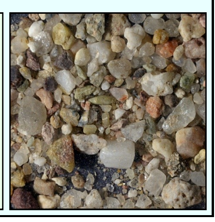
FIGURE 4 Arkosic sand in San Pedro River, Arizona This coarse, poorly-sorted sand is "dirty" with visible angular to sub-angular chalky feldspar comingled with quartz and rock fragments.

Quartz Sandstone is sandstone that is composed of mostly quartz sand grains. While quartz is a major component of all sandstones, these are over 95% quartz. See Figures 5-7 (increase the size of your onscreen view for a near-microscopic look).