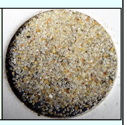
FIGURE 9 Dune Sand. Indiana Dunes. IN Wind is a VERY selective transporter — it will moves only a narrow range of sand sizes. The result is a finegrained sand of rounded frosted and grains.